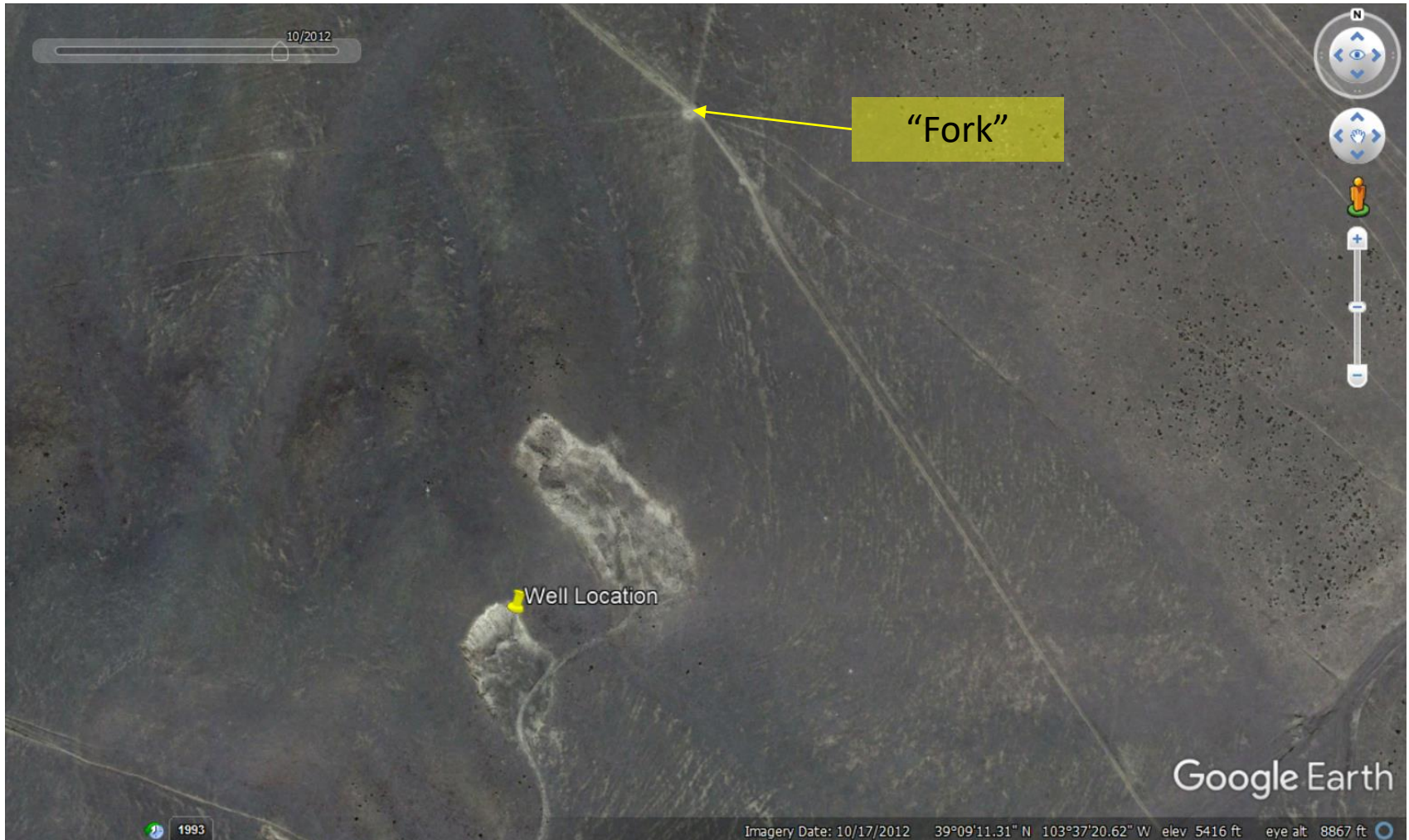
Photo 9: Historic aerial imagery dated 10/17/2012. Well was spud 3/19/2014. Photo shows access road leading to the location from the fork seen in photo 8 was not pre-existing.