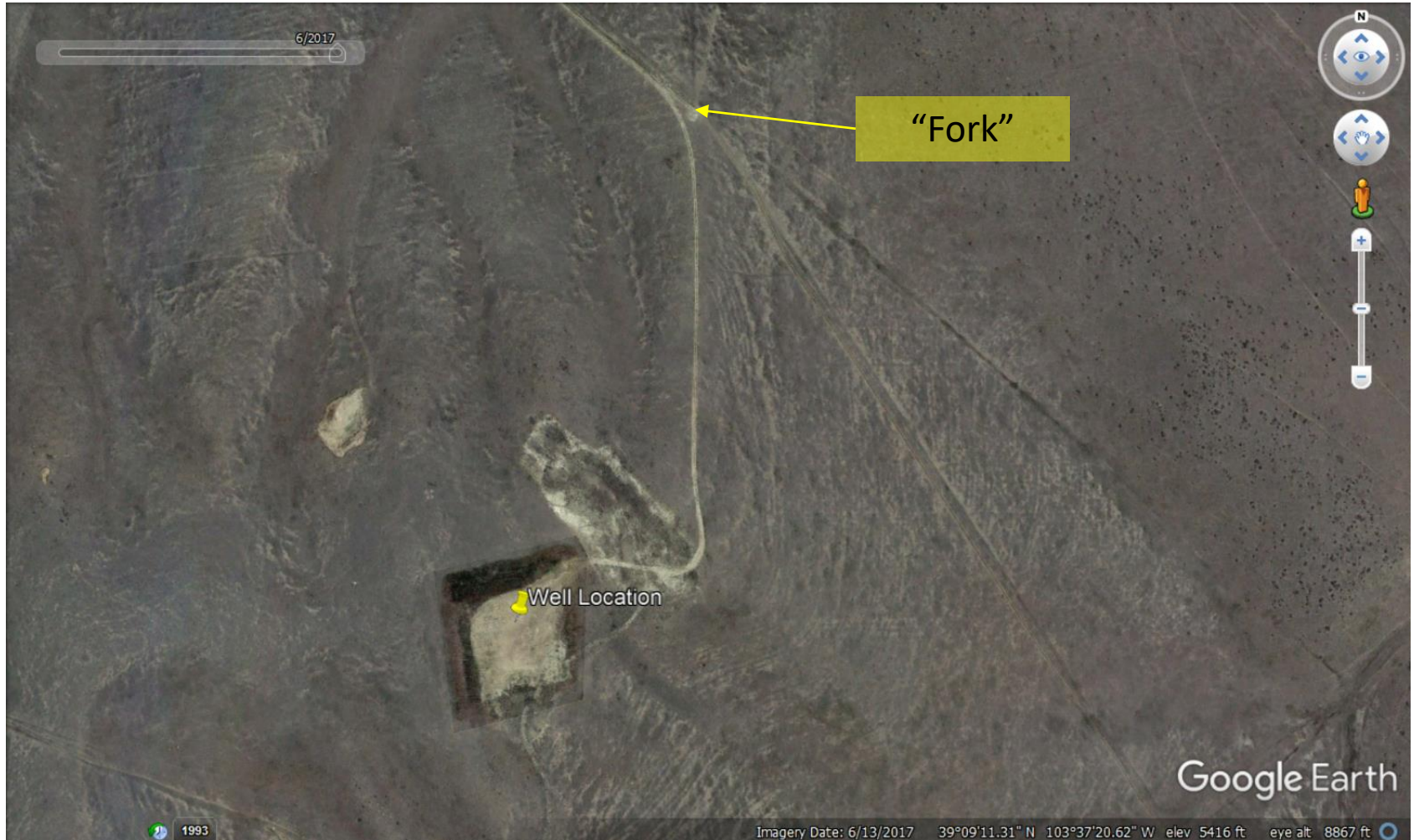
Photo 10: Most current, available aerial imager, dated 6/13/2017. Photo shows access road remains after the plugging and abandonment of the location.