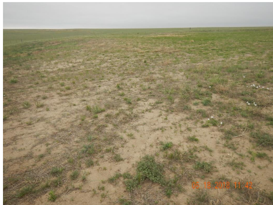
Photo 2: Photo taken from the northeast corner of the location, facing west. See comments under photo 1.