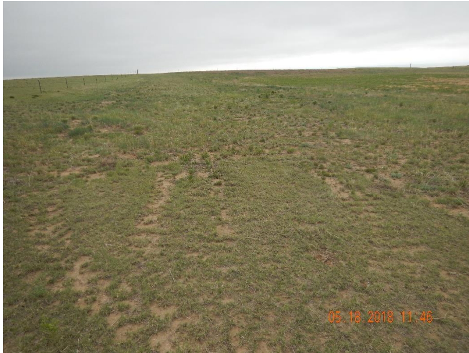
Photo 3: Photo taken from the southwest corner of the location, facing north. See comments under photo 1.