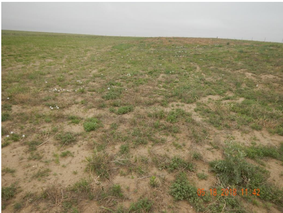
Photo 1: Photo taken from the northeast corner of the location, facing west. Photo shows reclamation of the well location appears to be progressing towards reclamation standards and requirements; desirable vegetative germination and establishment evident.