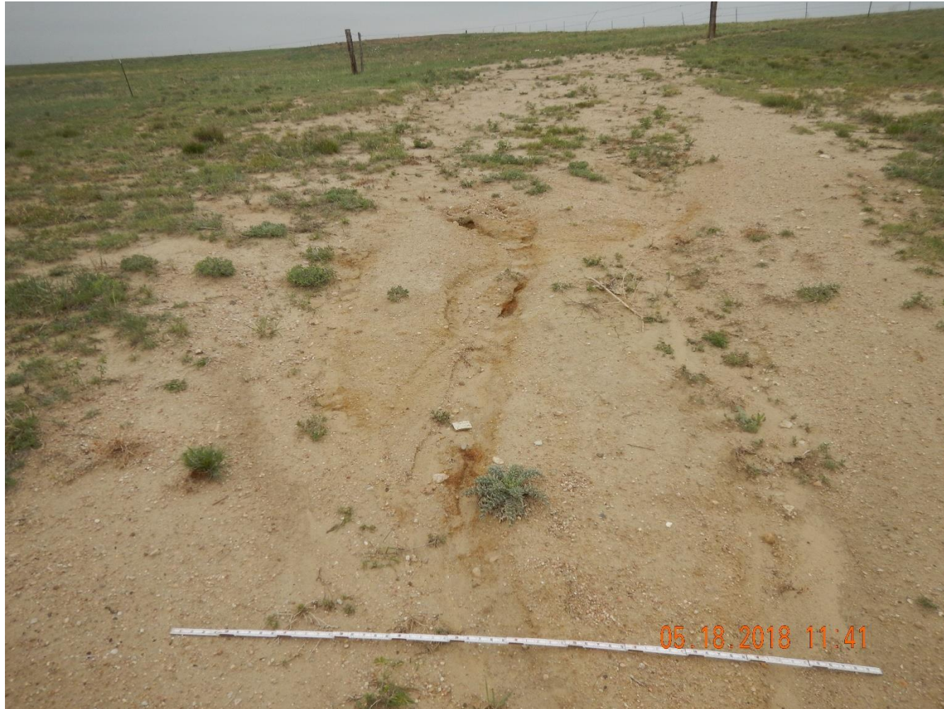
Photo 9: Photo taken from the access road to the immediate east of the location. Photo shows stormwater erosion degradation occurring along access road. 6 foot measuring stick for reference.