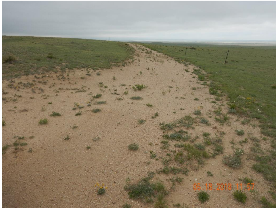
Photo 7: Photo taken from where the access road turns from south to west, facing north. Photo shows the access road has not been reclaimed and still remains.