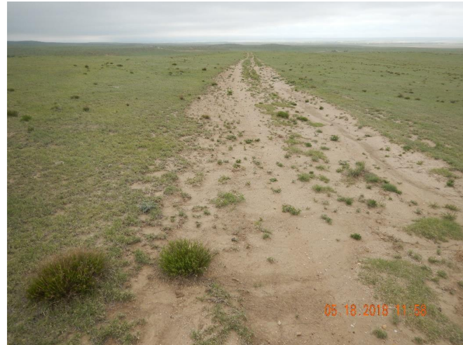
Photo 8: Photo taken from the access road, facing north. Photo shows the access road has not been reclaimed and still remains.