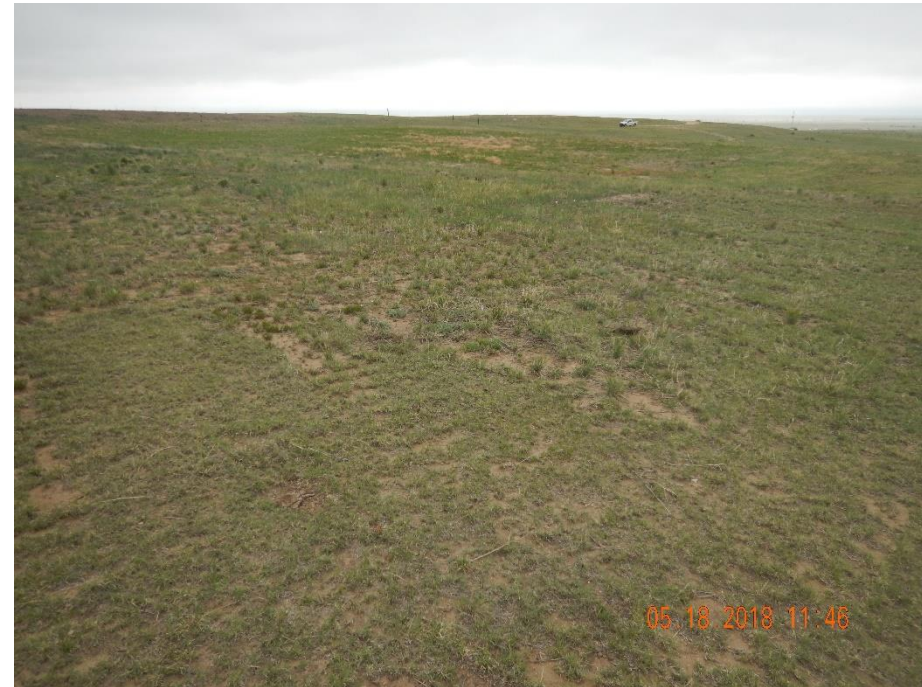
Photo 4: Photo taken from the southwest corner of the location, facing northeast. See comments under photo 1.