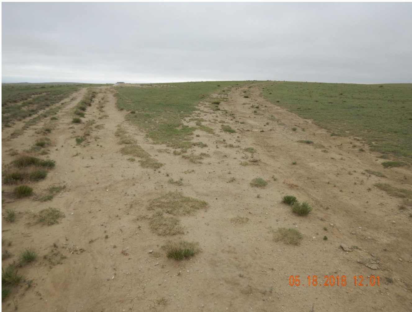
Photo 10: Photo taken from the fork of the road to the northeast of the location. The portion of road veering to the right at the fork is the oil and gas access road leading to the location. The section of road to the left appears to be a portion of the road that pre-existed the oil and gas location and access road.