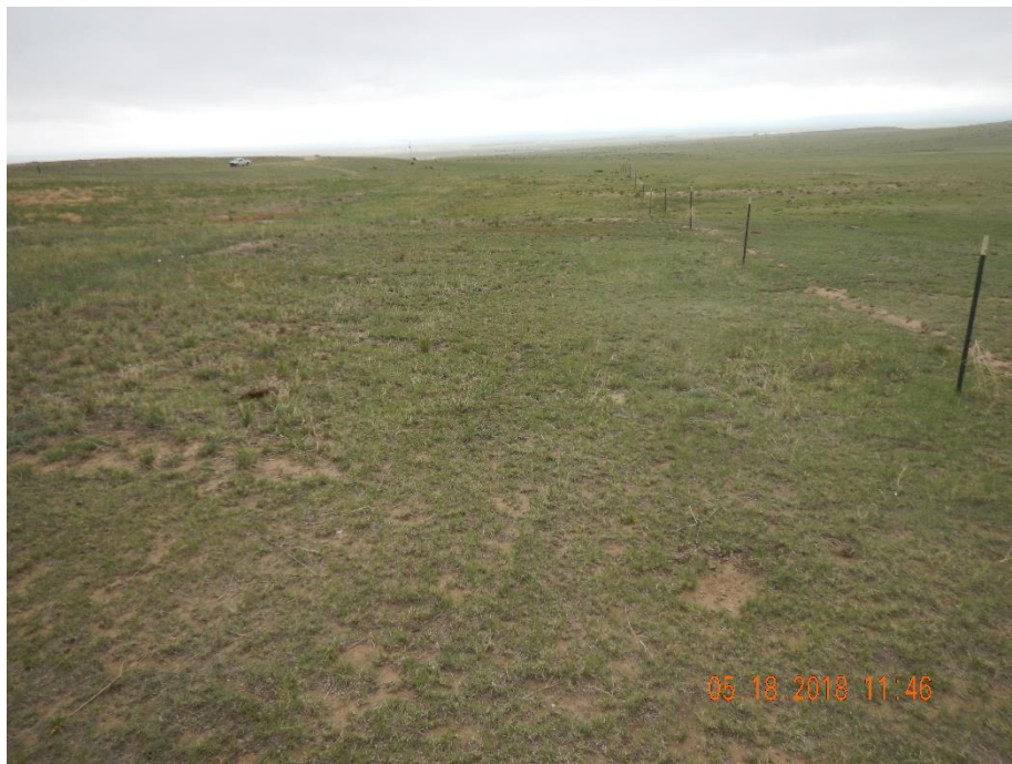
Photo 5: Photo taken from the southwest corner of the location, facing east. See comments under photo 1.