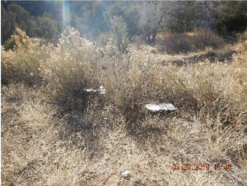
Photo 7: Insulation along NW perimeter of location previous inspection.