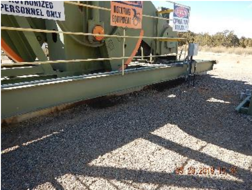
Photo 5: Impacted soil and gravel along concrete base of pump jack previous inspection.