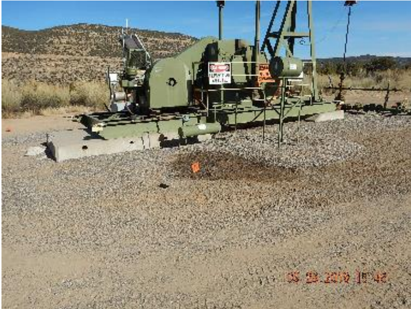
Photo 3: Impacted soil and gravel NW side of pump jack previous inspection.