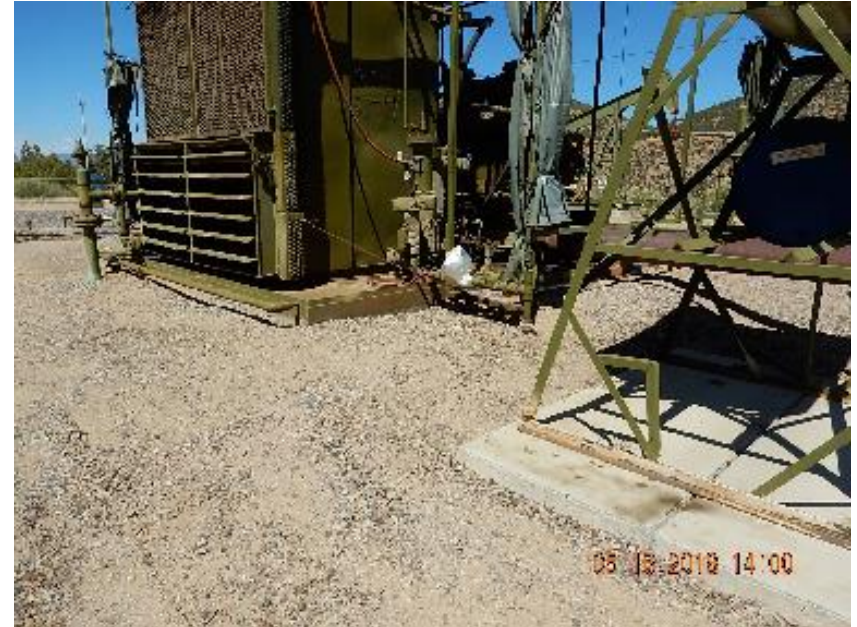
Photo 10: Mediated soil and gravel on S and SW sides of compressor unit.