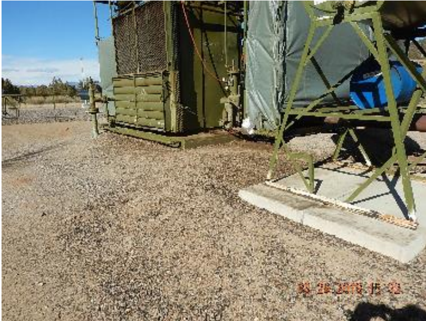
Photo 9: Impacted soil and gravel on S and SW side of compressor unit previous inspection.