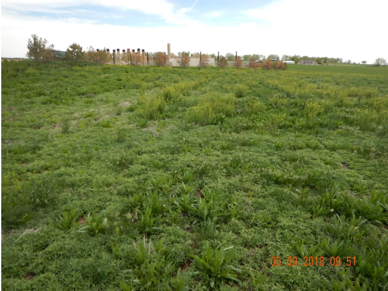
Photo 5. Photo taken from the southern location on May 9, 2018, facing East. See comments under Photo 1. This area has a high abundance of Kochia and other undesirable species.