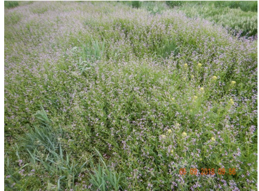
Photo 2. Photo taken from the eastern location on May 9, 2018, facing North. Photo of Chorispora tenella (Purple Mustard) which is an invasive species.