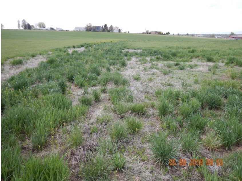
Photo 3. Photo taken from the eastern location on May 9, 2018, facing South. See comments under Photo 1.