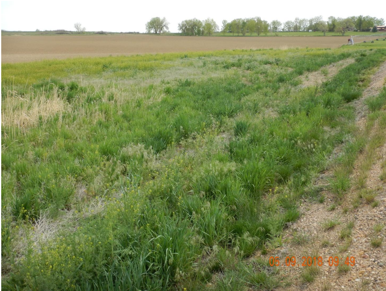
Photo 9. Photo taken from the northern location on May 9, 2018, facing East. See comments under Photo 1.