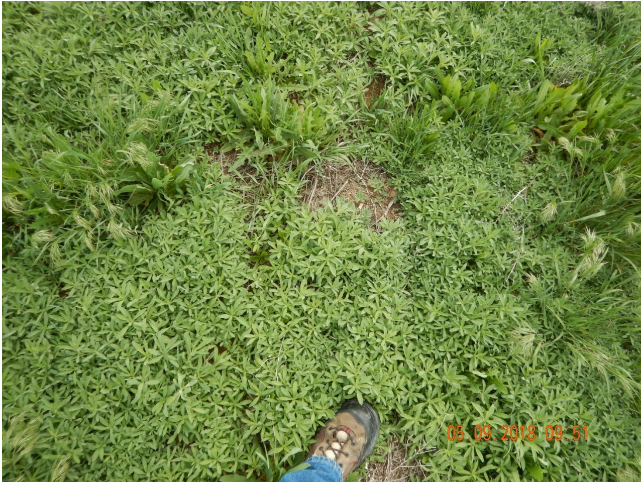
Photo 6. Close-up photo taken from the previous photo location (Photo 5). Photo illustrates the Kochia rosettes and cheatgrass with little, to no, establishment of desirable species.