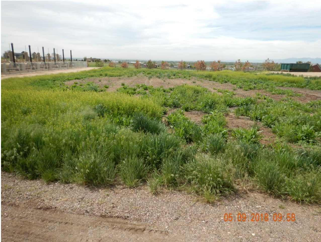
Photo 11. Photo taken from the central location on May 9, 2018, facing South. See comments under Photo 1.