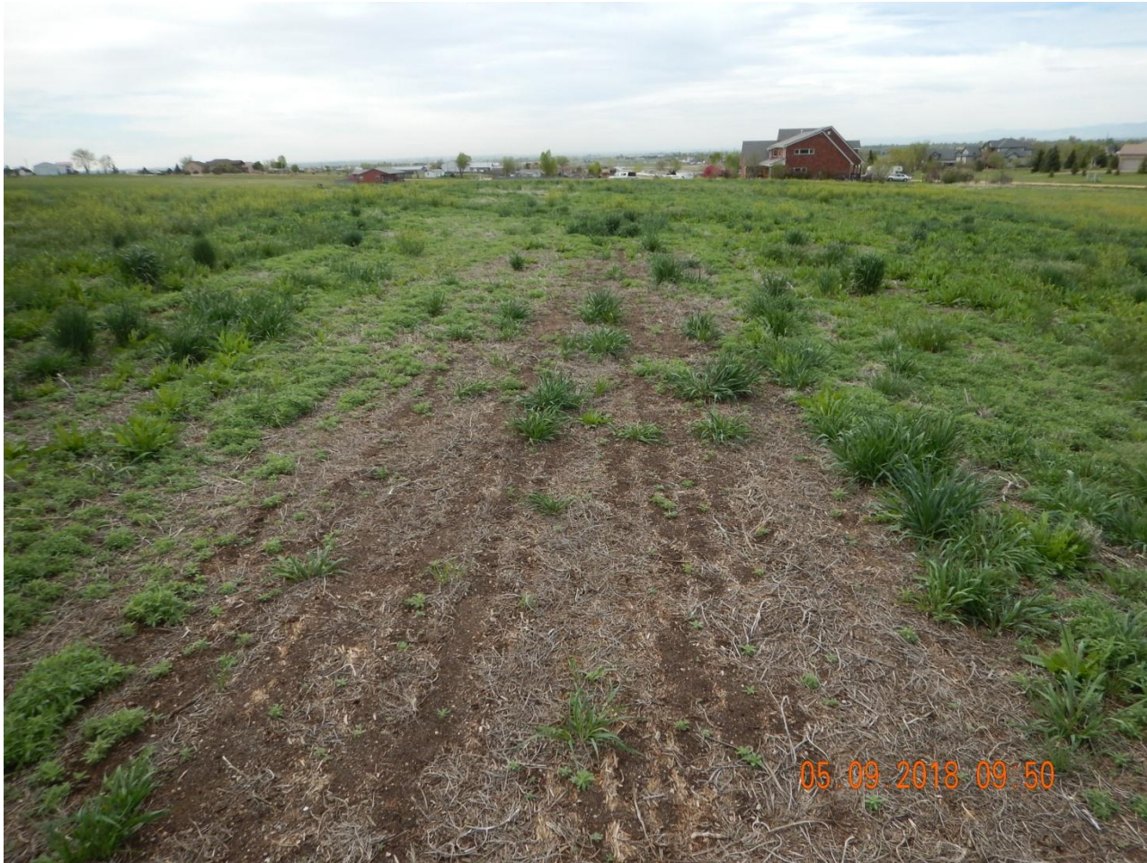
Photo 7. Photo taken from the western location on May 9, 2018, facing South. See comments under Photo 1.