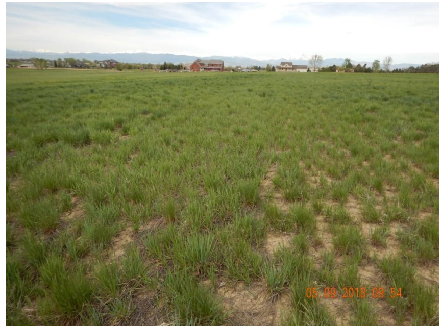
Photo 4. Photo taken from the southeastern location on May 9, 2018, facing West. Photo illustrates establishment of desirable species. This area does not appear to need additional reclamation activities.