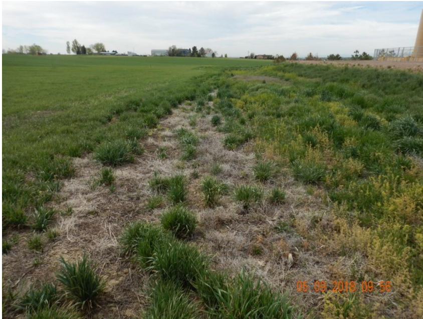
Photo 1. Photo taken from the northeastern location on May 9, 2018, facing South. Operator failed to perform interim reclamation activities by 4/30/18. Interim reclamation areas are not reflective of reference area vegetative levels. Undesirable weed species were observed throughout and there is not uniform establishment of desirable species.