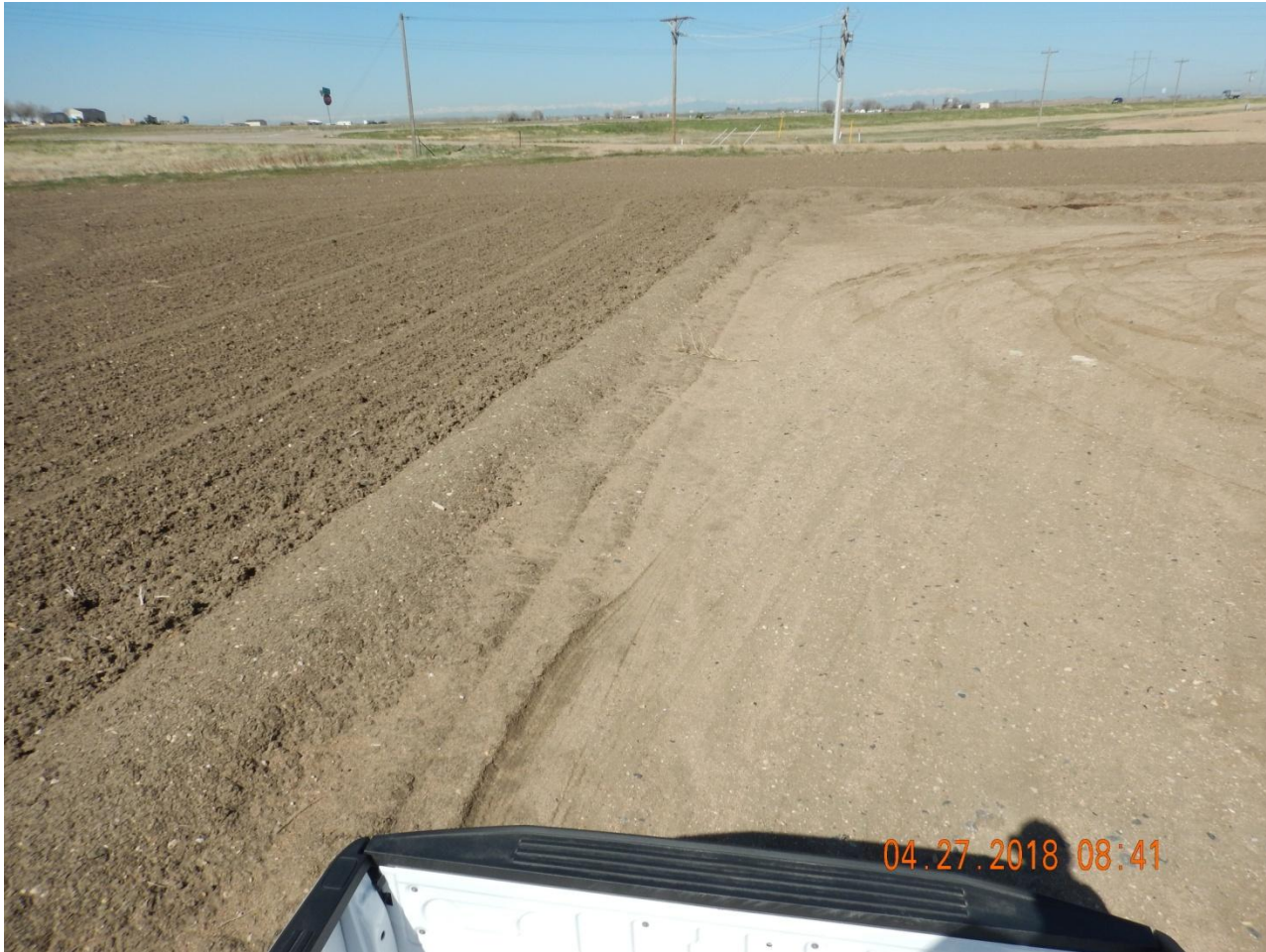
Photo 4. Photo taken from the southern well pad area, facing West. See comments under Photo 1.