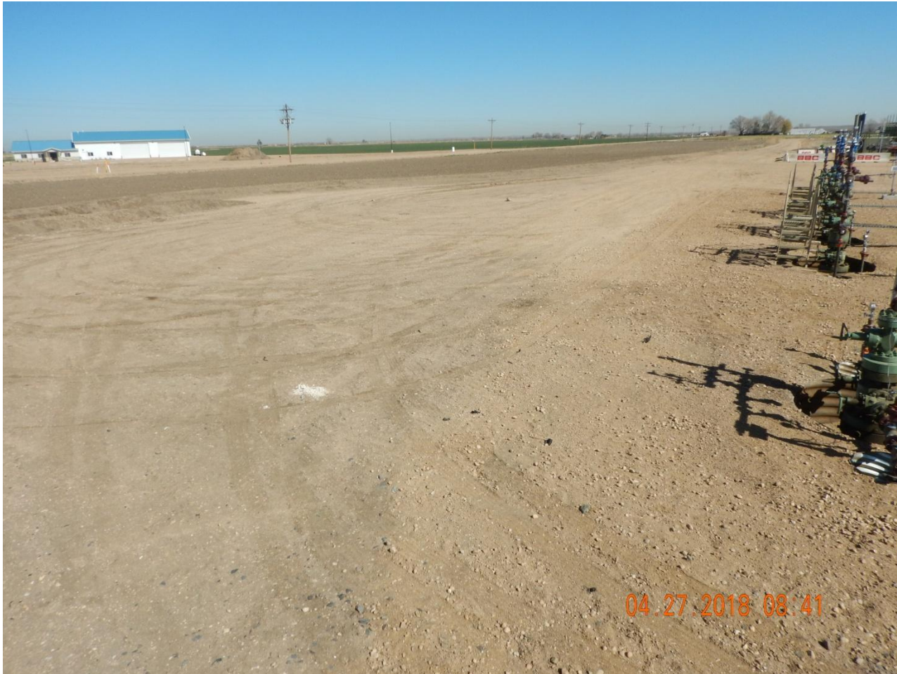
Photo 1. Photo taken from the southern well pad area, facing Northwest. Appears the Operator has performed interim reclamation activities to reduce disturbance areas only needed for production operations. A follow-up interim reclamation inspection will be conducted at a future date to ensure compliance with Rule 1003.