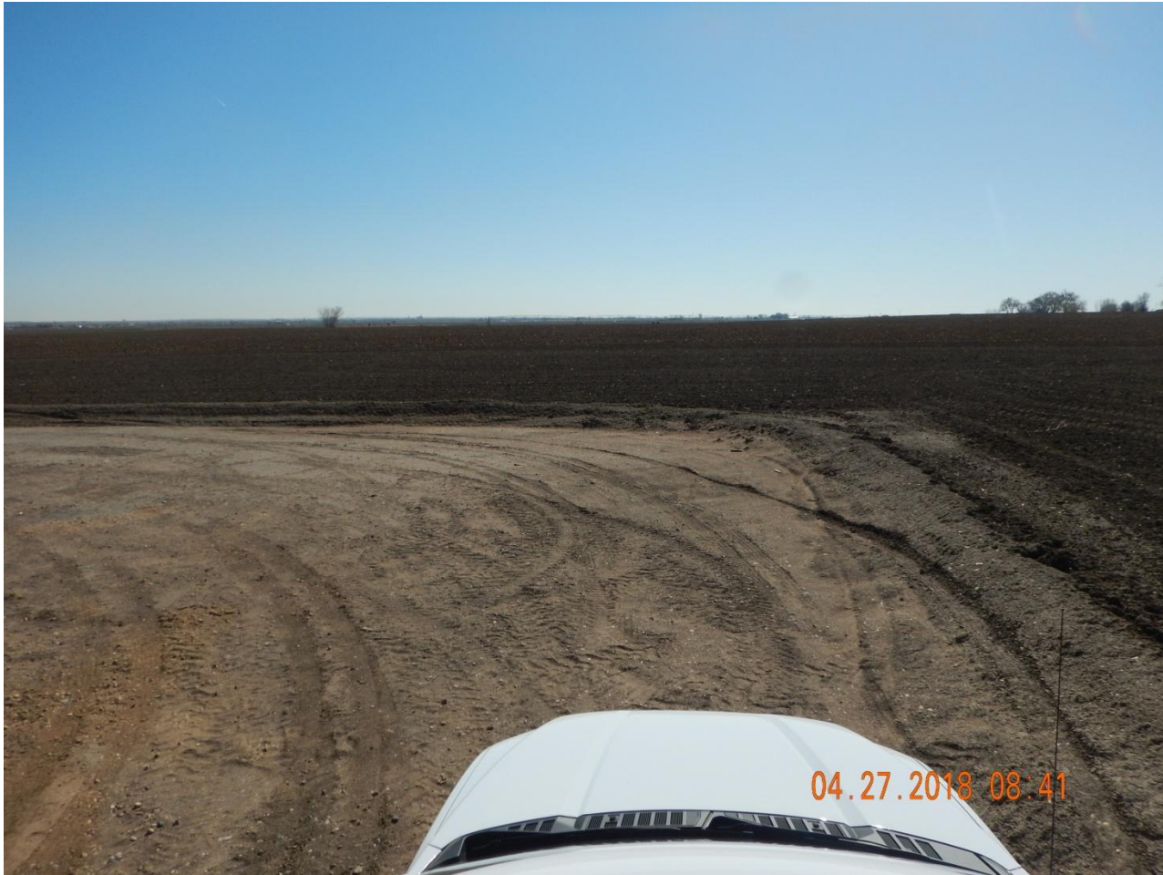
Photo 3. Photo taken from the southern well pad area, facing East. See comments under Photo 1.