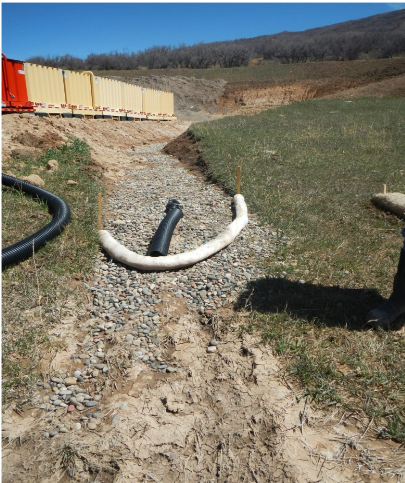
Photo#5: BMP outlet / discharge leading from eroding cut slope, showing sediment migration.. April 18, 2018