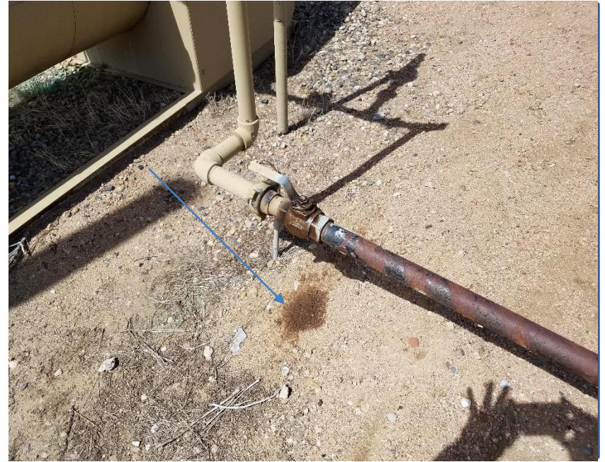
Photo 3. Stained soil near heated treater under valve