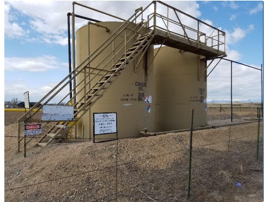
Photo 2. Tank battery