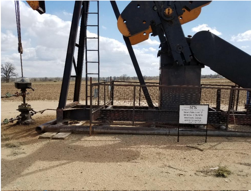
Photo 1. Wellhead