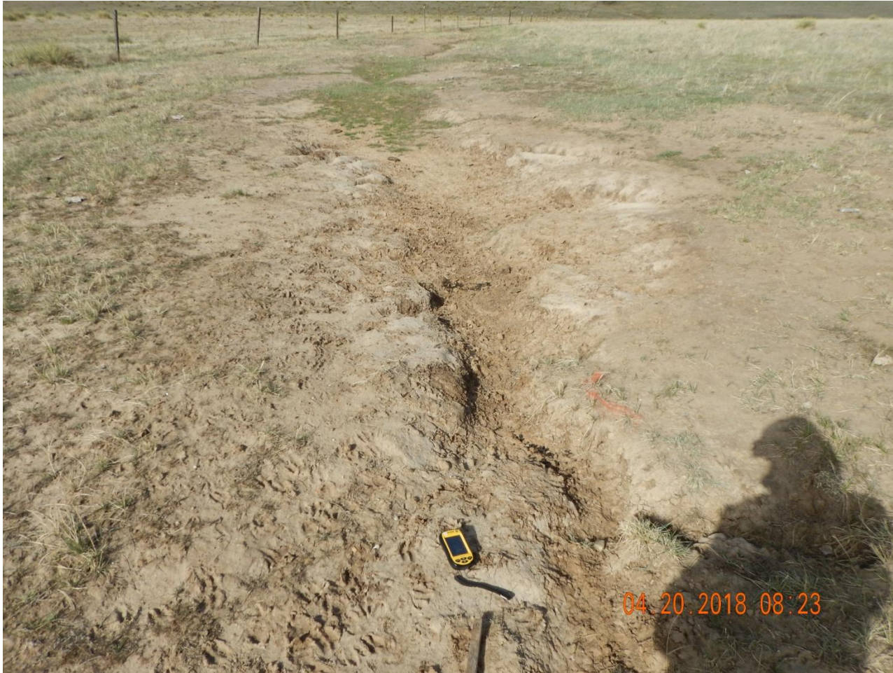
Photo 2. Photo taken from the gully erosion along the western battery location, facing West. Erosion continues west, off location.