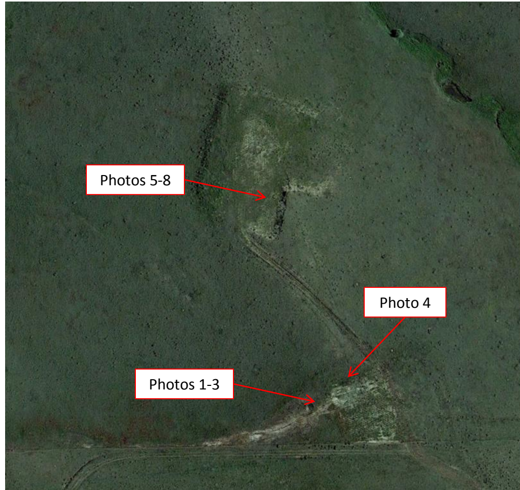
Photo reference points to help illustrate approximate locations of the subject photo during the April 20, 2018 inspection.