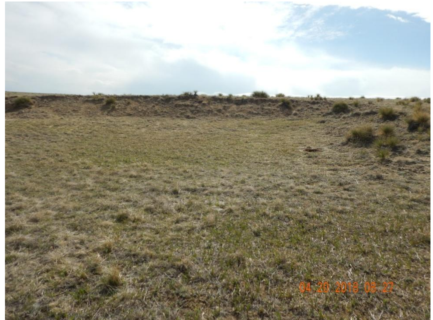
Photo 6. Photo taken of the eastern well location on April 20, 2018, facing East. Operator has failed to complete final reclamation activities.