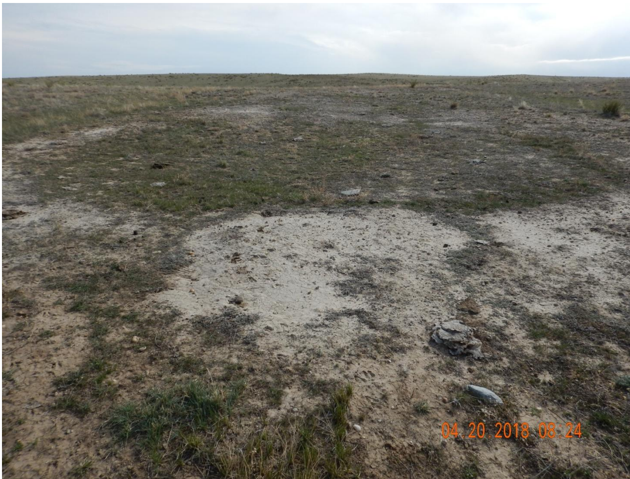
Photo 3. Photo taken from the western battery location, facing East. Vegetation at the battery location is not reflective of reference area vegetative level and does not meet Rule 1004 standards. Operator has failed to complete final reclamation activities.