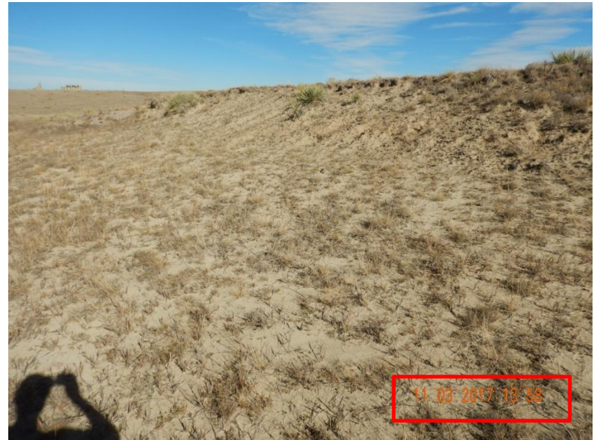
Photo 8. Photo taken from the eastern well location on November 3, 2017, facing North. See comments under Photo 6.