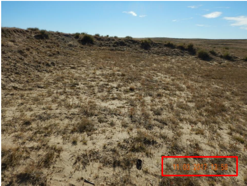
Photo 7. Photo taken from the eastern well location on November 3, 2017, facing South. See comments under Photo 6.