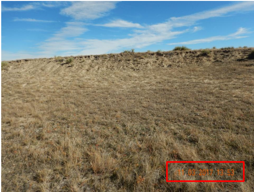
Photo 5. Photo taken of the eastern well location on November 3, 2017, facing East. Operator has not reclaimed the location per Rule 1004 standards. The location has not been contoured to match the surrounding landscape. Rill erosion evident along the eastern cut slope.