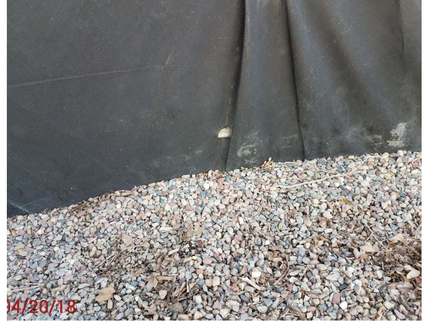
Location Photo # 6 holes in Containment