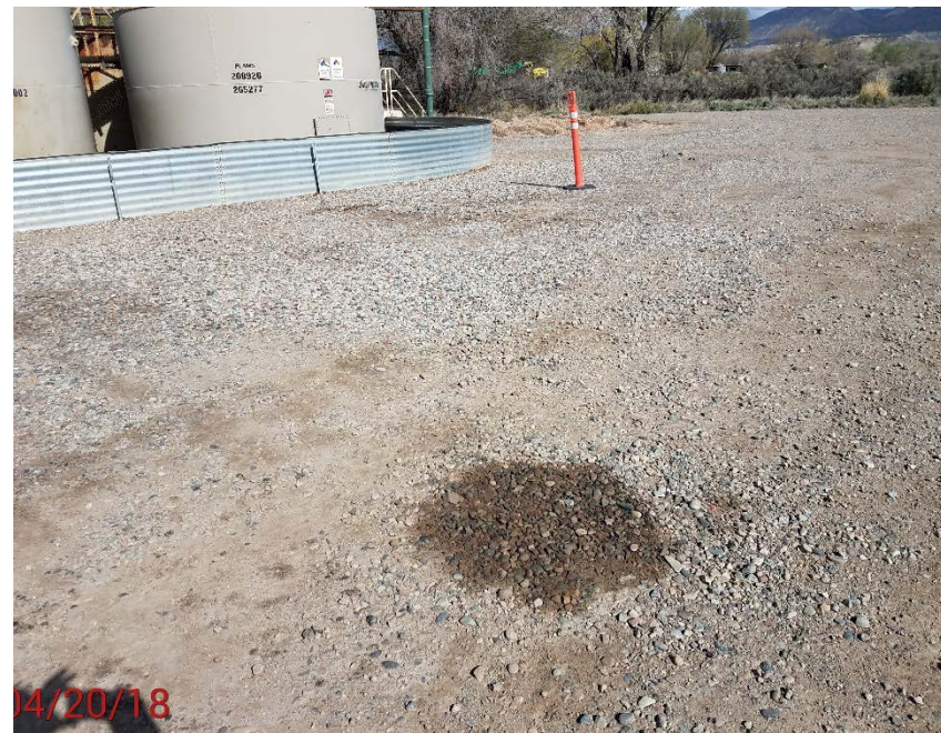
Location Photo # 8 Stained ground