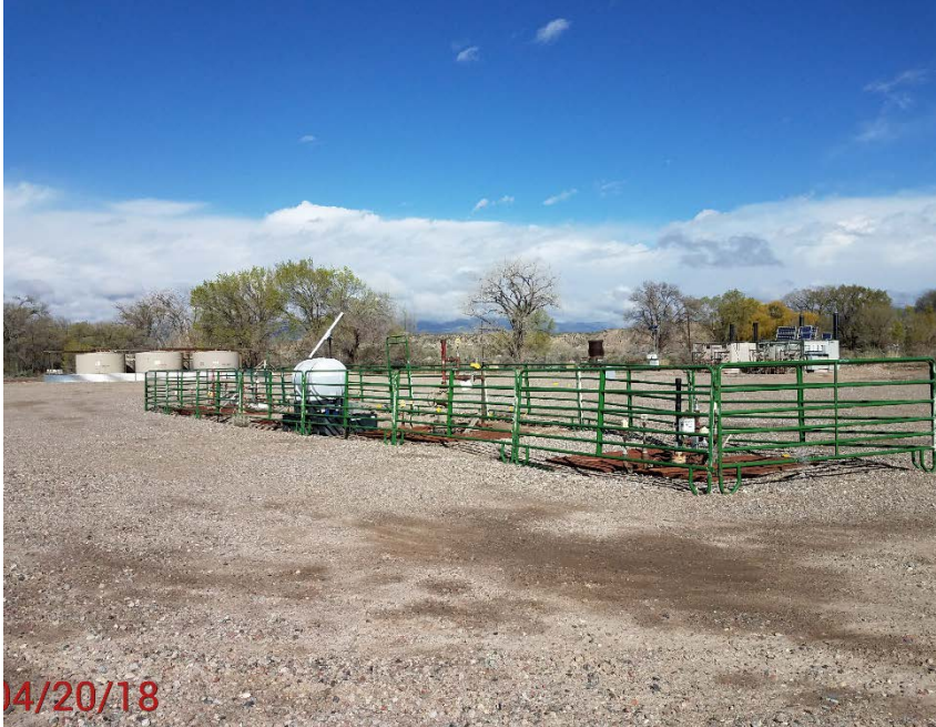
Location photo # 1