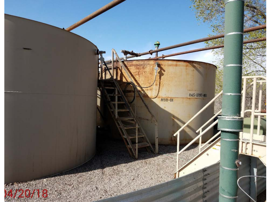
Location Photo # 2 Tank Maintenance