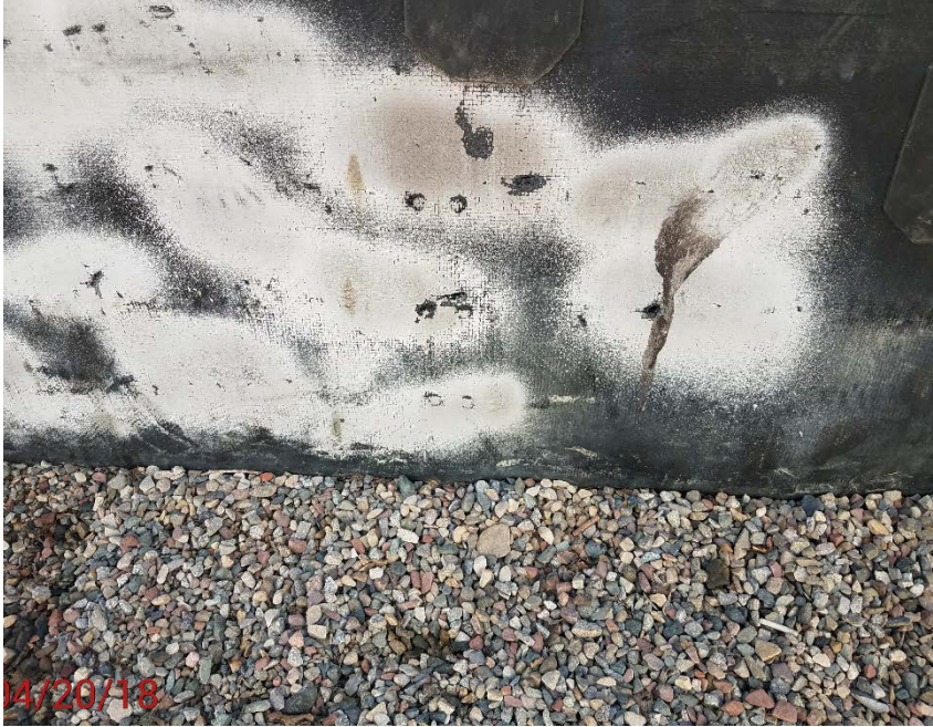
Location photo # 5 Holes in Containment