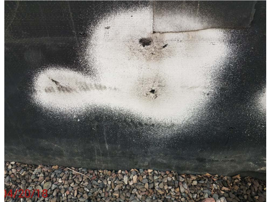
Location Photo # 4 Holes in Containment