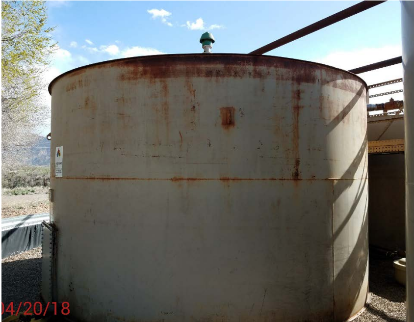
Location photo # 3 Tank Maintenance