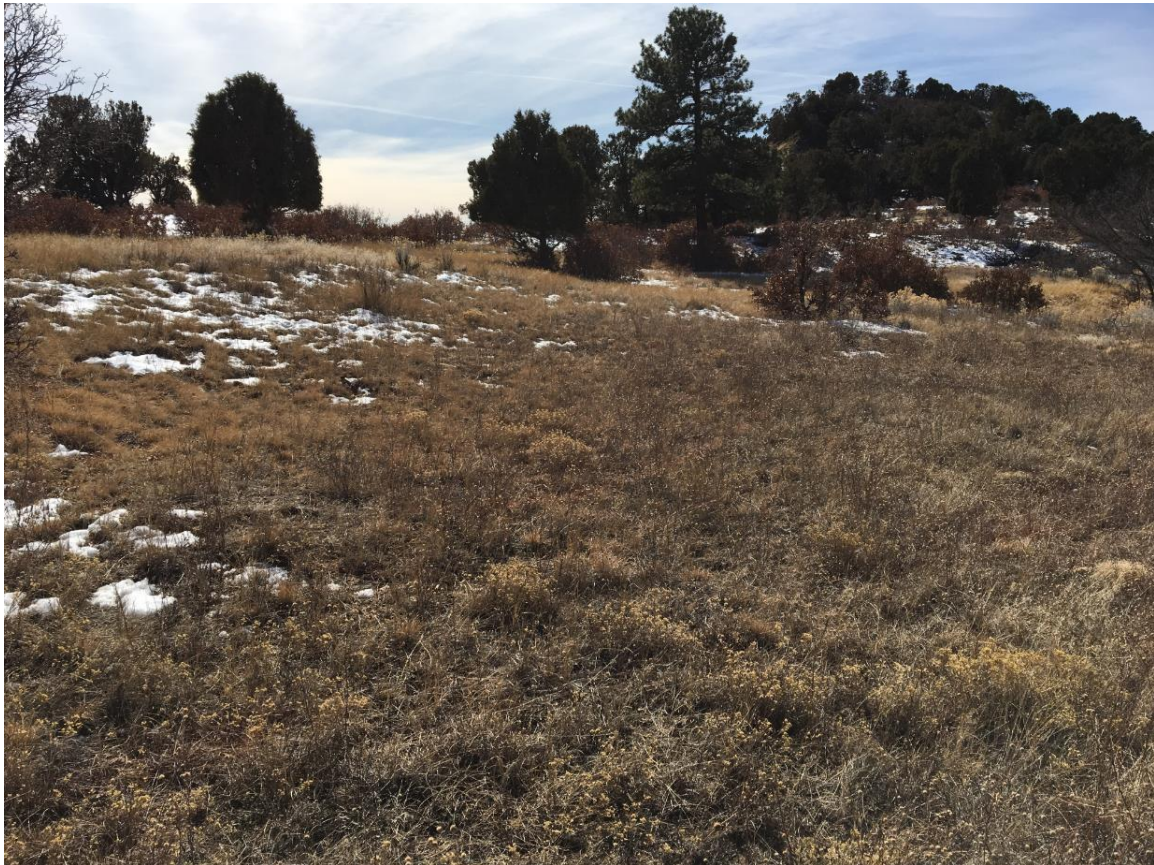
Figure 2 – Spring Creek 1-17 Location

Based on our review of available records and the assumptions stated above, it appears the subject well has been constructed and abandoned in a manner which provides sufficient isolation above the Fruitland Coal behind the production casing (Fruitland top @ ~2952' in this well).