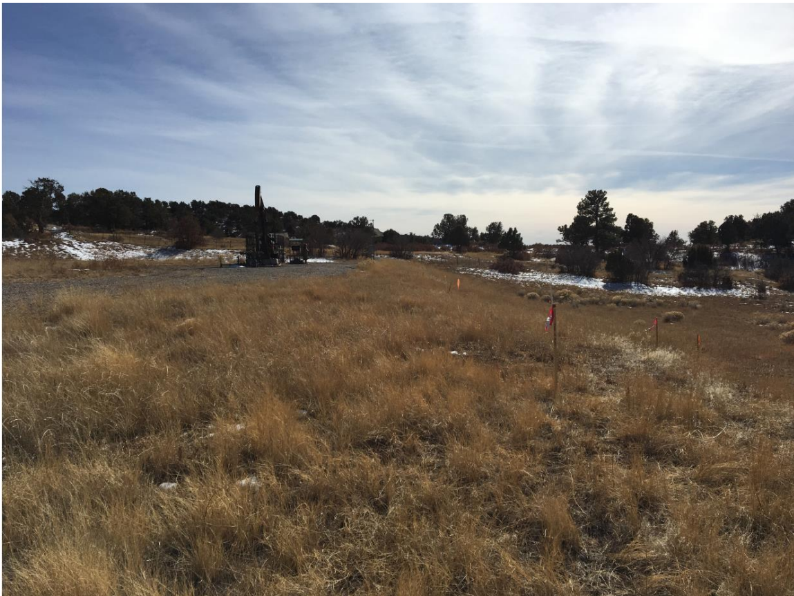
Figure 1 – Glaser Et Al 1-19U Location

Based on our review of available records and the assumptions stated above, it appears the subject well has been constructed and abandoned in a manner which provides sufficient isolation above the Fruitland Coal behind the production casing (Fruitland top est. @ ~2892' based on Secord #1 offset).