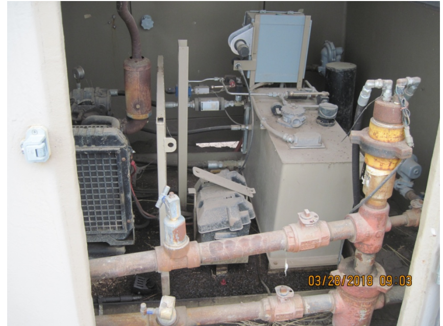
4. Smith lift system