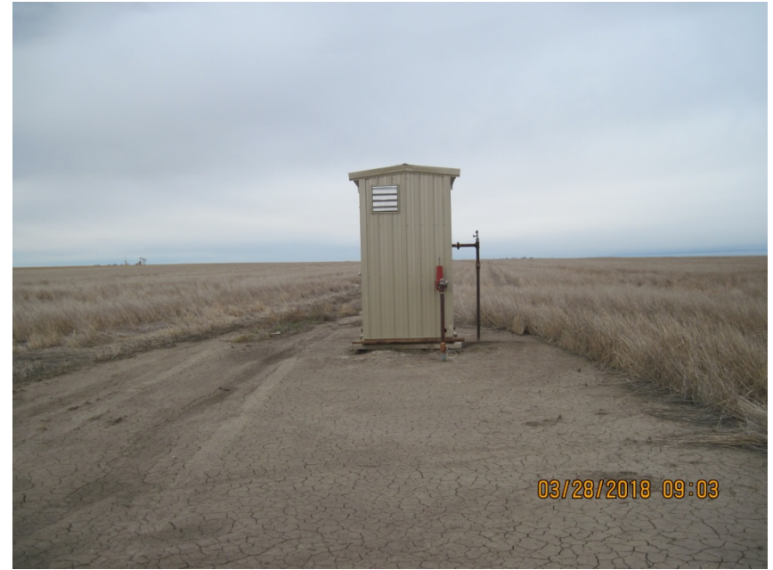
2. Meter shed