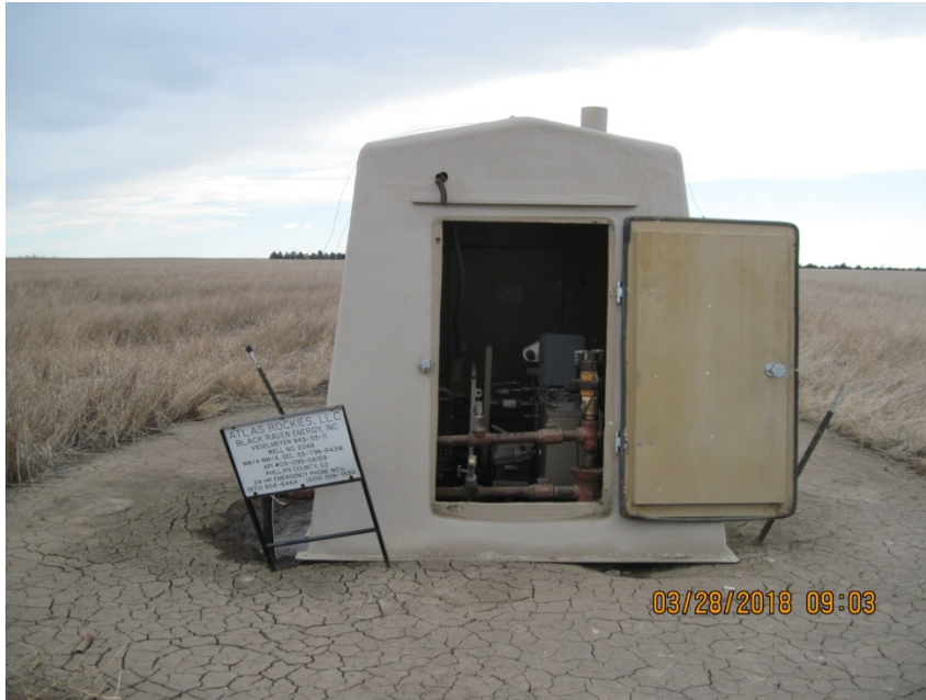
3. Wellhead and equipment