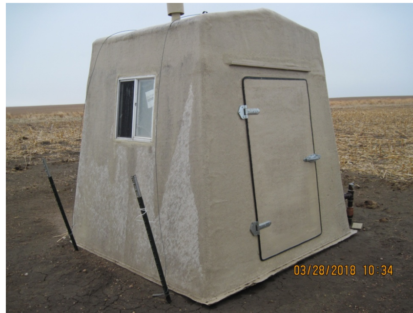
4. Fiberglass shed over wellhead and equipment