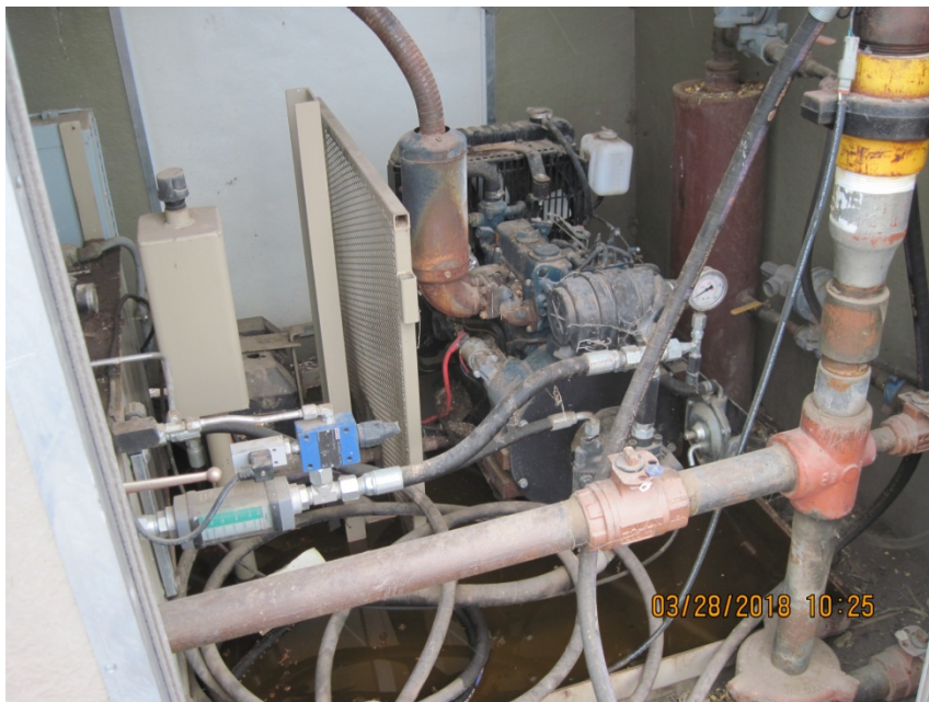
3. Wellhead equipment