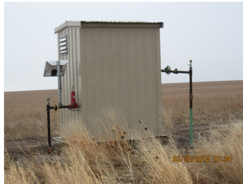
2. Meter shed