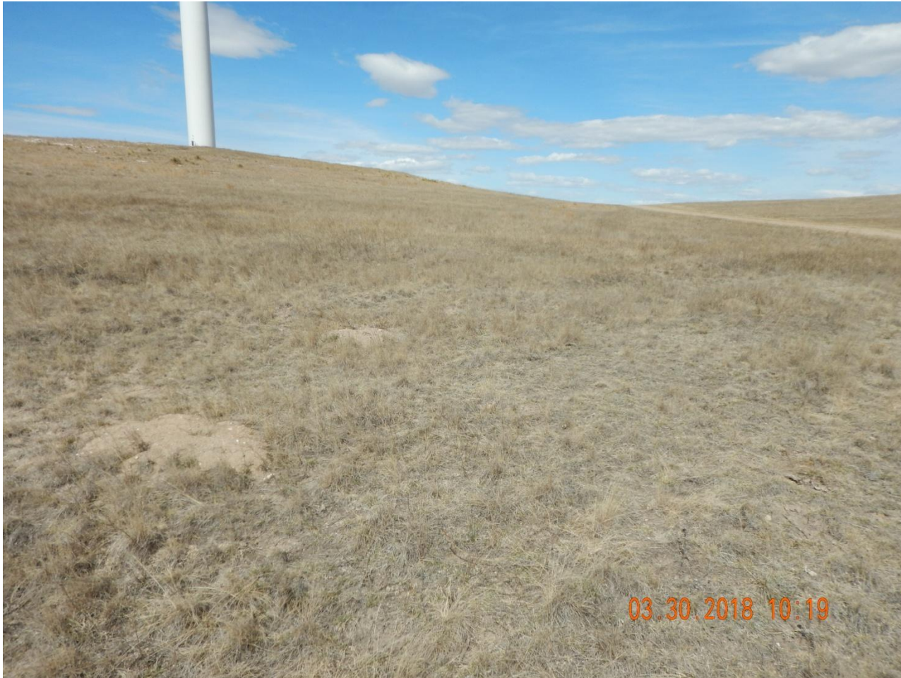
Photo 3. Photo taken from the approximate well location, facing North. Well location appears reflective of reference area vegetative levels.