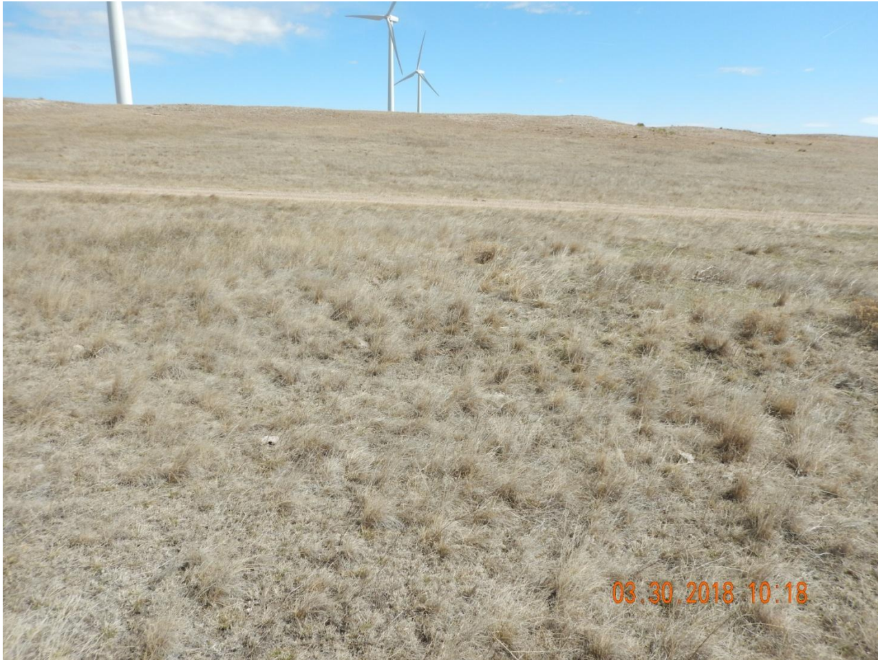
Photo 4. Photo taken from the approximate well location, facing East. Well location appears reflective of reference area vegetative levels.