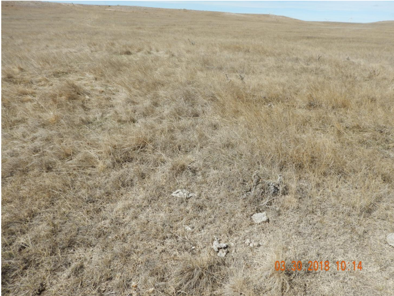
Photo 2. Reference photo taken west of the pit, facing West. Reference area vegetative growth consists of, but not limited to, Blue grama ( Bouteloua gracilis ).