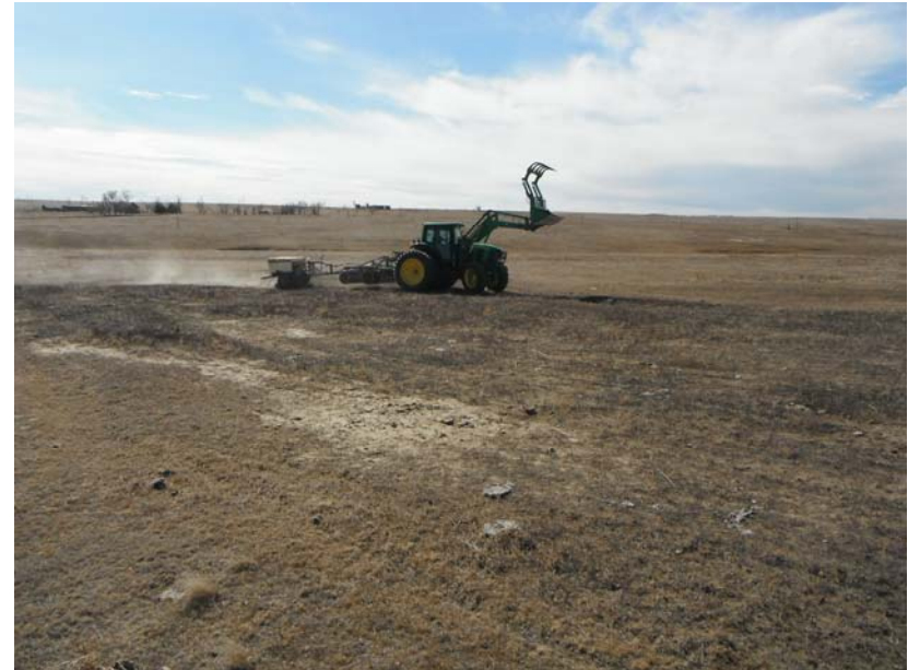
Overseeding of former wellhead area