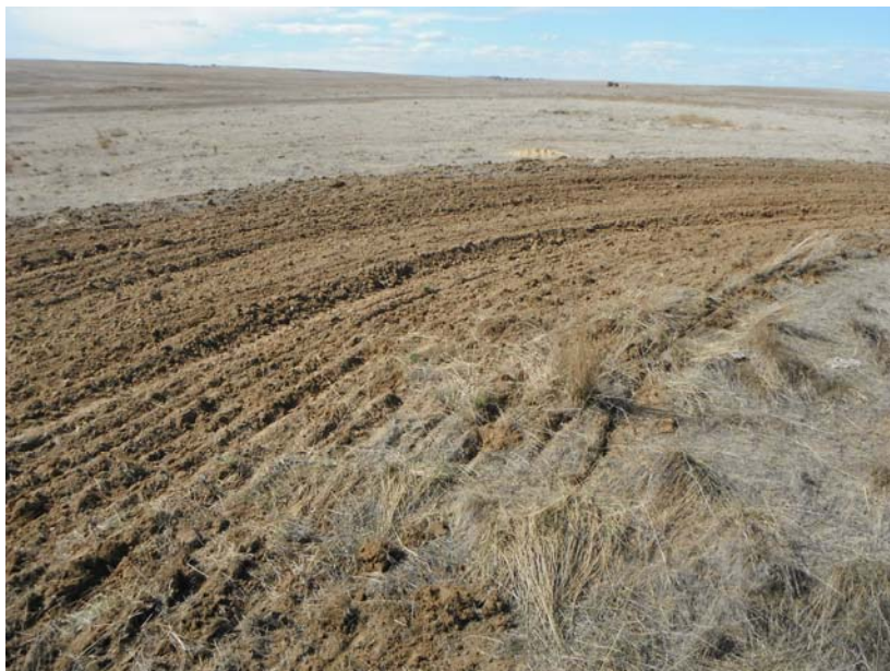
Former pit prior after reseeding