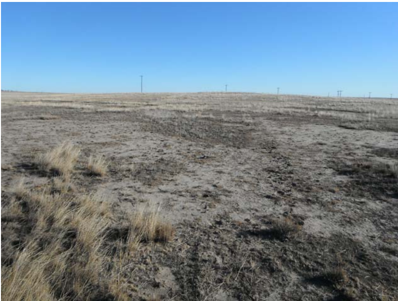
Area north of former pit prior to reclamation