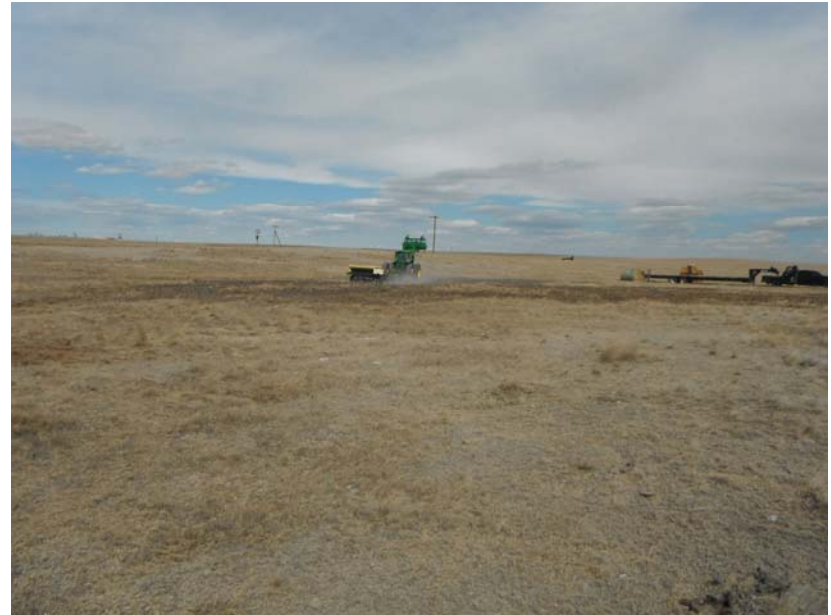
Reseeding of area north of former pit