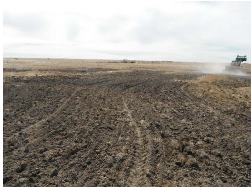
Area north of former pit after reseeding