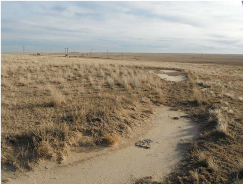
Former pit area prior to reclamation