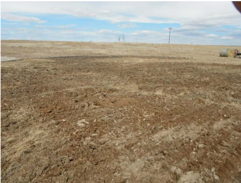
Area north of former pit after ripping