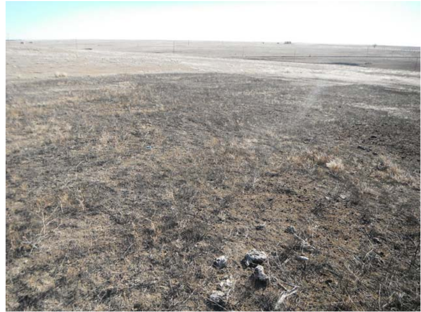
Former wellhead area prior to overseeding