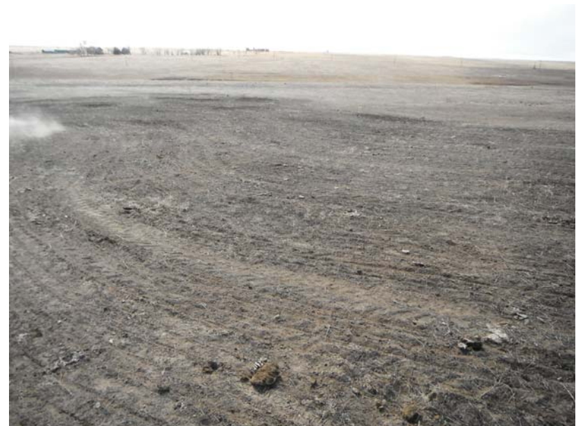
Former wellhead area after overseeding