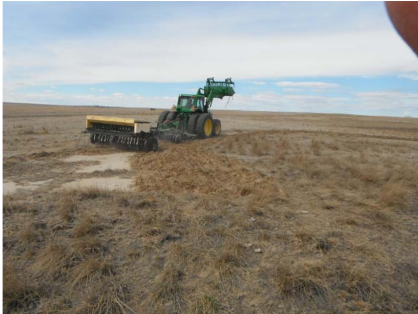
Reclamation of former pit