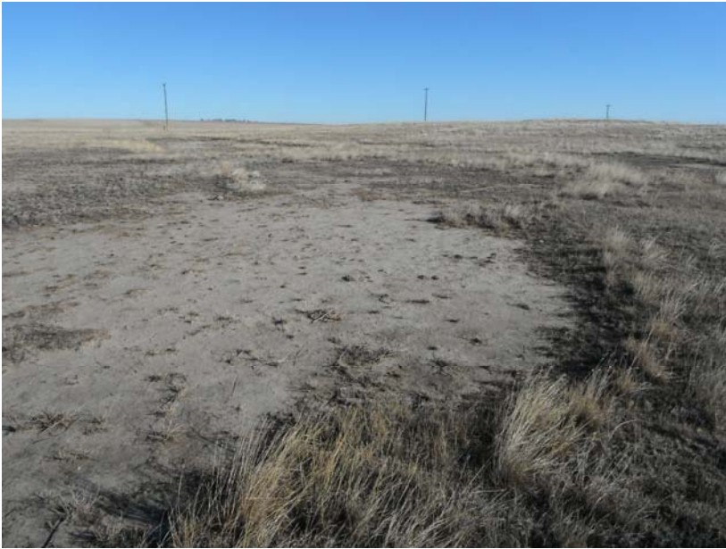
Area north of former pit prior to reclamation