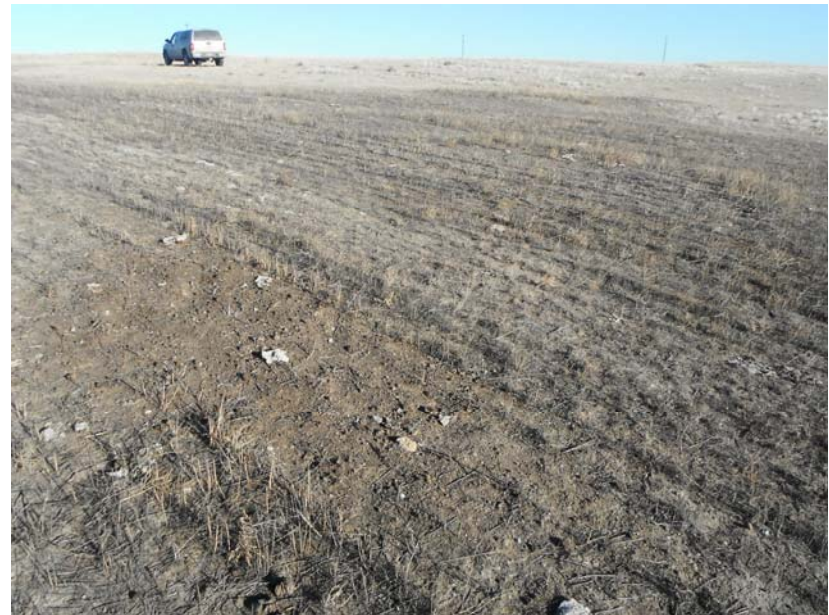
Former wellhead area prior to overseeding