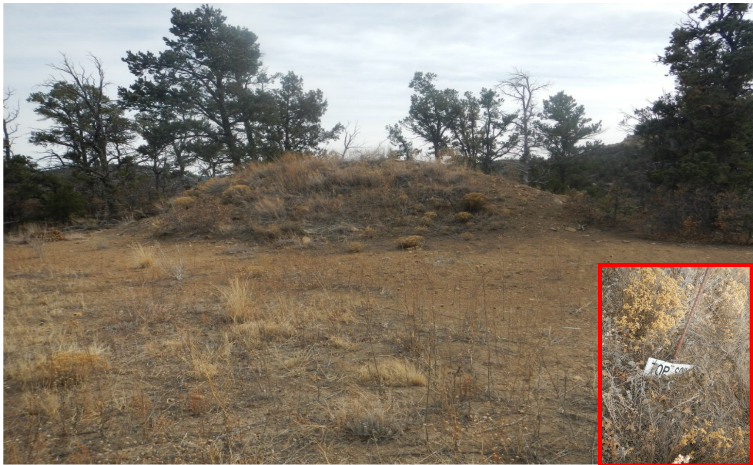
Photo#2: Unutilized topsoil stockpile. Insert is of identifying topsoil sign.