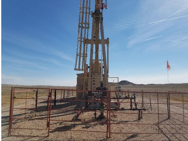
Photo 1. wellhead sign