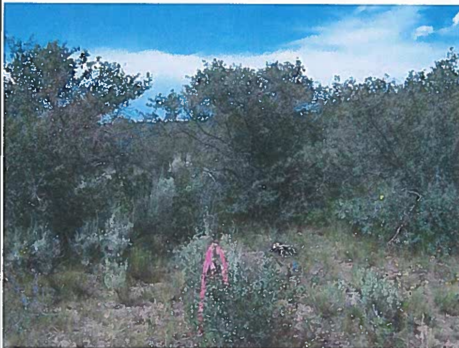
PHOTO FACING WEST, TAKEN ON AUGUST 28, 2017. NO EVIDENT CHANGES SINCE TIME OF SURVEY.