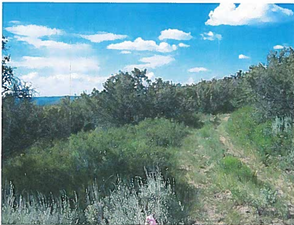
PHOTO FACING EAST, TAKEN ON AUGUST 28, 2017. NO EVIDENT CHANGES SINCE TIME OF SURVEY.