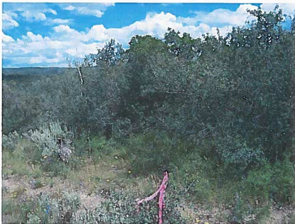
PHOTO FACING SOUTH, TAKEN ON AUGUST 28, 2017. NO EVIDENT CHANGES SINCE TIME OF SURVEY.

PLAT 8-A OMG03 696 REFERENCE AREA PHOTOS N-S