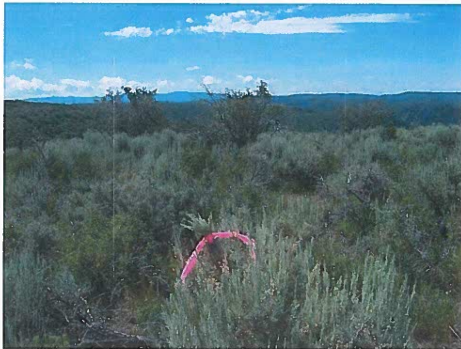
PHOTO FACING NORTH, TAKEN ON AUGUST 28, 2017. NO EVIDENT CHANGES SINCE TIME OF SURVEY.