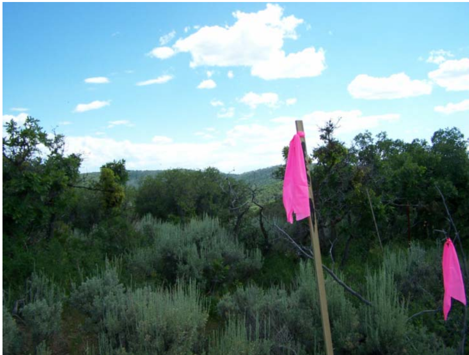
PHOTO FACING SOUTH, TAKEN ON MAY 15, 2010. PRIOR TO CONSTRUCTION OF LOCATION.