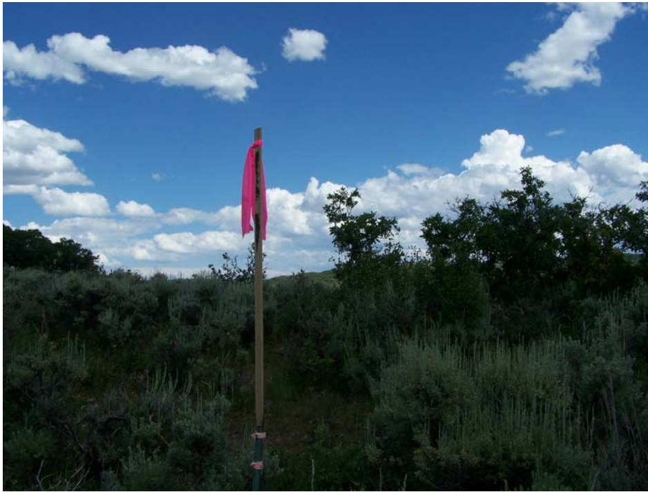
PHOTO FACING EAST, TAKEN ON MAY 15, 2010. PRIOR TO CONSTRUCTION OF LOCATION.