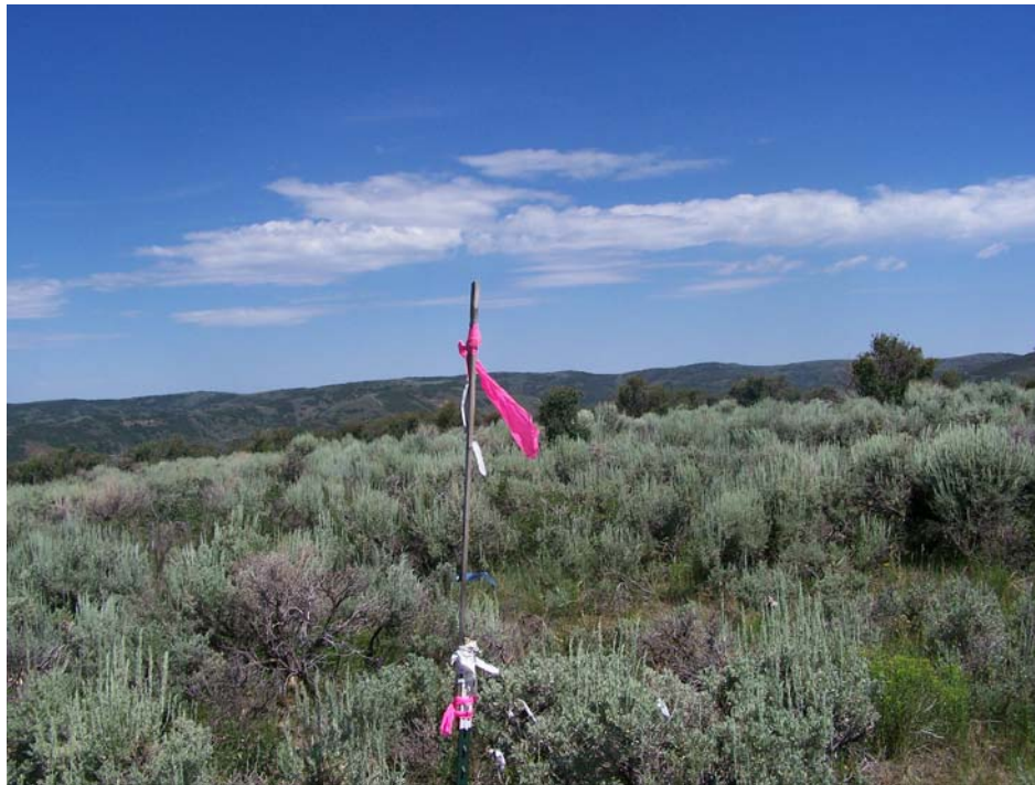
PHOTO FACING WEST, TAKEN ON MAY 15, 2010. PRIOR TO CONSTRUCTION OF LOCATION.

Old Mountain G03-696 Lot 7 Section 03 T. 6 S., R. 96 W., 6TH PM Garfield County, CO