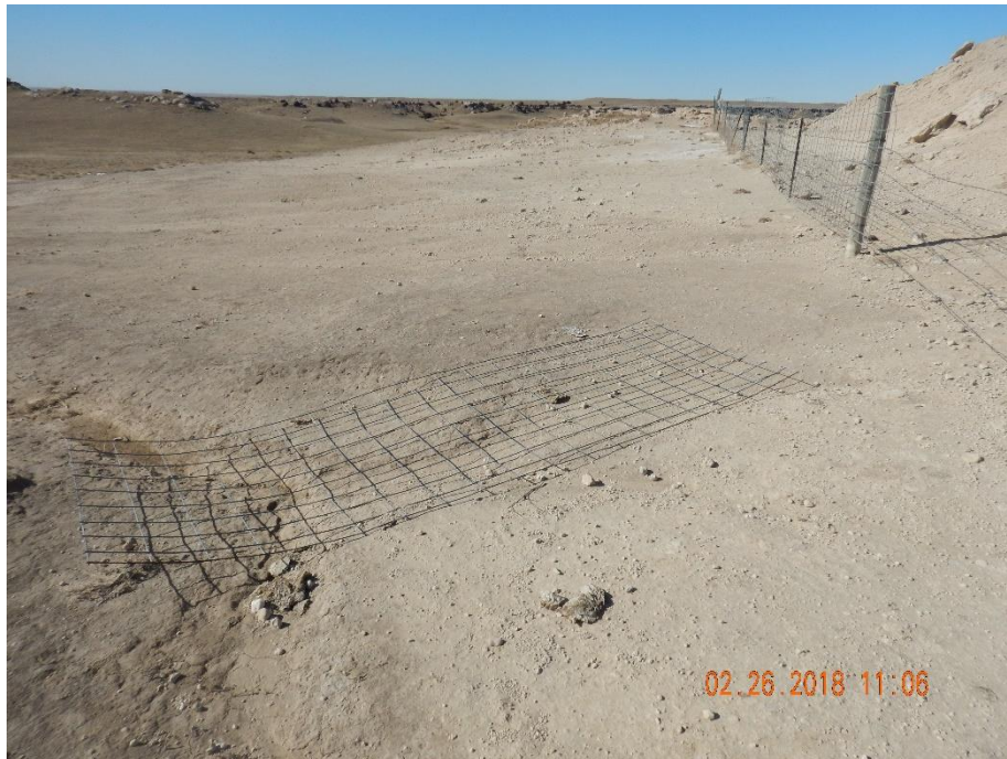
Photo 9: Photo taken from the southeast end of the produced water pit, facing west. Photo shows areas of erosion degradation on the adjacent lands due to runoff and salt kill. Photo shows no remediation activities appear to have been conducted, and no stabilization and stormwater BMPs have been installed or maintained per corrective actions.