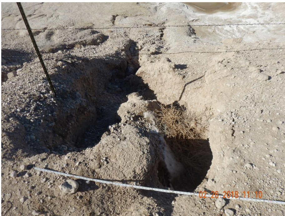
Photo 15: Photo taken from the east end of the produced water pit, facing west. See comments under photo 14. 6 foot measuring stick for reference.