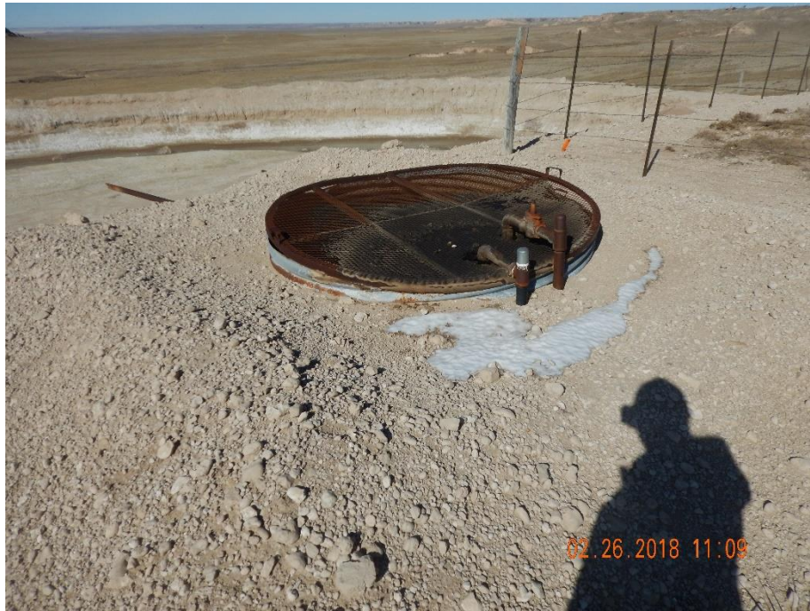
Photo 13: Photo taken from the east end of the pit, facing northwest. Photo shows tin horn has not been removed.