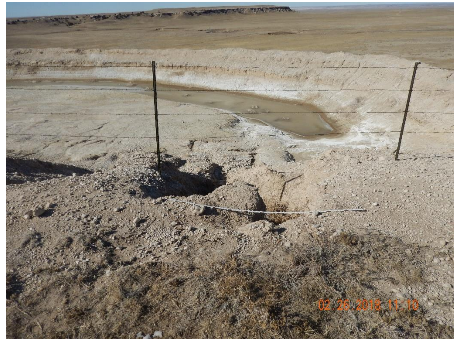
Photo 14: Photo taken from the east end of the produced water pit, facing west. Photo shows erosion degradation has not been repaired or stabilized, no BMPs have been installed or maintained, and no remediation and/or reclamation activities have been conducted per corrective actions.