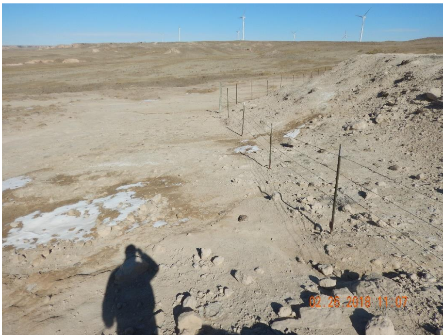
Photo 11: Photo taken from the southwest end of the produced water pit, facing north. See comments under photo 9.