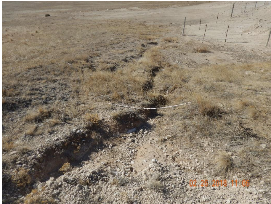
Photo 7: Photo taken from the south end of the location, facing southwest. See comments under photo 4. Six foot measuring stick for reference.