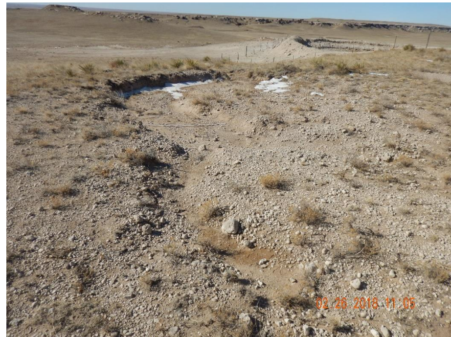
Photo 4: Photo taken from the south end of the location, facing west. Photo shows erosion degradation has not been repaired or stabilized, no BMPs have been installed or maintained, and no remediation and/or reclamation activities have been conducted per corrective actions.