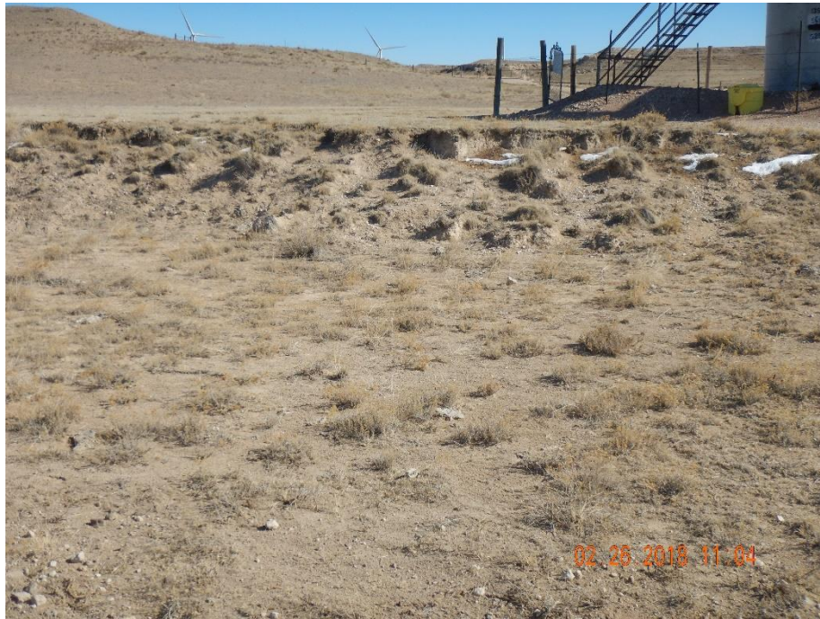
Photo 3: Photo taken from the central area of the location, facing east. Photo shows areas of erosion degradation. Erosion has not been repaired or stabilized and no BMPs have been installed or maintained per corrective actions.