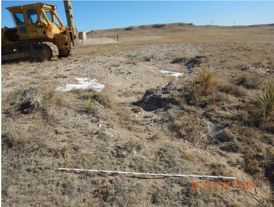
Photo 5: Photo taken from the south end of the location, facing east. See comments under photo 4. Six foot measuring stick for reference.