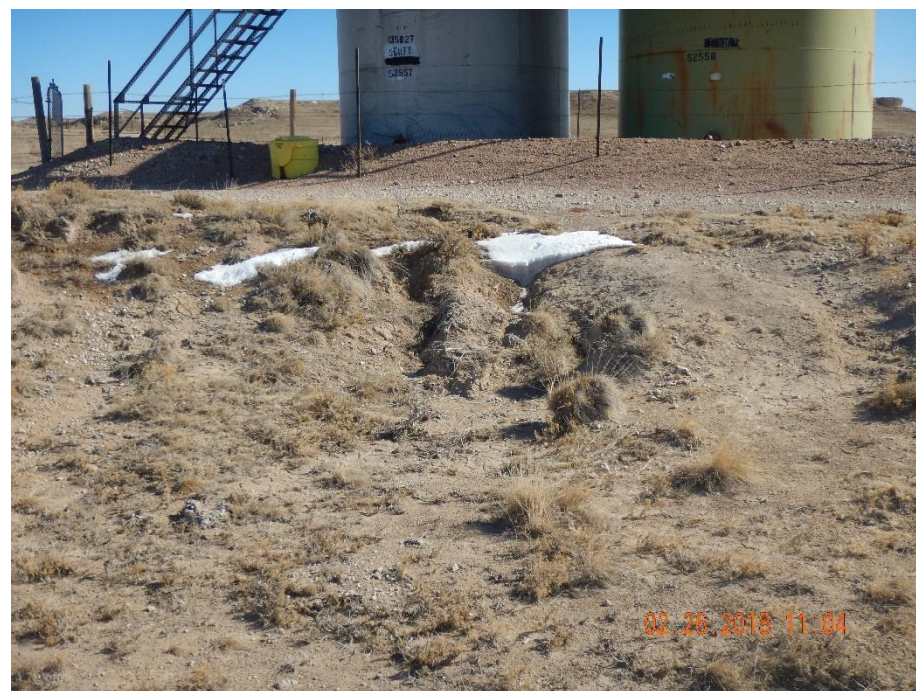
Photo 2: Photo taken from the central area of the location, facing east. Photo shows areas of erosion degradation. Erosion has not been repaired or stabilized and no BMPs have been installed or maintained per corrective actions.