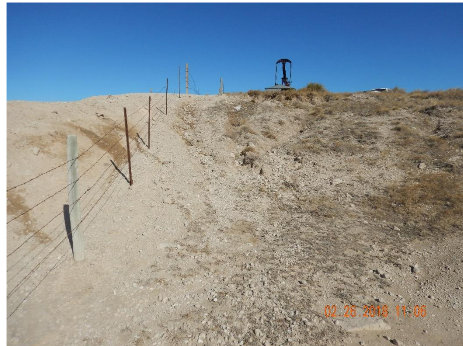
Photo 8: Photo taken from the south end of the location, facing north. See comments under photo 4.