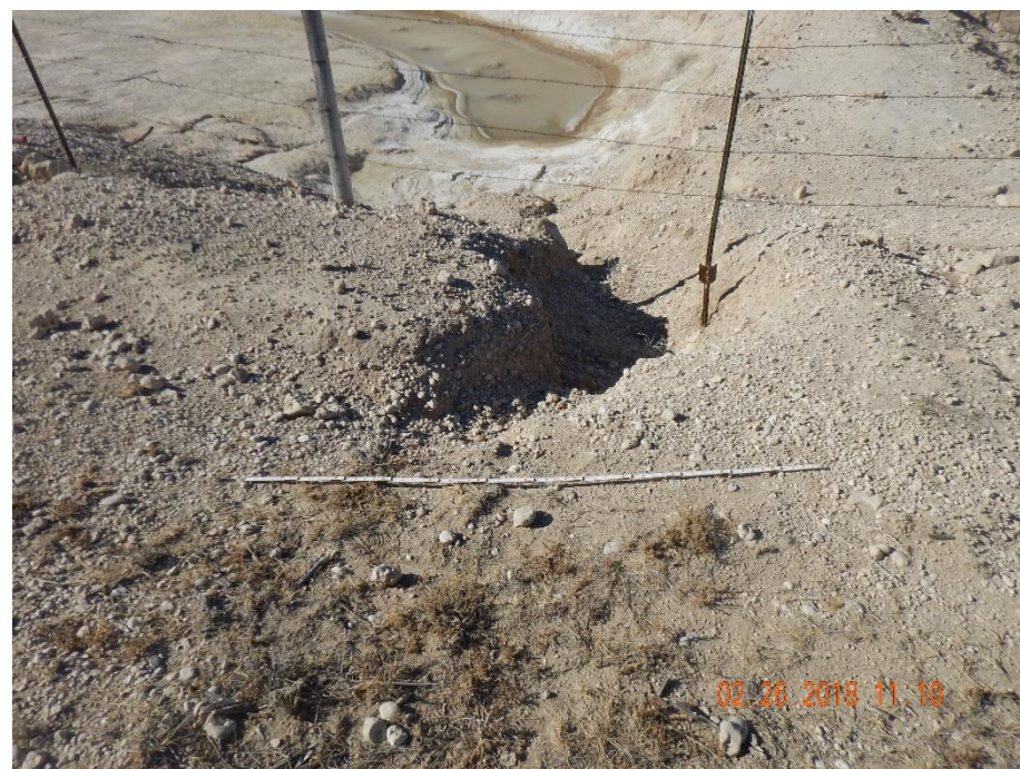
Photo 16: Photo taken from the east end of the produced water pit, facing west. See comments under photo 14. 6 foot measuring stick for reference.