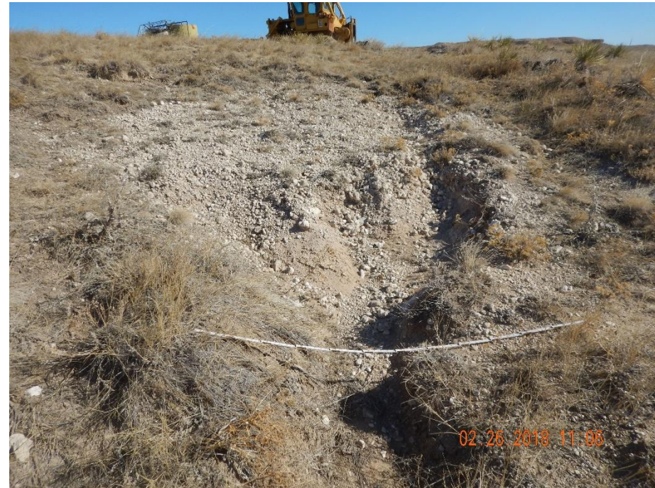
Photo 6: Photo taken from the south end of the location, facing east. See comments under photo 4. Six foot measuring stick for reference.