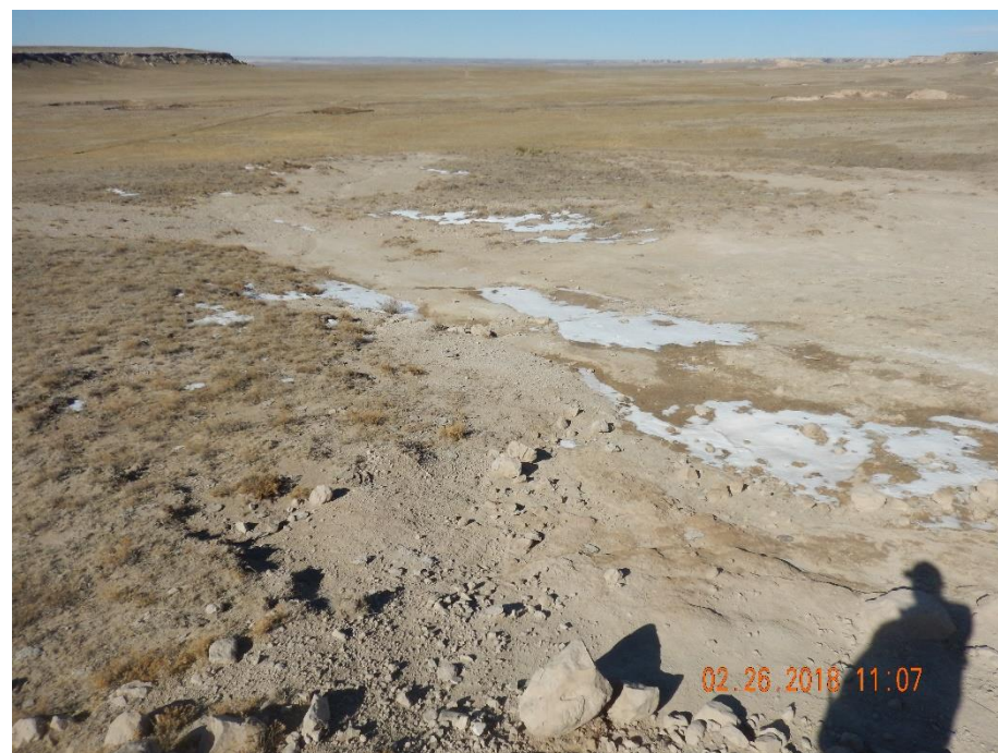
Photo 12: Photo taken from the southwest end of the produced water pit, facing west. See comments under photo 9.