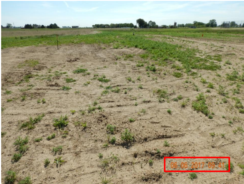
Photo 1. Photo taken from the northern well location on June 6, 2017, facing East. Does not appear final reclamation activities have been performed based on the lack of grass species and the abundance of weedy annuals, mostly Kochia.