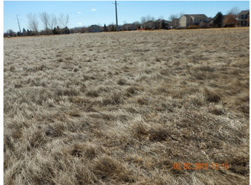
Photo 6. Reference photo taken on March 2, 2018, south of the well location, illustrating Smooth Brome ( Bromus inermis ) and Western wheatgrass ( Pascopyrum smithii ).