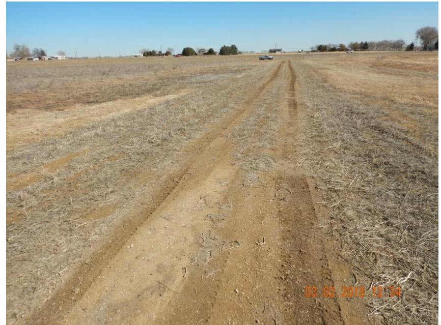
Photo 4. Photo taken along the access road on March 2, 2018, facing East. See comments under Photo 2. Appears weedy annual vegetation, Kochia, has been recently mowed along the access road.