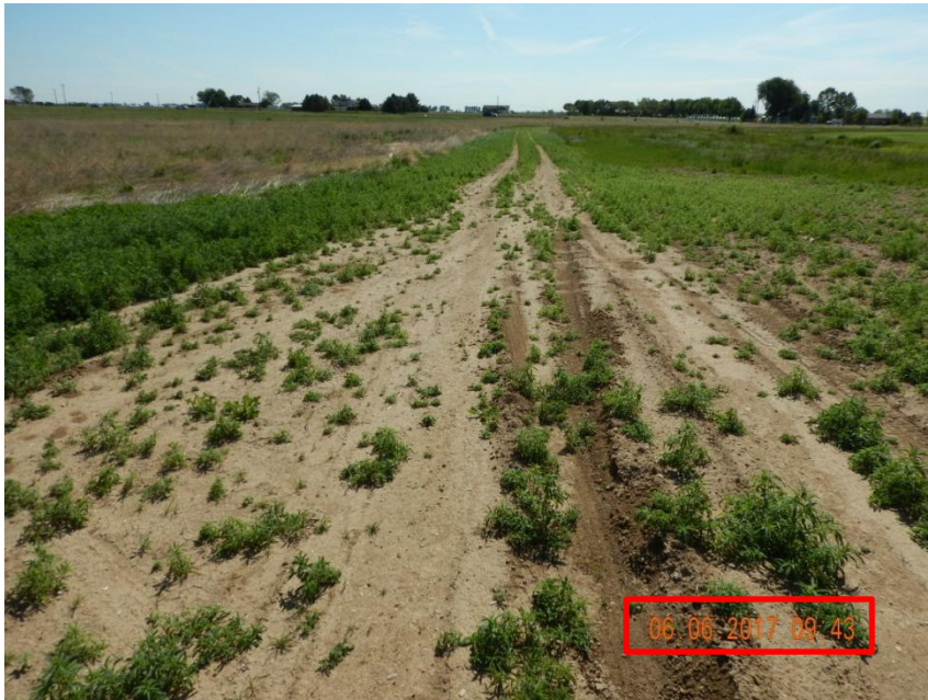
Photo 3. Photo taken along the access road on June 6, 2017, facing East. Access road is evident and does not appear final reclamation activities have been performed based on the lack of grass species and the abundance of weedy annuals, mostly Kochia.