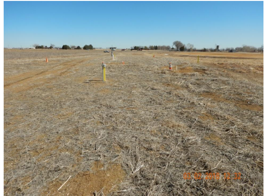
Photo 2. Photo taken from the northern well location on March 2, 2018, facing East. Final reclamation activities have not been performed per the previous corrective action inspection. Appears weedy annual vegetation, Kochia, has been recently mowed. Operator has submitted a Final Reclamation variance request from portions of Rule 1004.