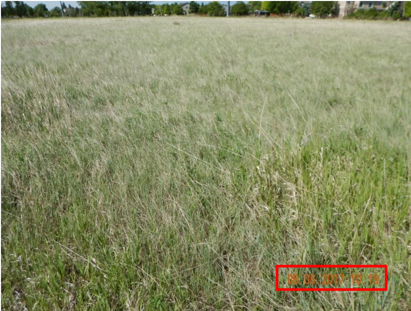
Photo 5. Reference photo taken on June 6, 2017, south of the well location, illustrating Smooth Brome ( Bromus inermis ) and Western wheatgrass ( Pascopyrum smithii ).