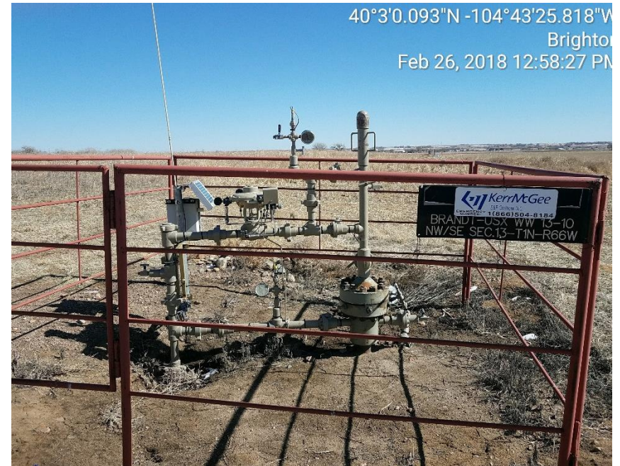
Wellhead and signage