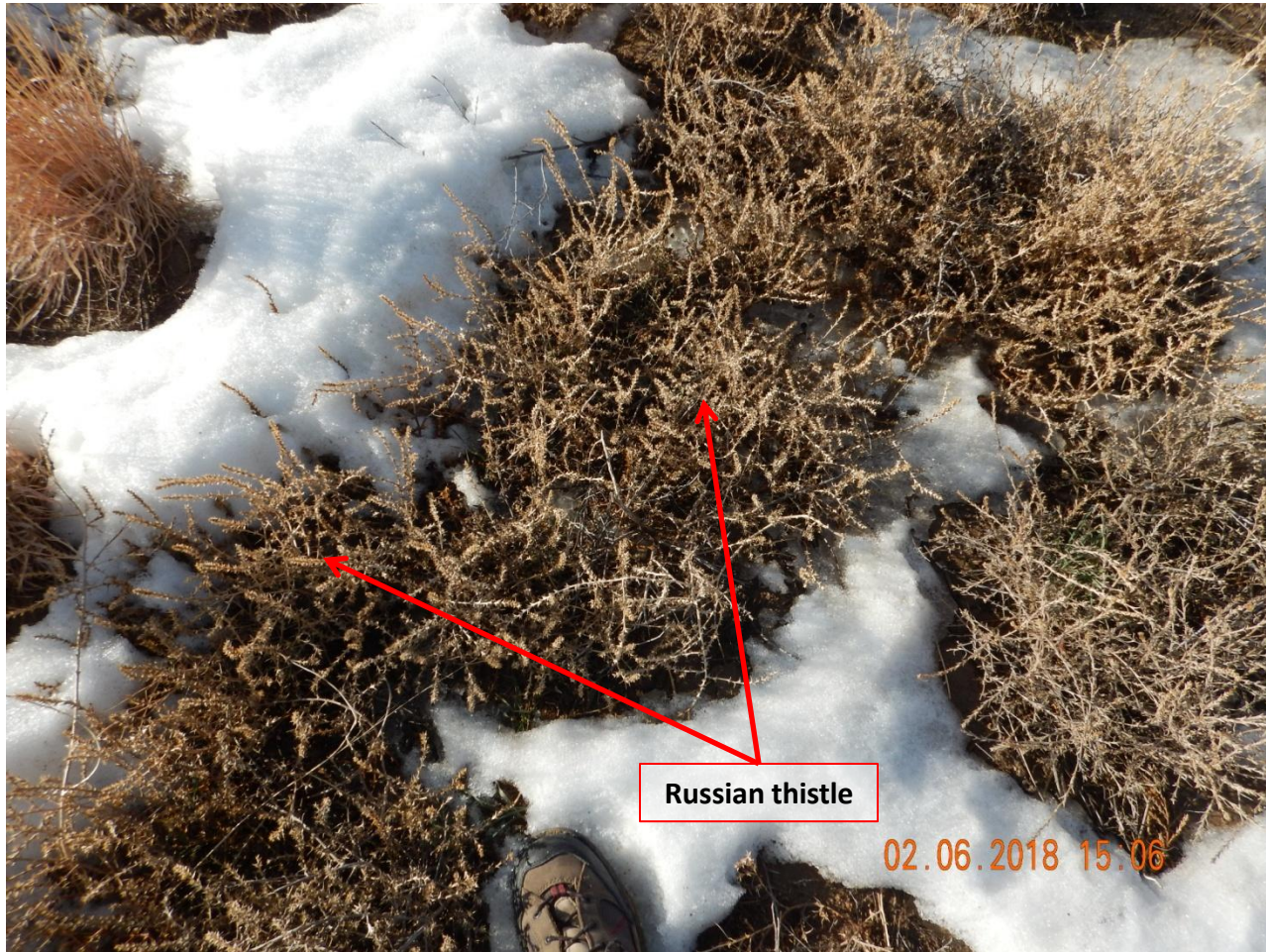
Photo 2. Photo taken from the approximate center of the Burke location, facing West. See comments under Photo 1.