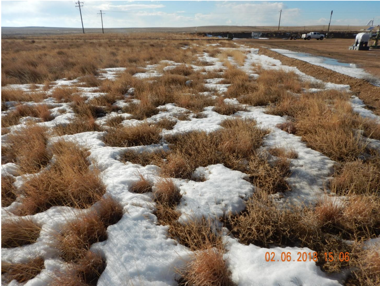
Photo 1. Photo taken from the southern interim area, facing West. Some reference area vegetation was observed but weedy, annual vegetation (Russian thistle) has a higher abundance than desirable species which is not reflective of reference area vegetation.