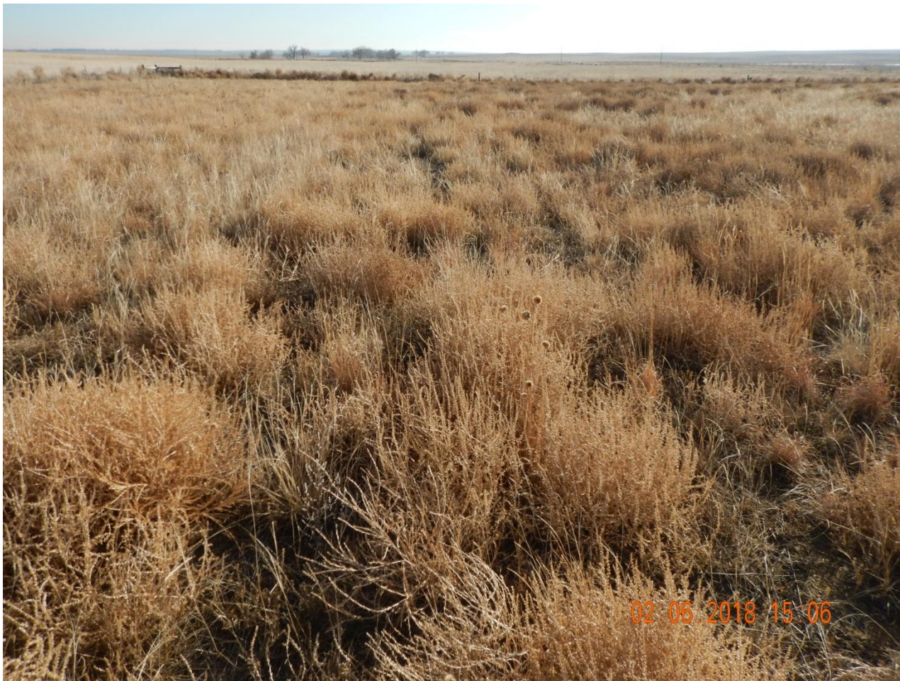
Photo 3. Photo taken from the southern interim area, facing South. Photo illustrates higher abundance of Russian thistle establishment. Most of the southeastern interim area is dominated by Russian thistle and unmanaged weed debris was observed in the perimeter fences.