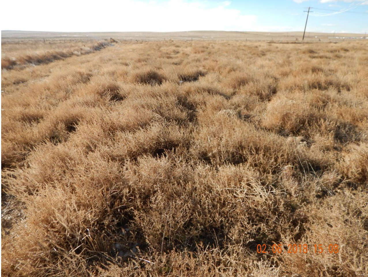
Photo 5. Photo taken from the southern interim area, facing West. See comments under Photo 4.