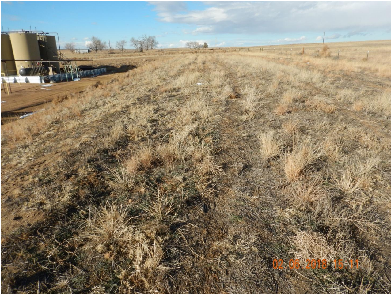
Photo 7. Photo taken from the eastern interim area, facing North. Reference area vegetation was observed and appears to have established throughout; however, there is not uniform established. This would be considered IN-PROCESS.