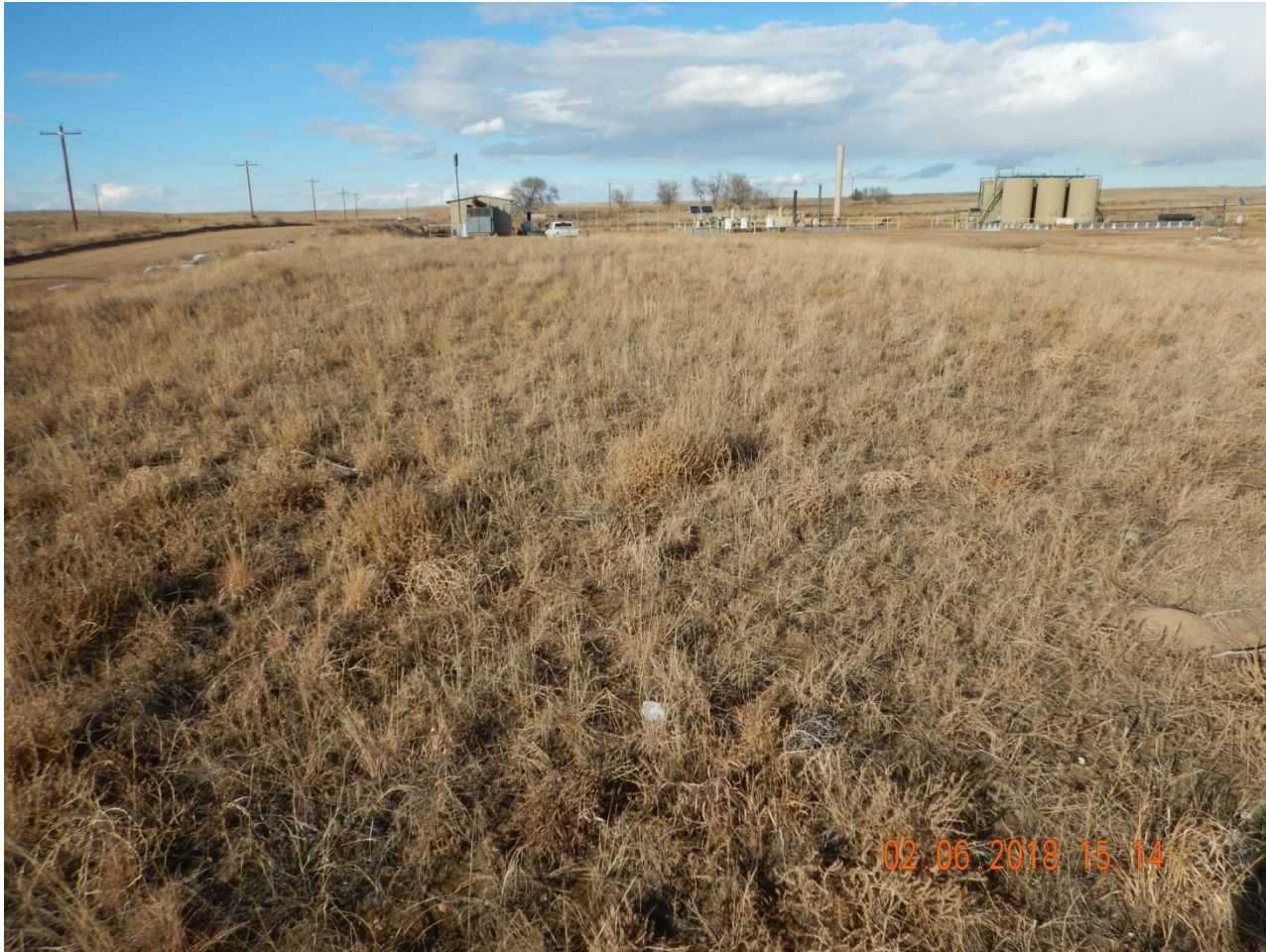
Photo 8. Photo taken from the western interim area, facing North. Reference area vegetation was observed and appears to have established throughout; however, there is not uniform established. Russian thistle was observed throughout portions of the inteim area. This would be considered IN-PROCESS.