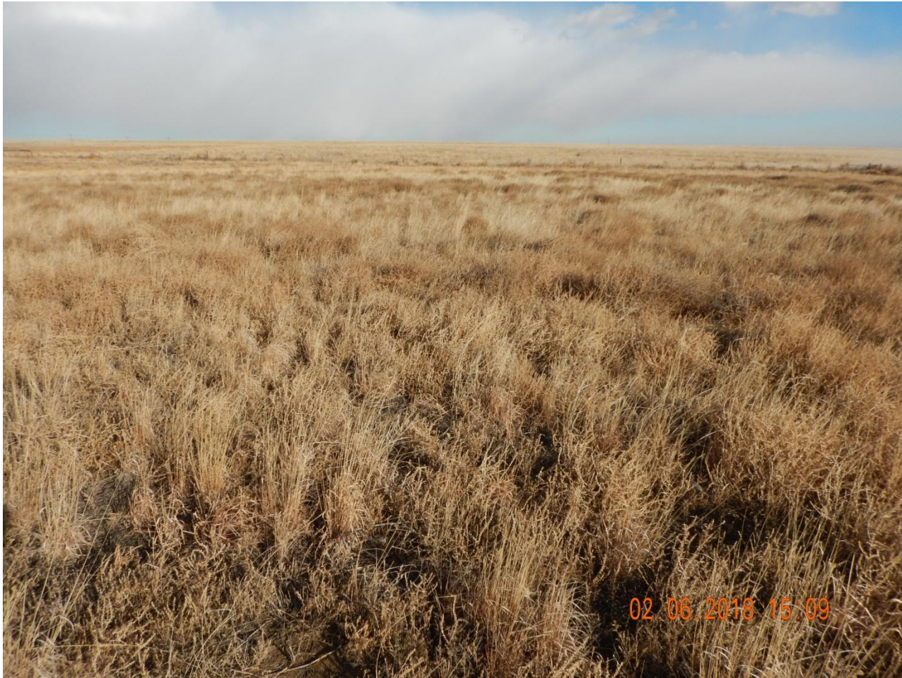
Photo 6. Photo taken from the southwestern interim area, facing East. See comments under Photo 4.