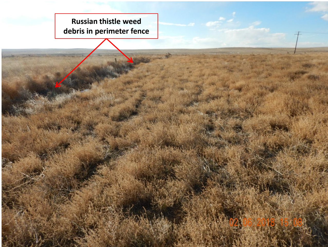
Photo 4. Photo taken from the southeast interim area, facing West. Photo illustrates the southern area is dominated by Russian thistle and unmanaged weed debris was observed in the perimeter fences.