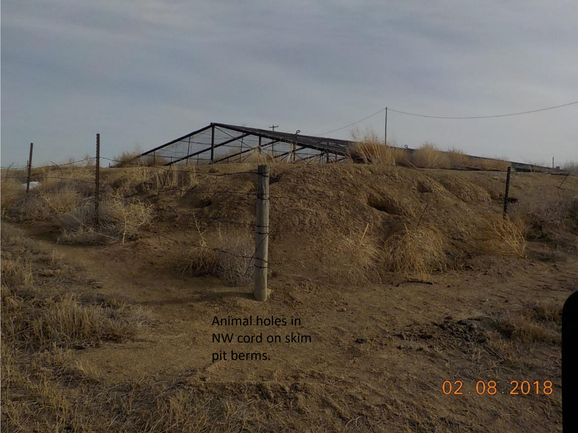
Animal holes in NW cord on skim pit berms.