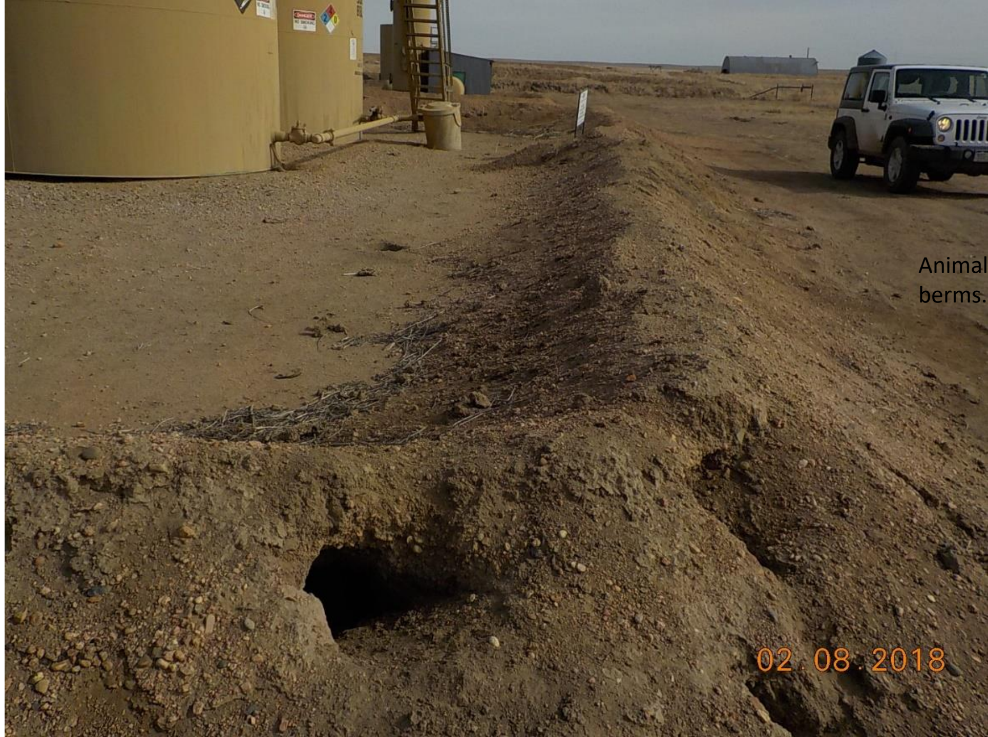
Animal holes in tank berms.