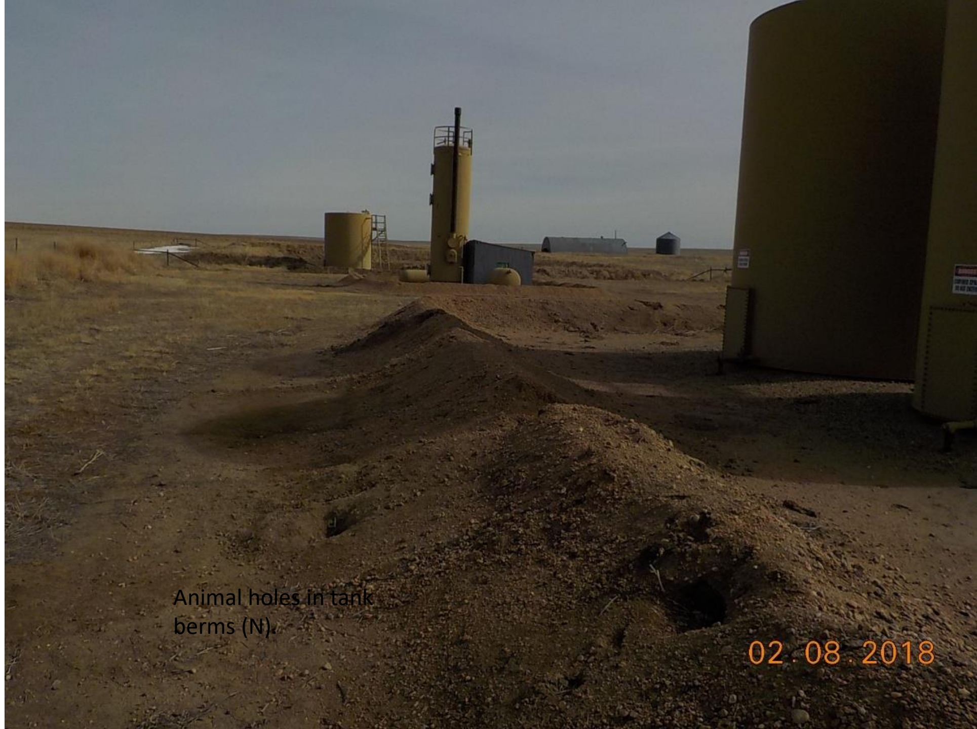
Animal holes in tank berms (N).