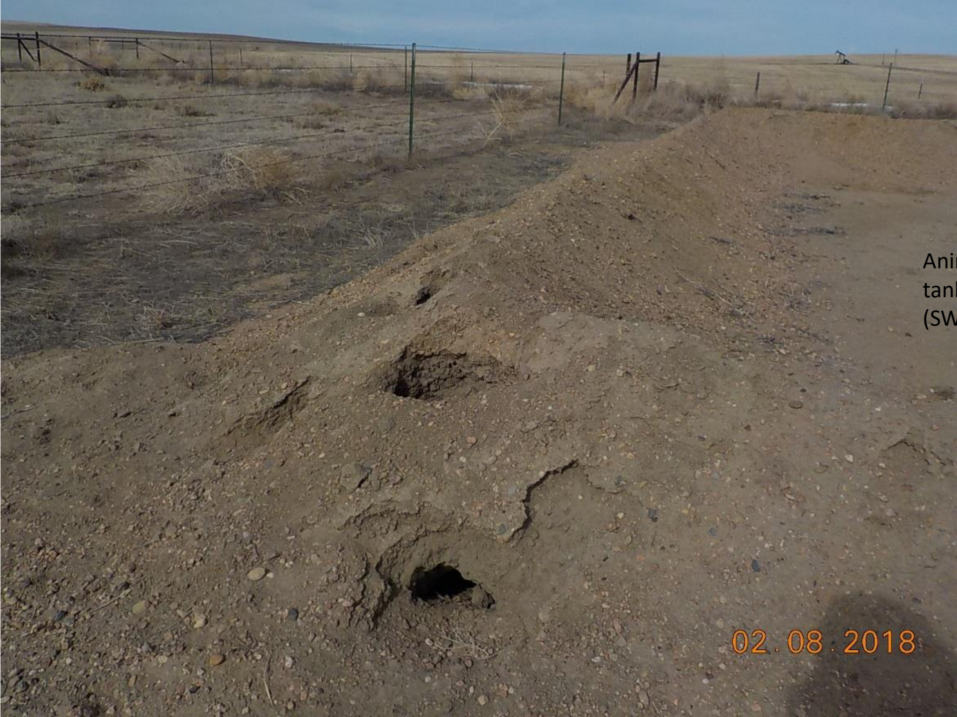
Animal holes in tank berms (SW cor).