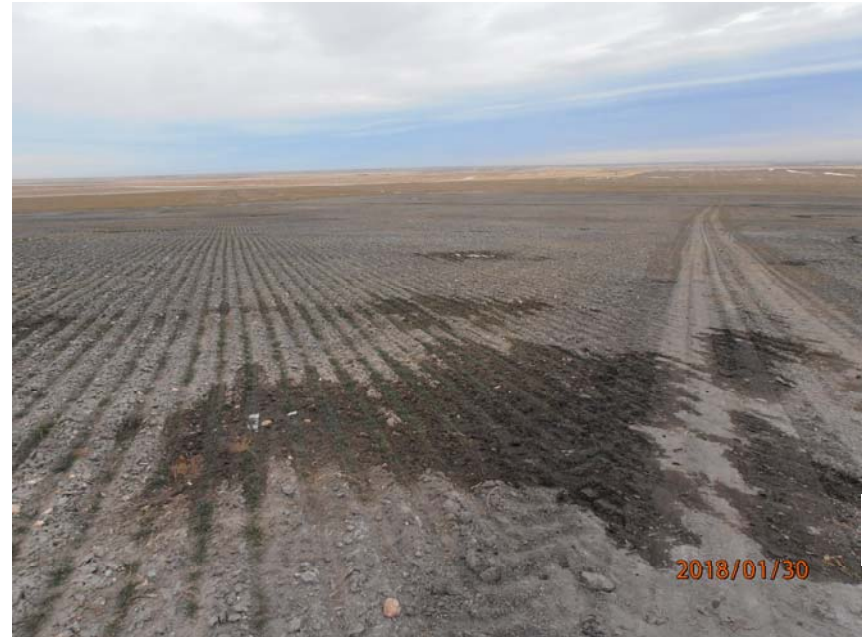
Photo 6 - Photo from approximate center of land application area, looking northeast