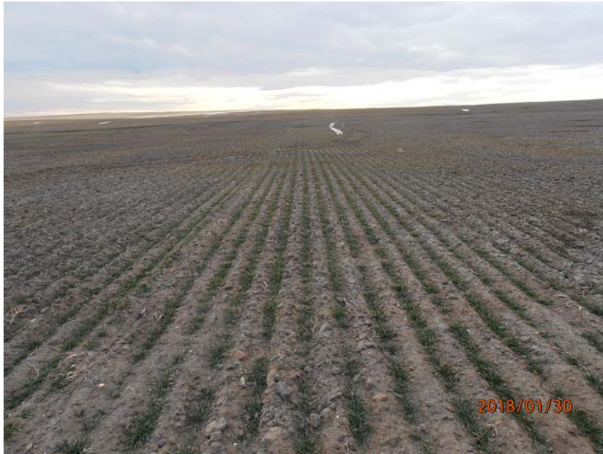
Photo 7 – Photo from east end of land application area looking north