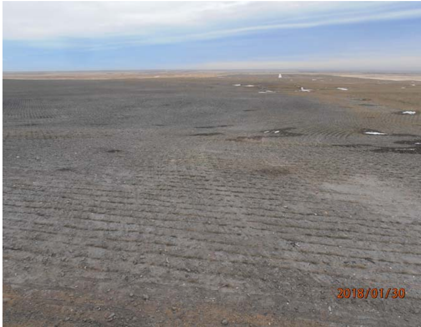
Photo 1 – Photo from southwest corner land application area, looking east