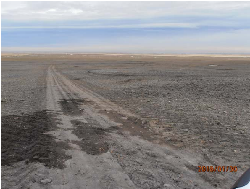
Photo 5 – Photo from approximate center of land application area, looking southeast