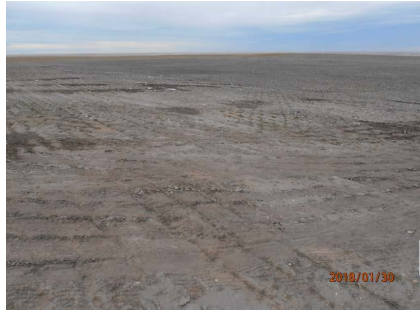
Photo 4 - Photo from center-west of land application area, looking northeast