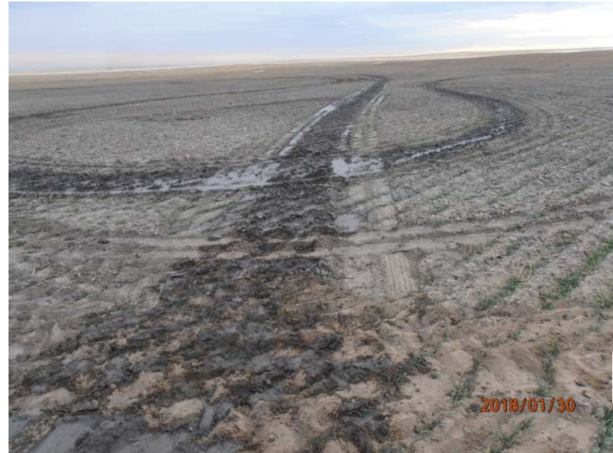
Photo 8 - Photo from east end of land application area looking south