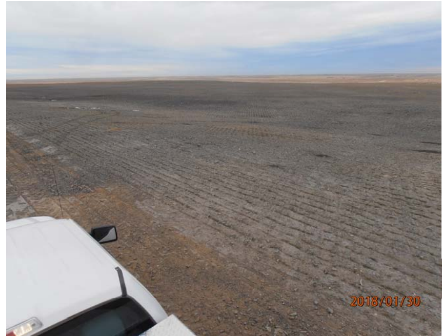
Photo 2 - Photo from southwest corner land application area, looking northeast