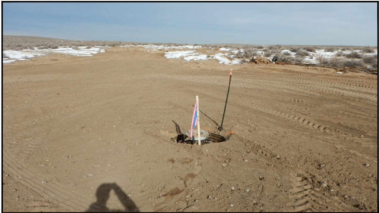
PHOTO: VIEW OF PLUGGED AND ABANDONED LOCATION