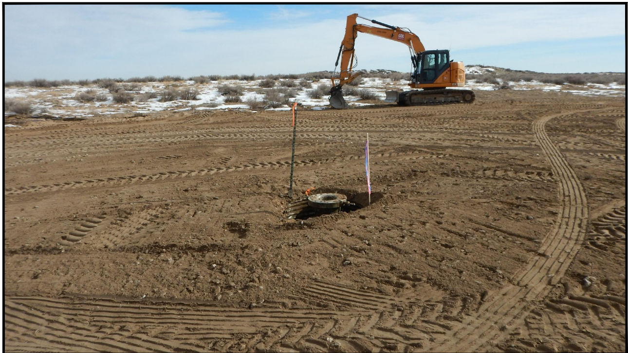
PHOTO: VIEW OF PLUGGED AND ABANDONED LOCATION