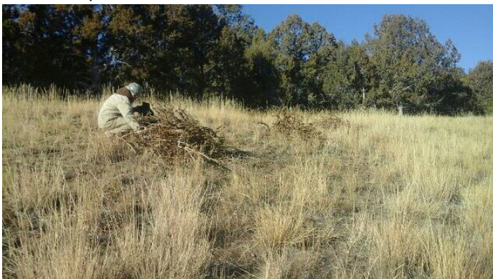
Completed work description