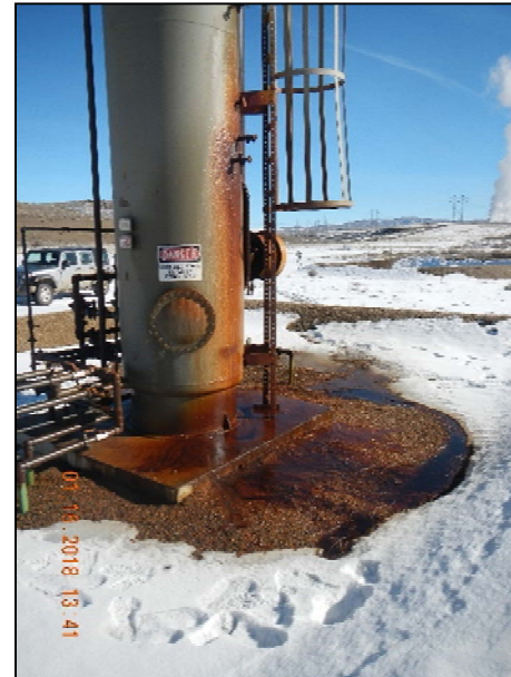
Photo 6. Fluid in separator berm. 1/16/2018