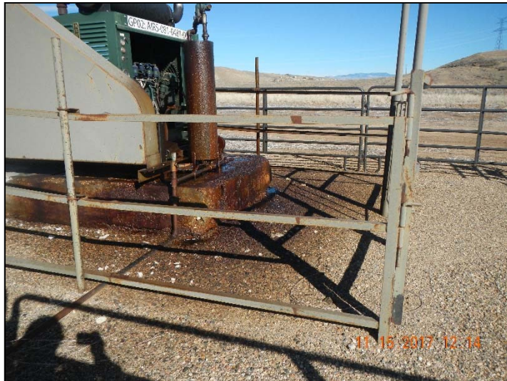
Photo 9. Fluid at pump jack motor, no containment. 11/15/2017