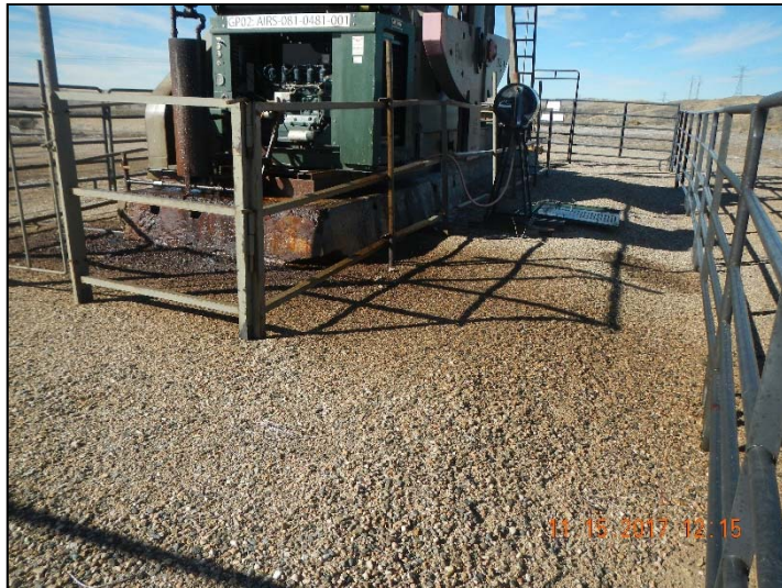
Photo 7. Fluid at pump jack motor, no containment. 11/15/2017