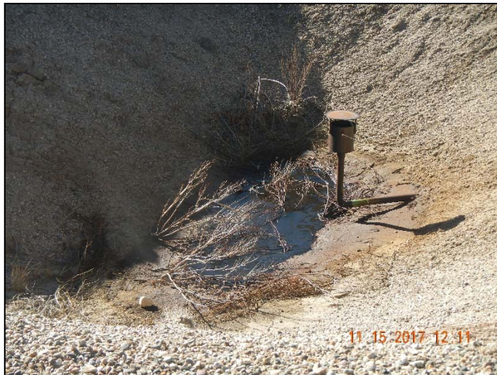
Photo 1. Fluid in flare pit. 11/15/2017