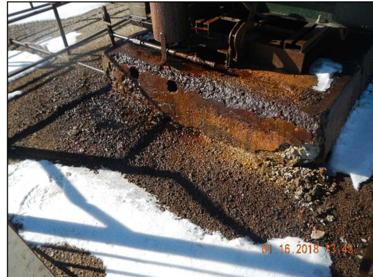
Photo 8. Fluid at pump jack motor, no containment. 1/16/2018