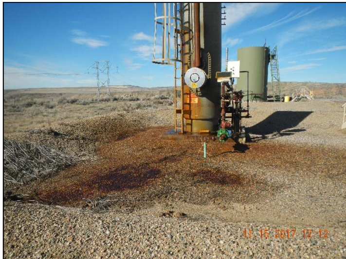
Photo 3. Fluid in separator berm. 11/15/2017