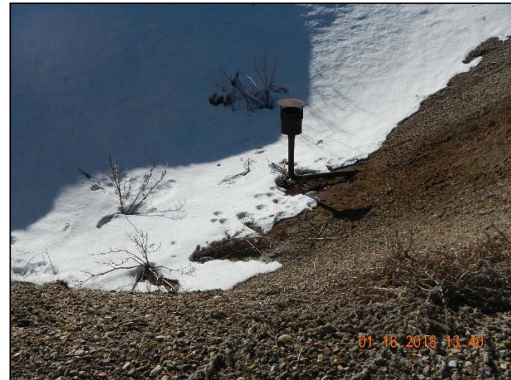
Photo 2. Current pit conditions unable to see fluid due to snow cover. 1/16/2018