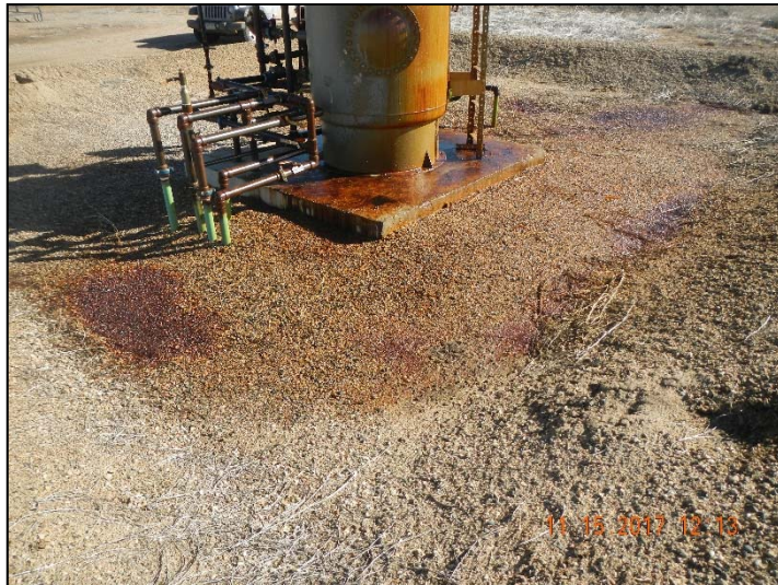
Photo 5. Fluid in separator berm. 11/15/2017