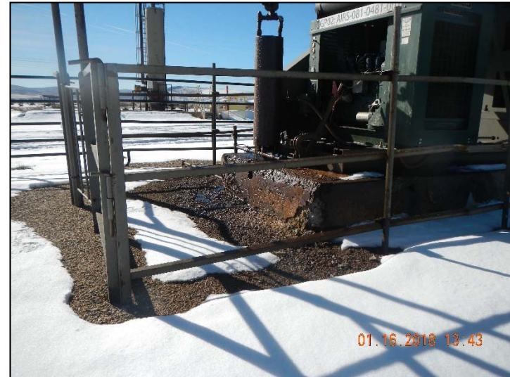
Photo 10. Fluid at pump jack motor, no containment. 1/16/2018