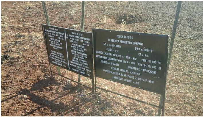
Completed work description

removed musk thistle skeletons and rosettes