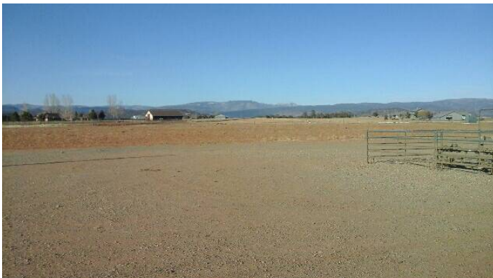
Picture East to West