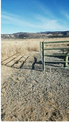
Completed work description