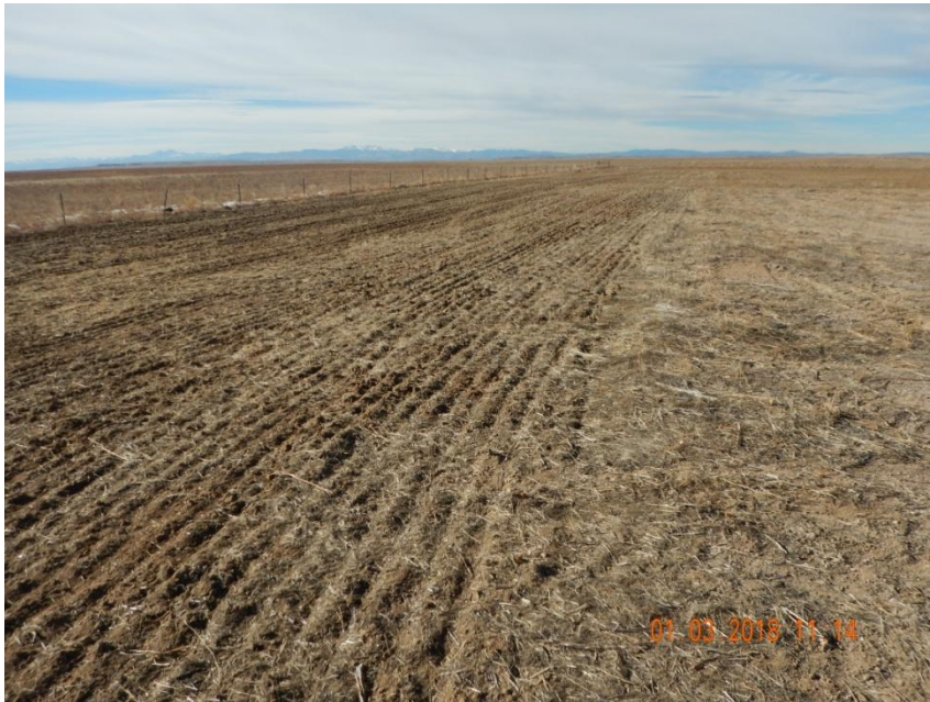
Photo 3. Photo taken from the southeast location, facing West. Appears the Operator has recently perform reclamation activities. Fence remains around the location and COGCC staff would recommend leaving the fence while vegetation establishes at location to keep cattle and other critters out during the reclamation process.