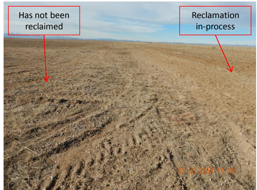
Photo 6. Photo taken from the northern location, facing West. See comments under Photo 5.