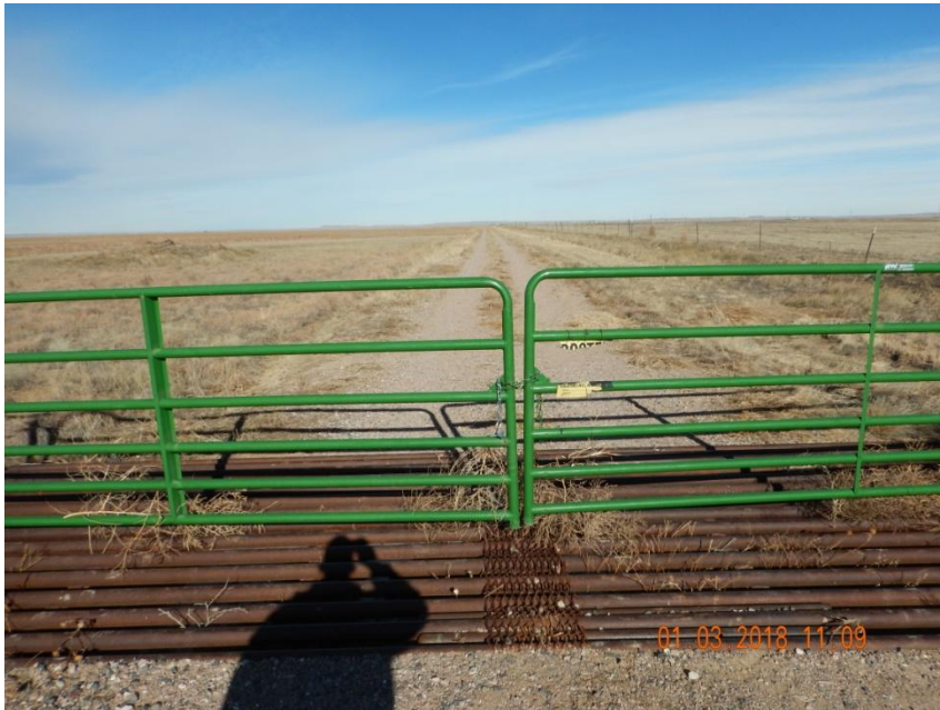
Photo 1. Photo taken from the entrance of the location, facing North. Operator has failed to reclaim the access road per Rule 1004. Cattle guard and gate remain at the entrance.