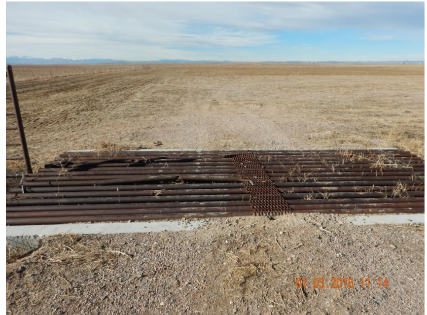
Photo 2. Photo taken from the entrance of the well location, facing West. Cattle guard remains at the entrance of the location.