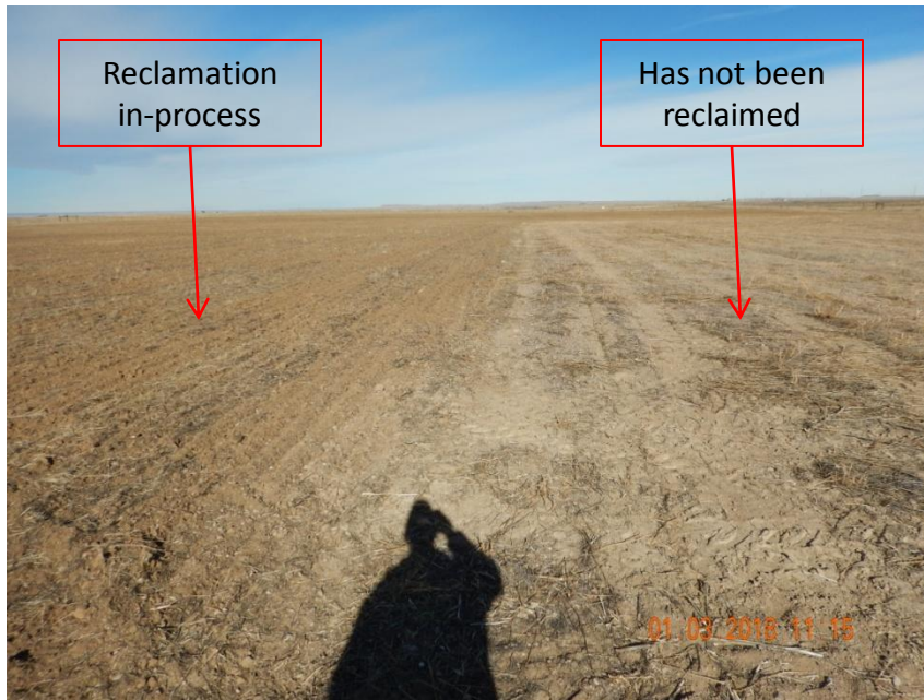
Photo 5. Photo taken from the southern location, facing North. Appears the Operator has recently perform reclamation activities but about 1/3 of the eastern location has not been reclaimed.