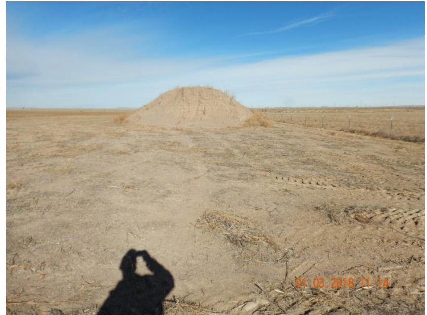
Photo 4. Photo taken from the southeast location, facing North. Appears a gravel stockpile has been left at location.