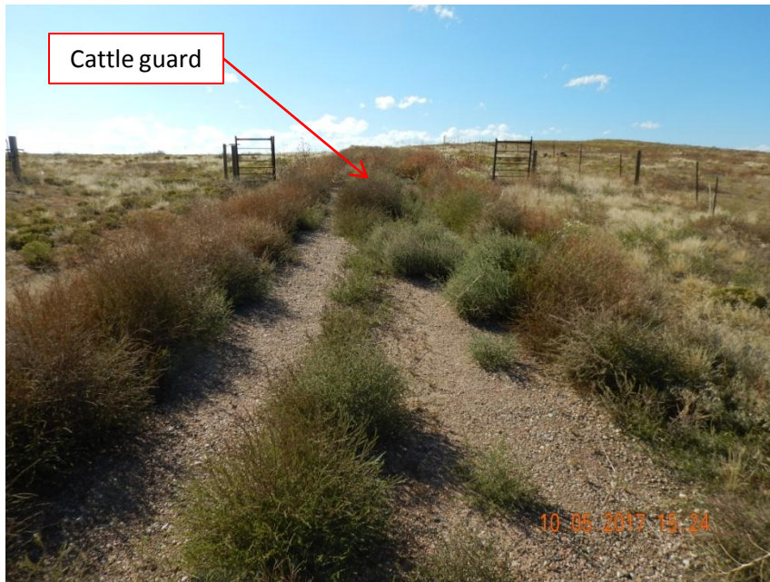
Photo 1. Photo taken from the start of the access road off CR 94, facing West on October 5, 2017. Russian thistle growing throughout the access road portions of the road; gravel on access road; access road has not been contoured or seeded.