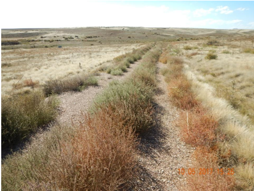
Photo 3. Photo taken along a portion of the access road, facing West on October 5, 2017. See comments under Photo 1.