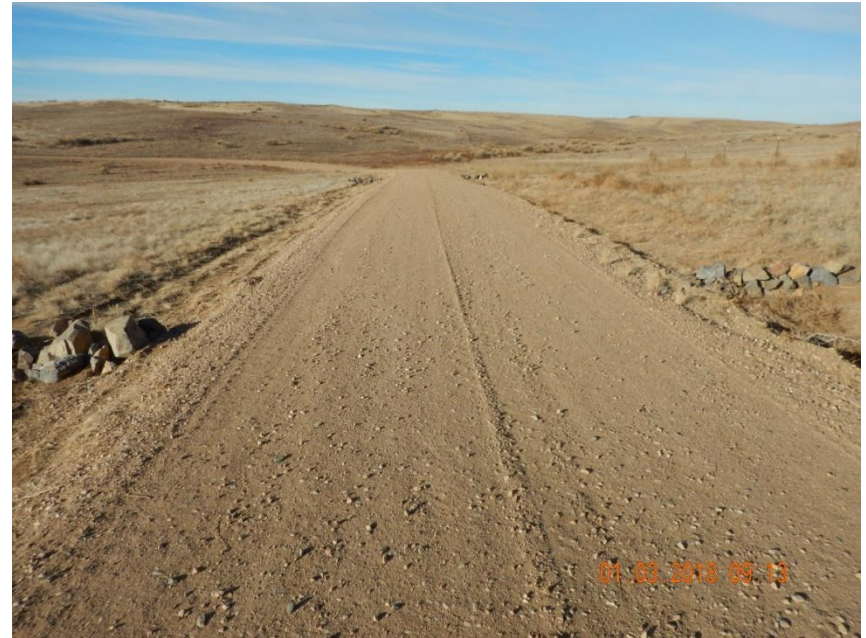
Photo 4. Photo taken from the same location as Photo 3, facing West on January 3, 2018. See comments under Photo 2.