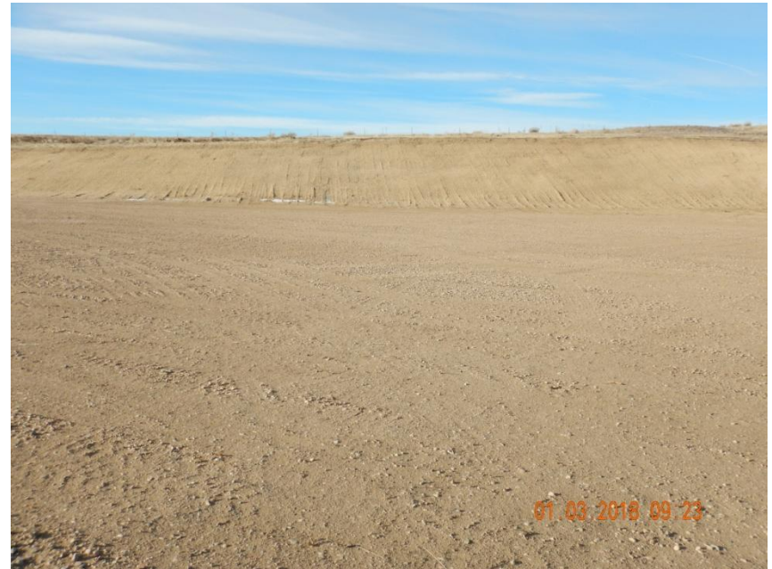
Photo 18. Photo taken from the approximate central well pad, facing West on January 3, 2018. Operator has tracked the cut slopes with equipment and hydromulched.