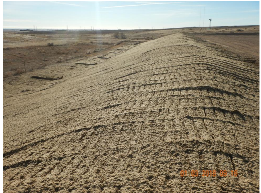
Photo 8. Photo taken from the northeastern location, facing South on January 3, 2018. See comments under Photo 6 & 7.