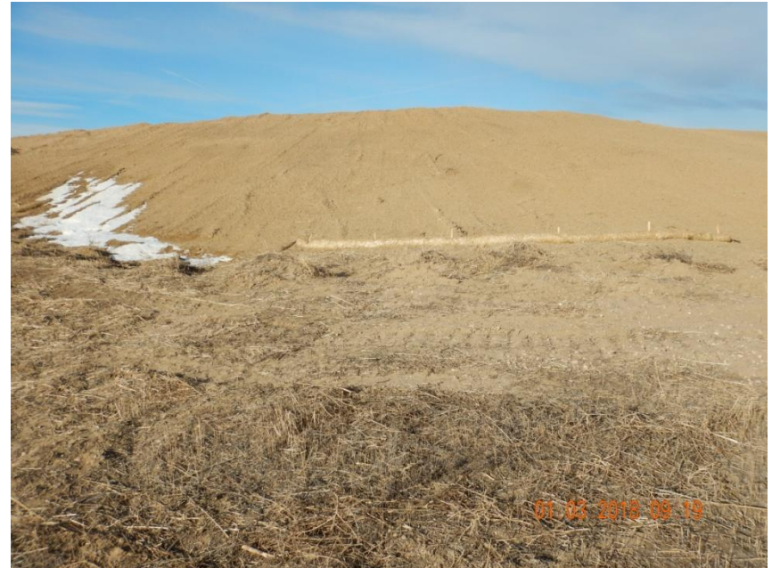
Photo 14. Photo taken from the same location as Photo 12, facing Northwest on January 3, 2018. Operator has repaired gully erosion. There was no observed stabilized outlet installed for stormwater management.