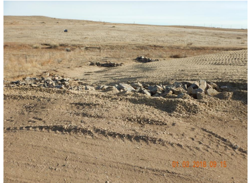
Photo 6. Photo taken from the same location as Photo 5, facing East on January 3, 2018. Operator has installed stormwater BMPs along the perimeter of the location and has brush hogged the location.