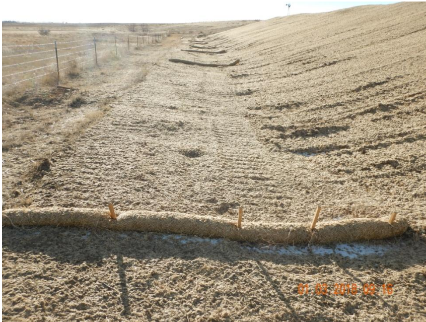
Photo 9. Photo taken from the eastern location, facing South on January 3, 2018. Operator has installed straw wattles as check dams which have not been properly installed. Wattles have not been properly trenched and backfilled.