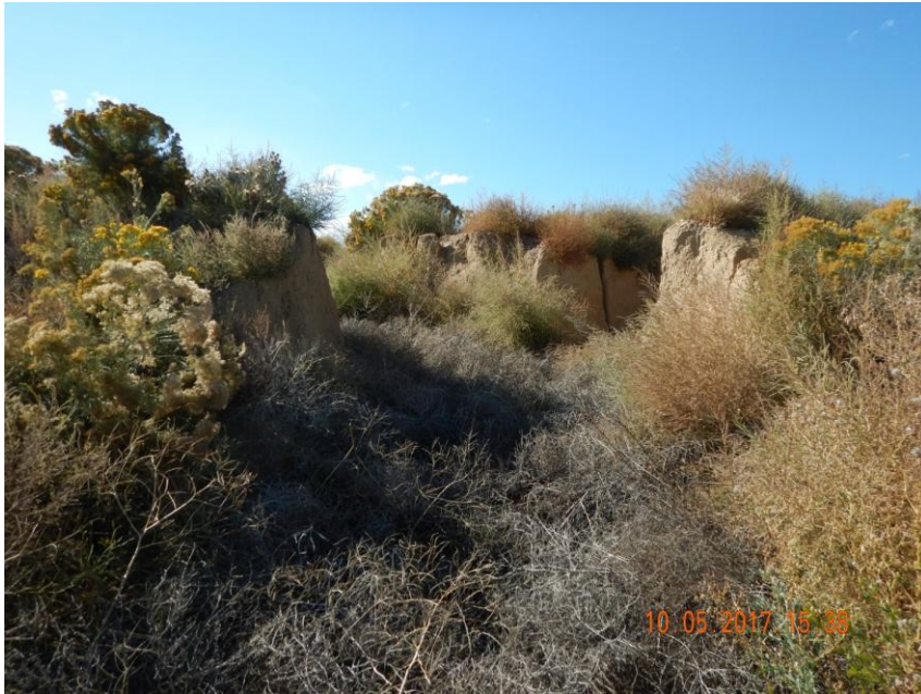
Photo 13. Photo taken from the southeastern location, facing Northwest on October 5, 2017. Gully erosion- 6 feet in depth- observed throughout the southeastern well pad location.