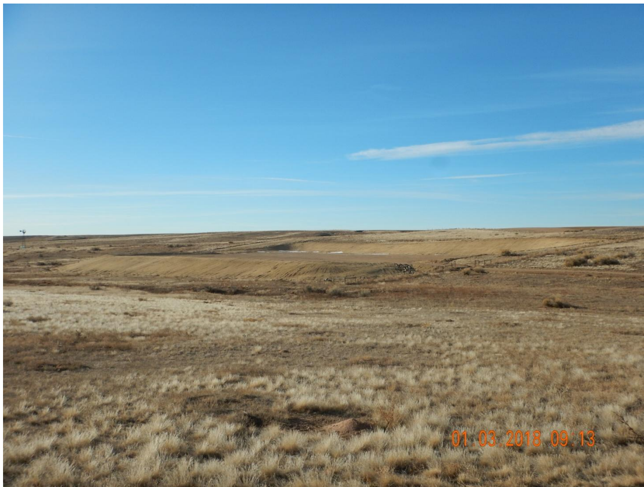
Photo 19. Photo taken from the main access road, facing Southwest on January 3, 2018. This is an overview photo of the location.