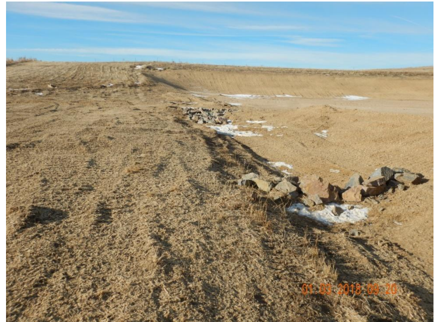
Photo 16. Photo taken from the southern location, facing West on January 3, 2018. Operator has installed stormwater BMPs.