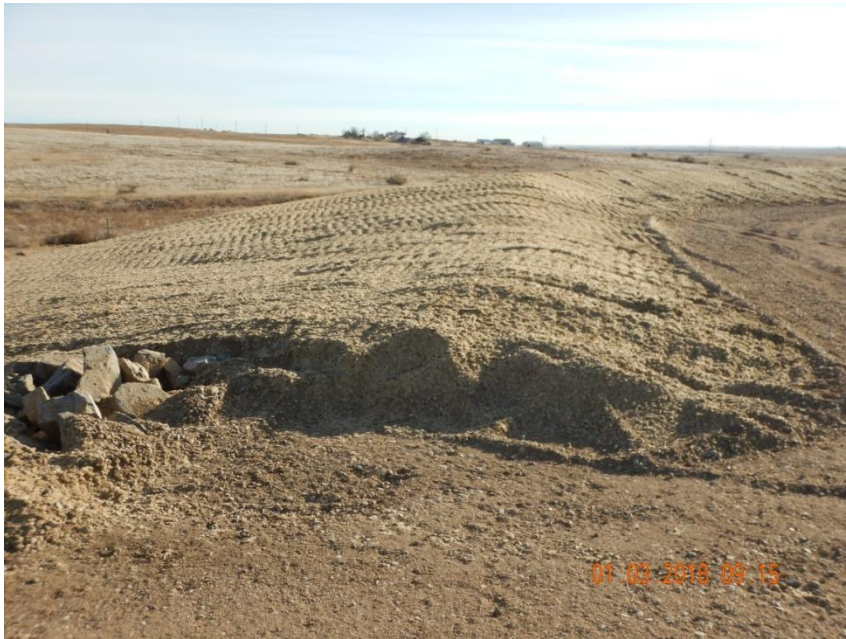
Photo 7. Photo taken from the northern location, facing East on January 3, 2018. Operator appears to have constructed a berm around the northern and eastern well pad perimeter. Fill slope has been tracked with equipment and hydromulched.