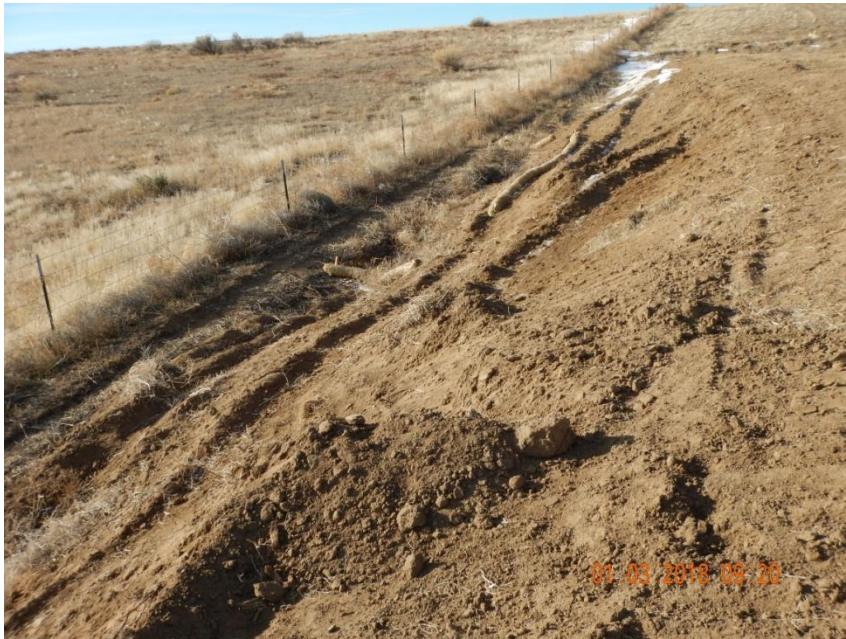
Photo 15. Photo taken from the southeastern location, facing West on January 3, 2018. Fill slope of what appears to be topsoil has not been properly stabilized. Straw wattles have not been properly installed.