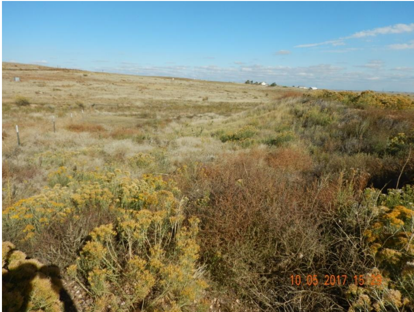
Photo 5. Photo taken from the northern location, facing East on October 5, 2017. Photo illustrates the location has not been contoured to the surrounding landscape and the perimeter fence around the entire location remains.