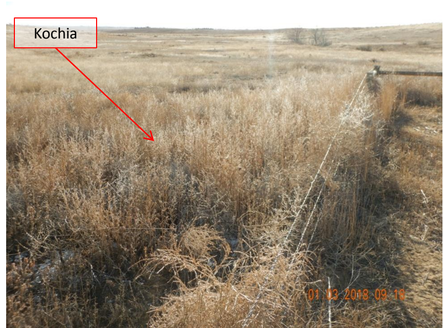
Photo 10. Photo taken from the southeast location, facing South on January 3, 2018. Appears Kochia has spread off location onto the adjacent lands.