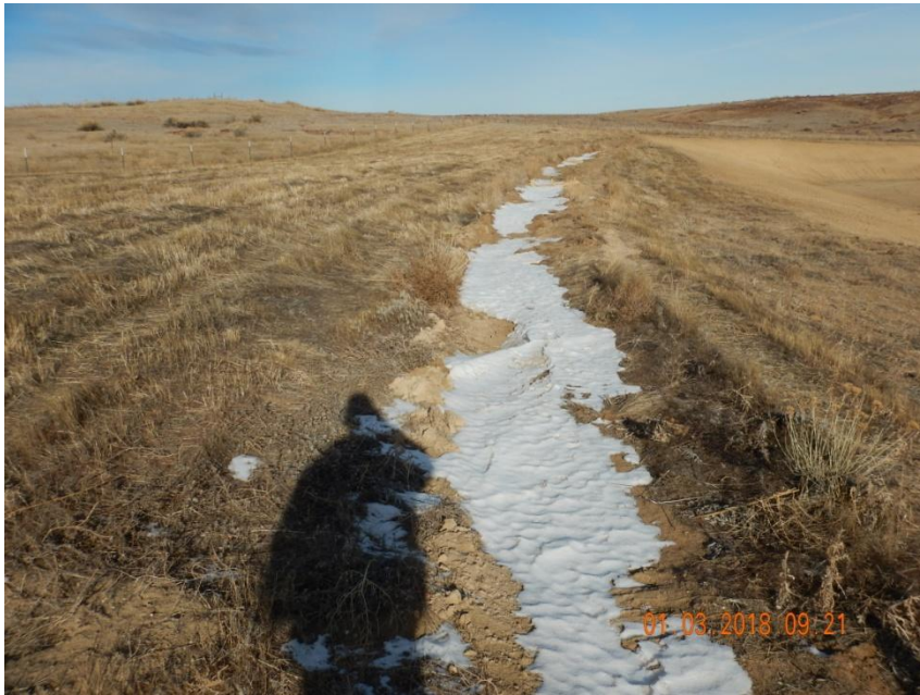
Photo 17. Photo taken from the southwestern location, facing North on January 3, 2018. Operator has installed a ditch in conjunction with check dams. Check dams are straw wattles which have not been properly installed.