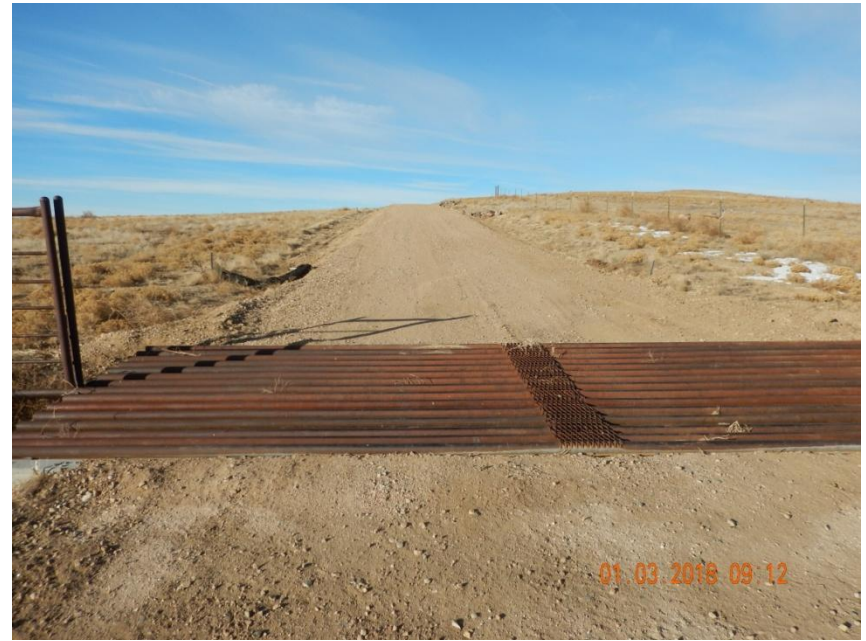
Photo 2. Photo taken from the same location as Photo 1, facing West on January 3, 2018. Operator has removed Russian thistle from the access road.