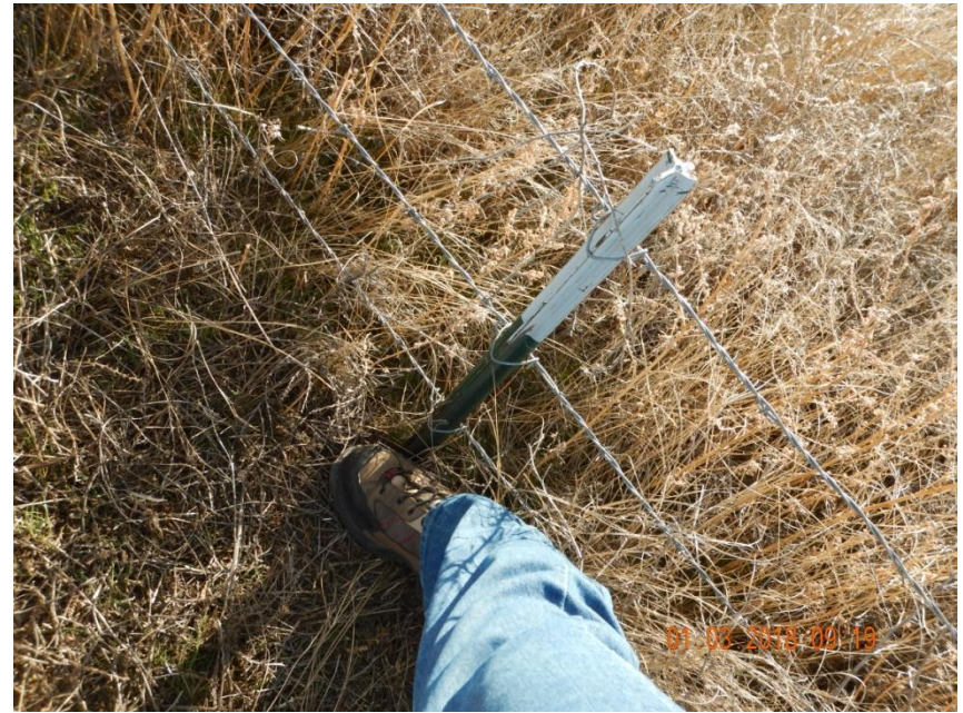
Photo 12. Close-up photo taken from the southeast location. This photo illustrates how much sediment has discharged from location. Only 3 strands of barbed wire and half the t-post are visible.