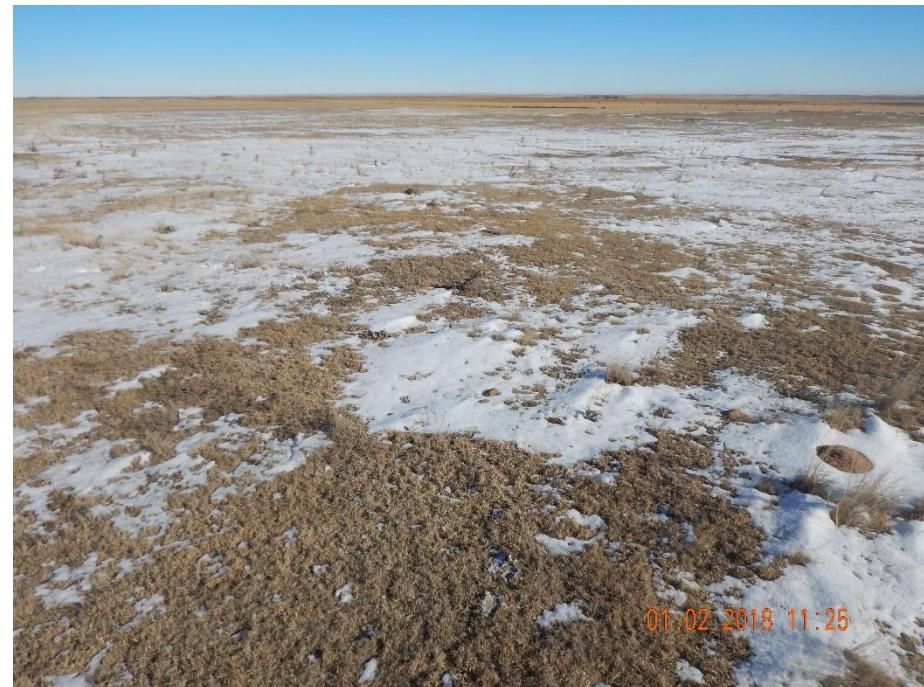
Photo 6: Photo taken from the west end of the location, facing northeast.