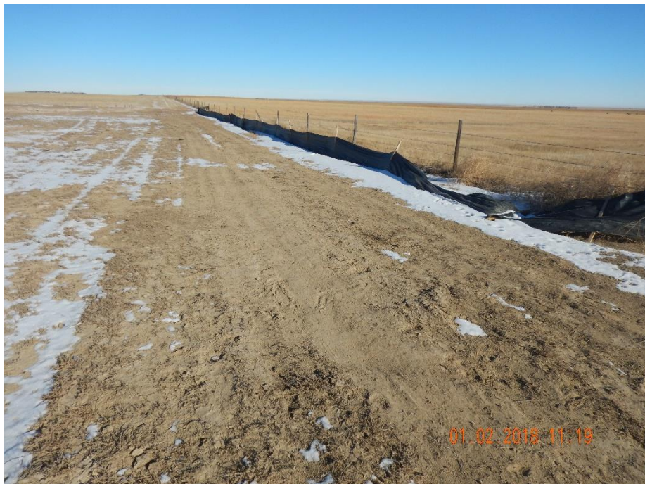
Photo 3: Photo taken from the northeast end of the location, facing northeast. Photo shows that the silt fence appears to have been repaired, however areas of the fence already appear to be in disrepair. Advise maintenance before further damage.