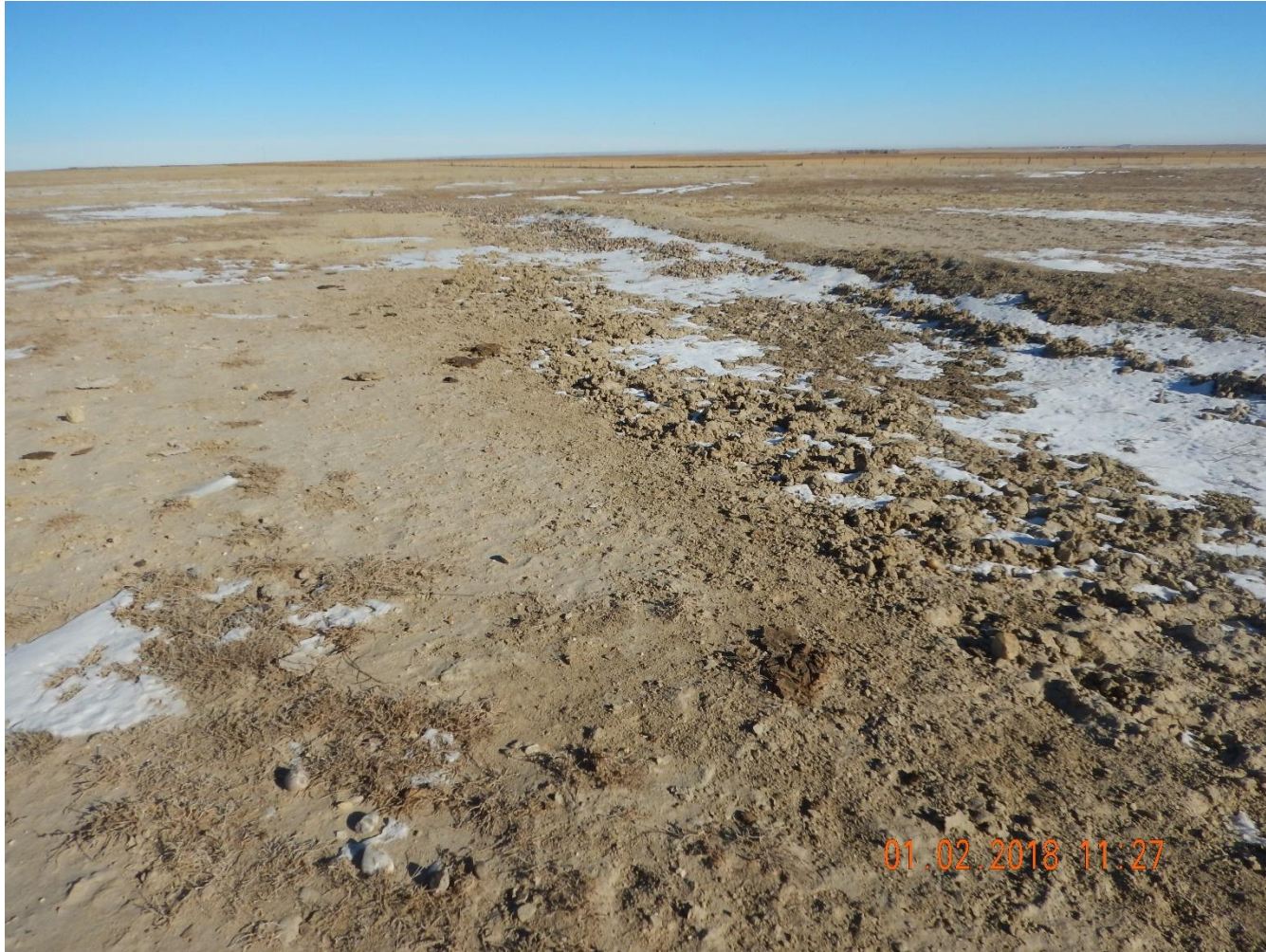
Photo 9: Photo taken from the south end of the location, facing north. Photo shows maintenance appears to have been conducted at the berm BMP.