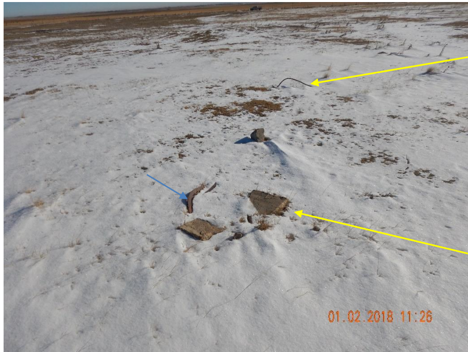
Photo 7: Photo taken from the southwest area of the disturbance, and the well location, facing northeast. Inspection #682501119 and inspection #682502721 identified and documented this debris and required its removal. Refer to photos 9-11 in inspection 682501119 and photo 23 in inspection #682502721. Photo shows debris has not been removed per the corrective action.