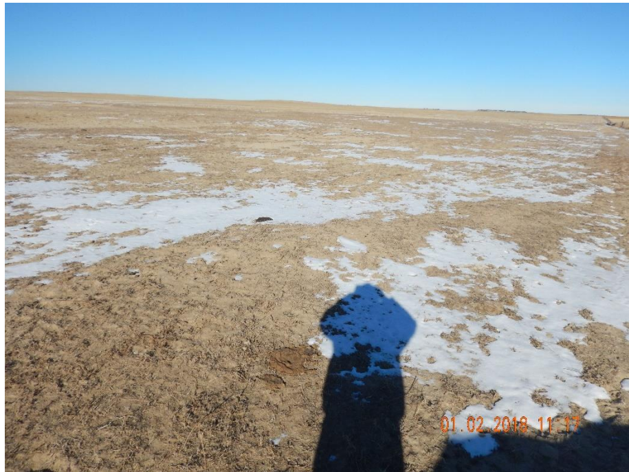
Photo 1: Photo taken from the southeast end of the location, facing northwest.