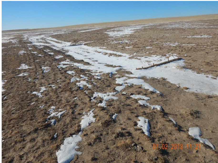
Photo 5: Photo taken from the northwest end of the location, facing southwest. Photo shows straw wattle BMPs have been repaired.