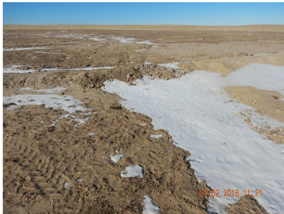
Photo 4: Photo taken from the north end of the location, facing west. Photo show additional rock armoring has been used to repair the degradation within the stormwater berm.