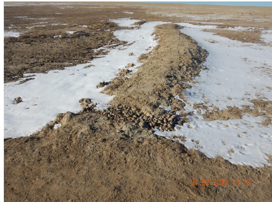
Photo 2: Photo taken from the east end of the location, facing west. Photo show additional rock armoring has been used to repair the degradation within the stormwater berm.