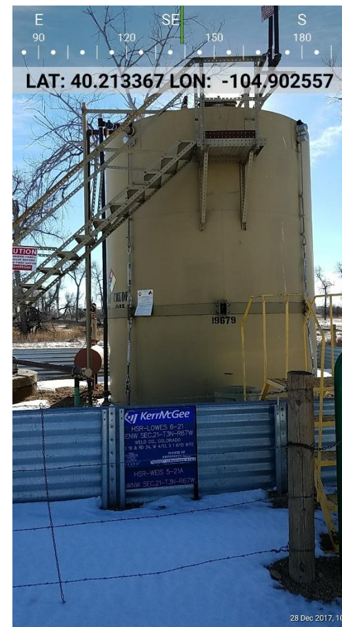
Photo 6 Crude oil tank