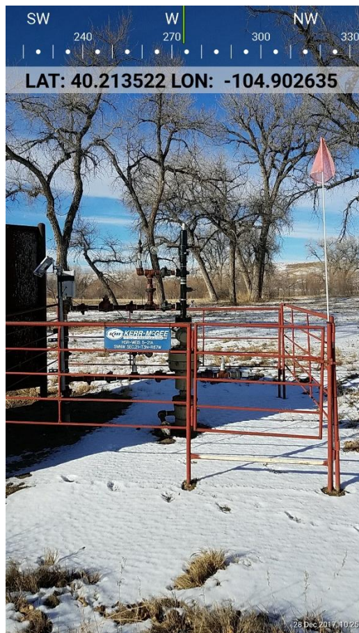
Photo 7 Wellhead API 05-123-17211