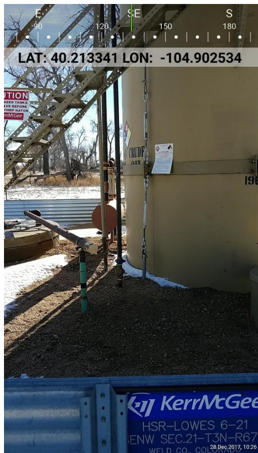
Photo 4 Flood anchoring on crude oil tank.