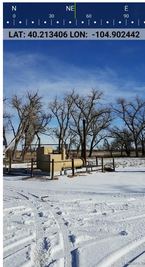
Photo 2 Separator and GMR