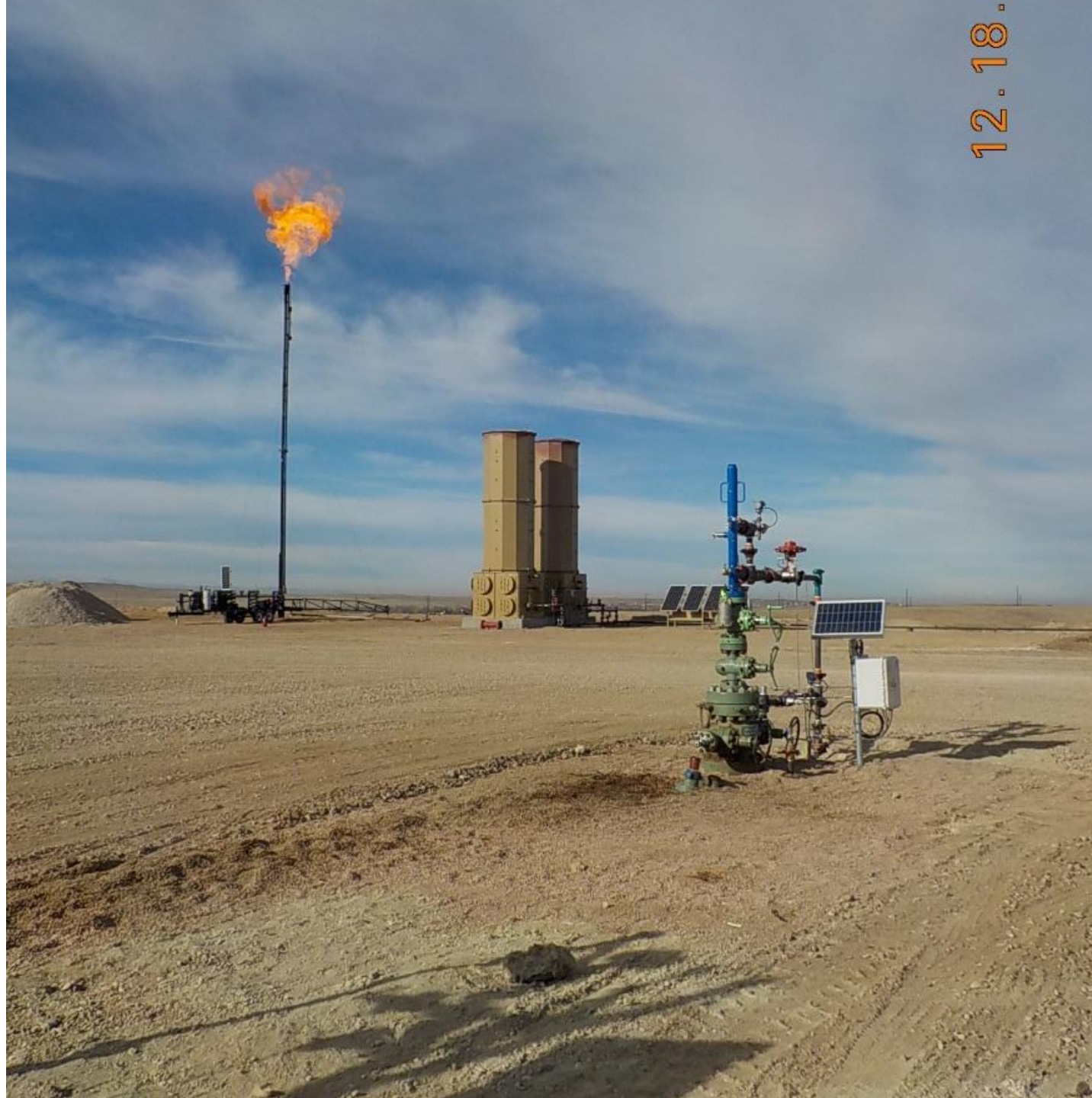
At Powell wellhead looking to the NW at gas plant flare