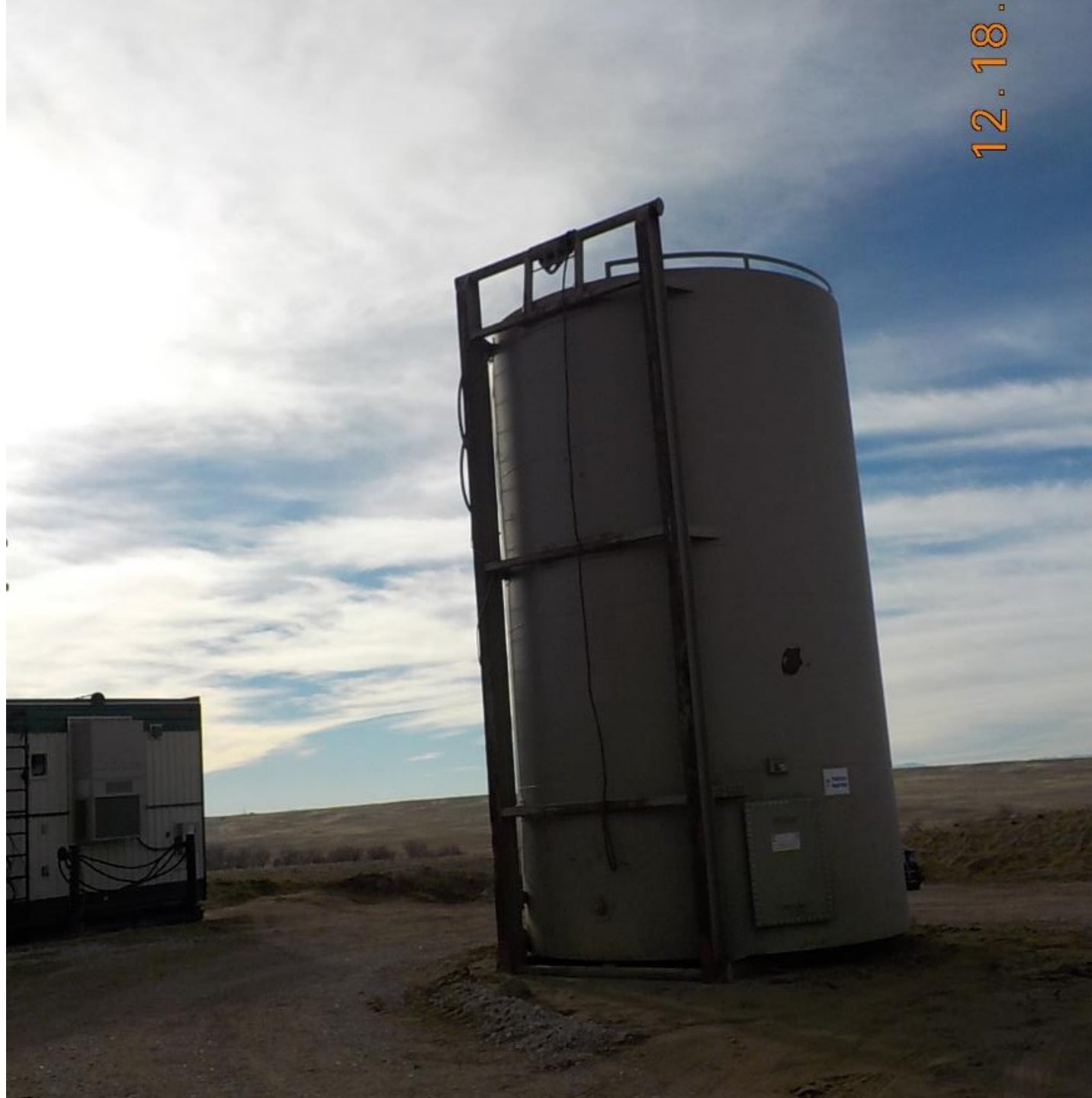
Unused tank on west side of location