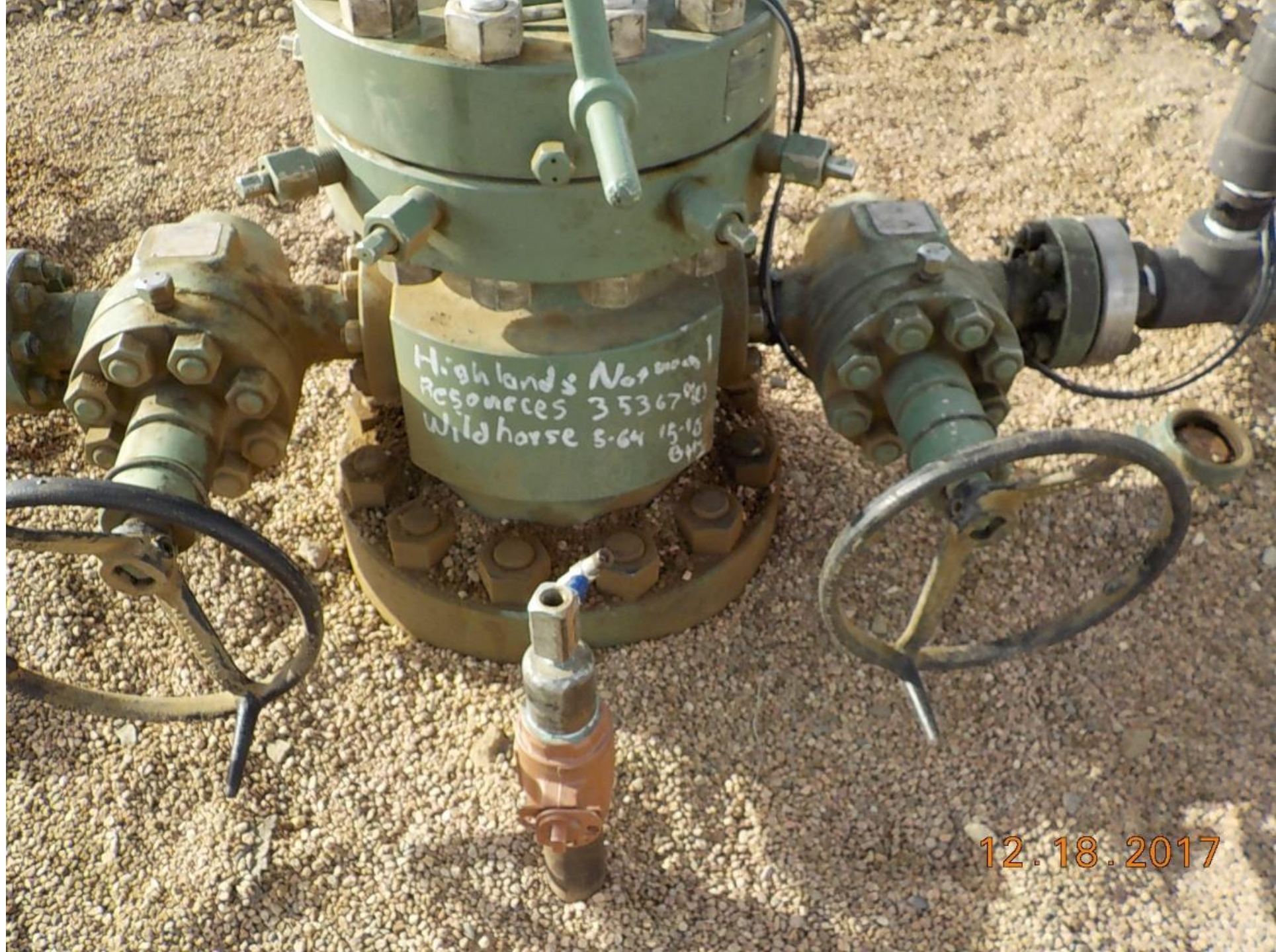
Bradenhead at Wildhorse wellhead