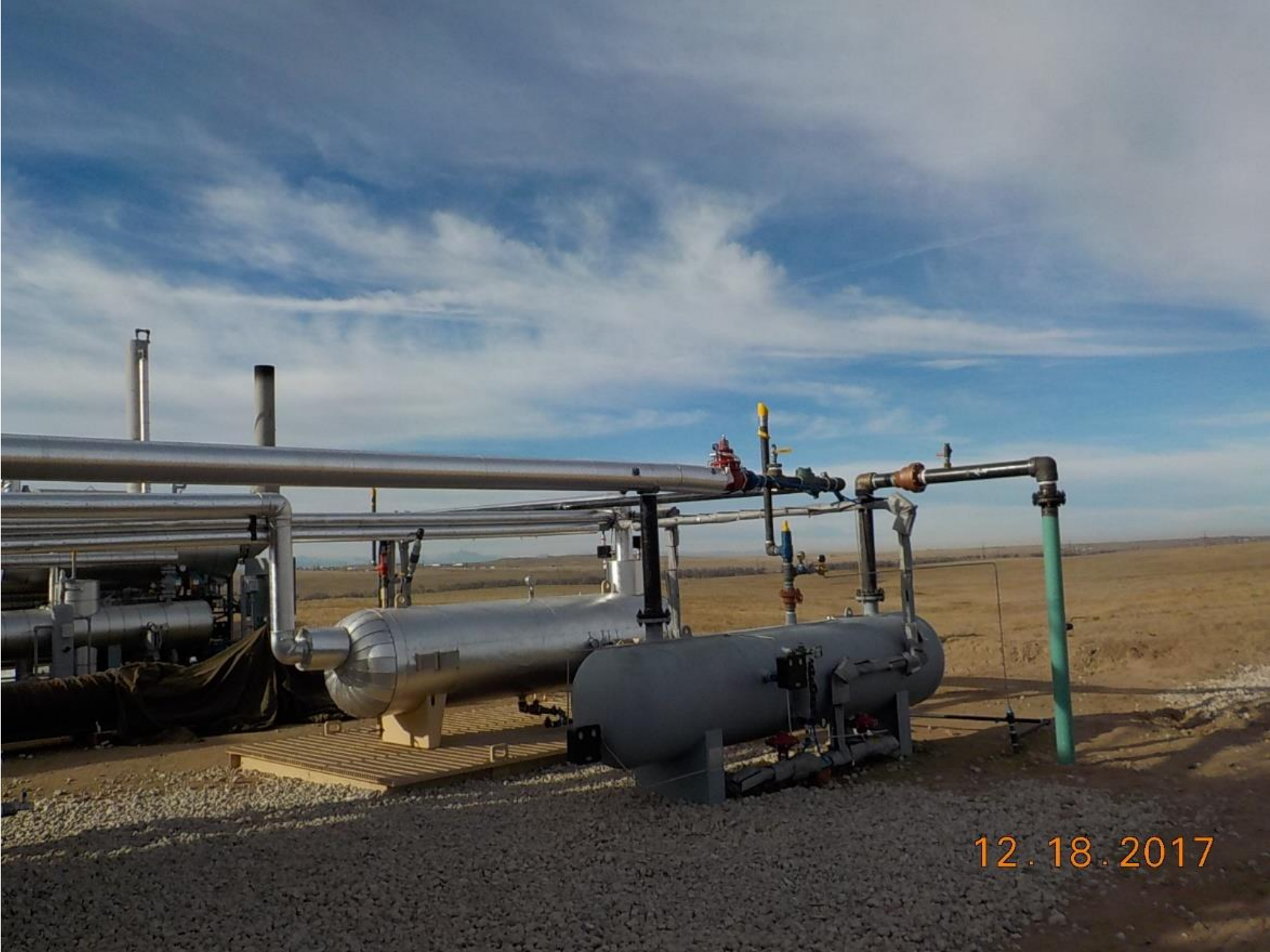
Heaters at gas plant