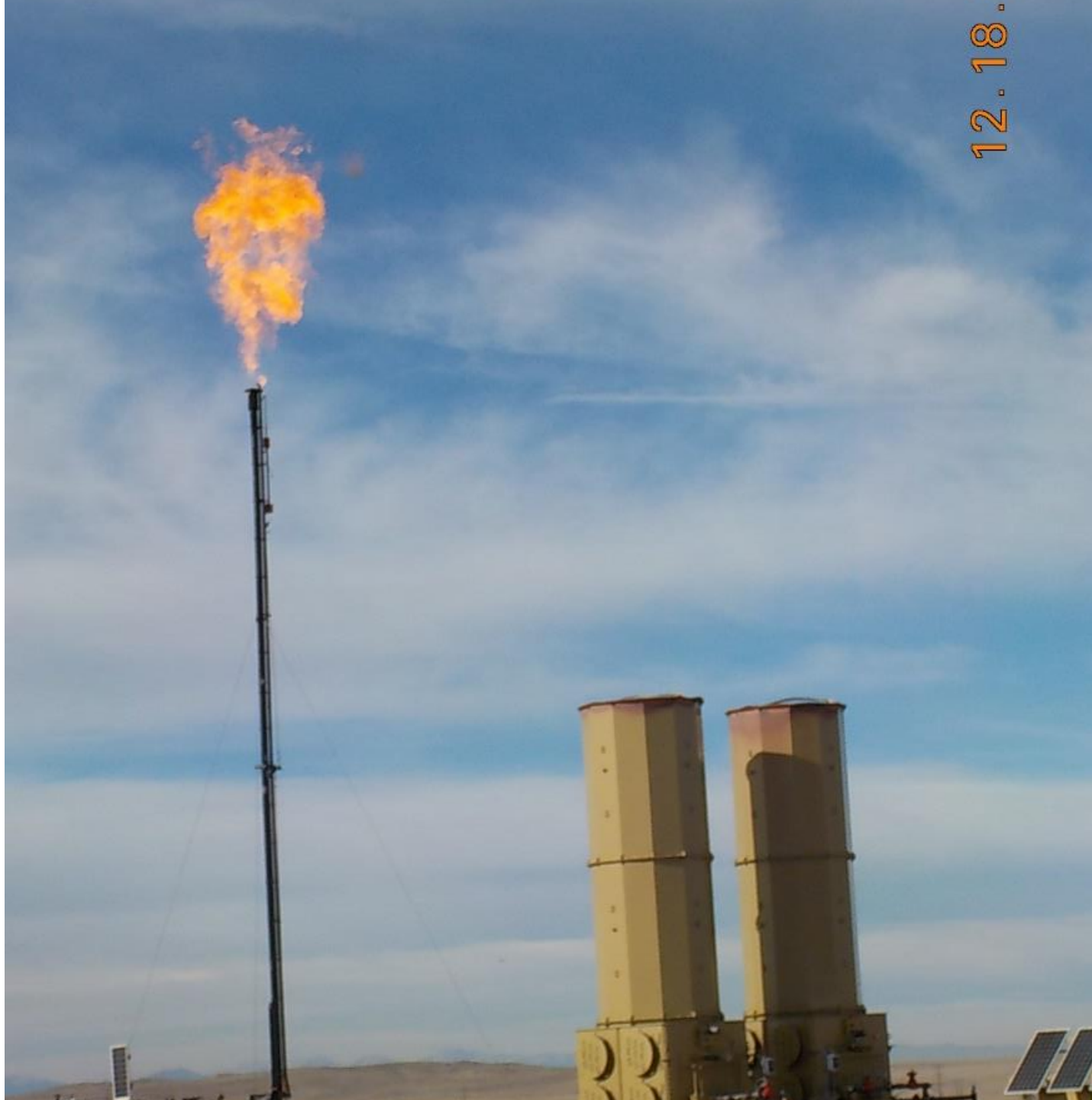
Flare and ECDs for gas plant