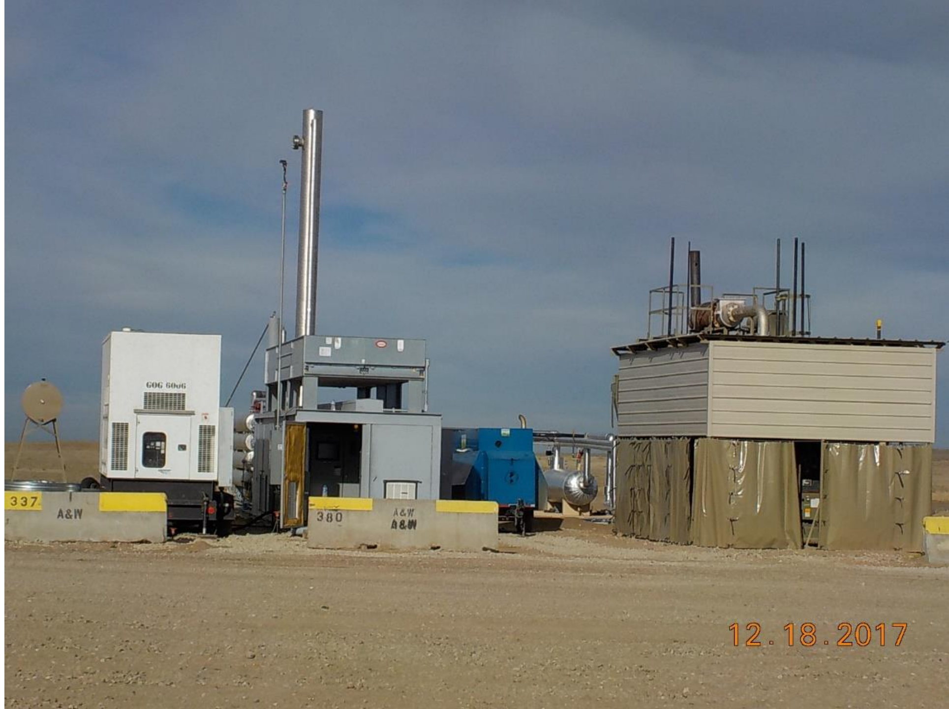
Dehy, compressor and equipment for gas plant