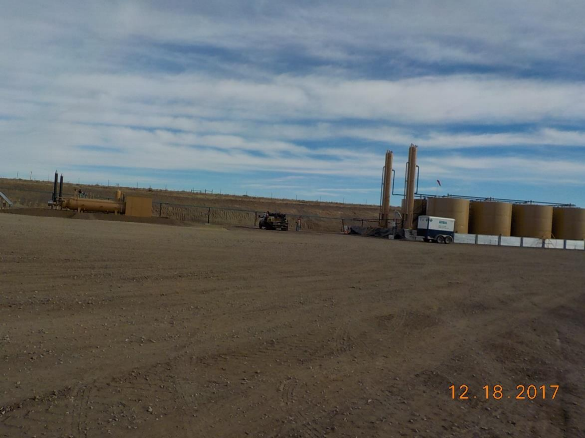
Tank battery, ECD to the left (North)