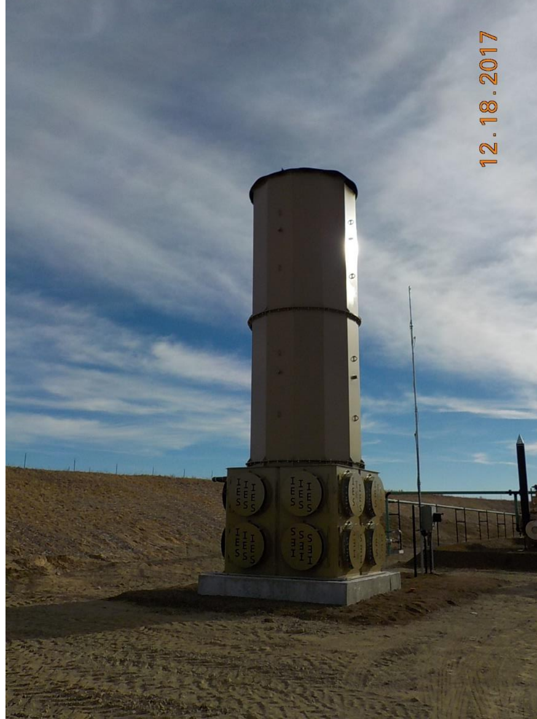
Tank battery ECD