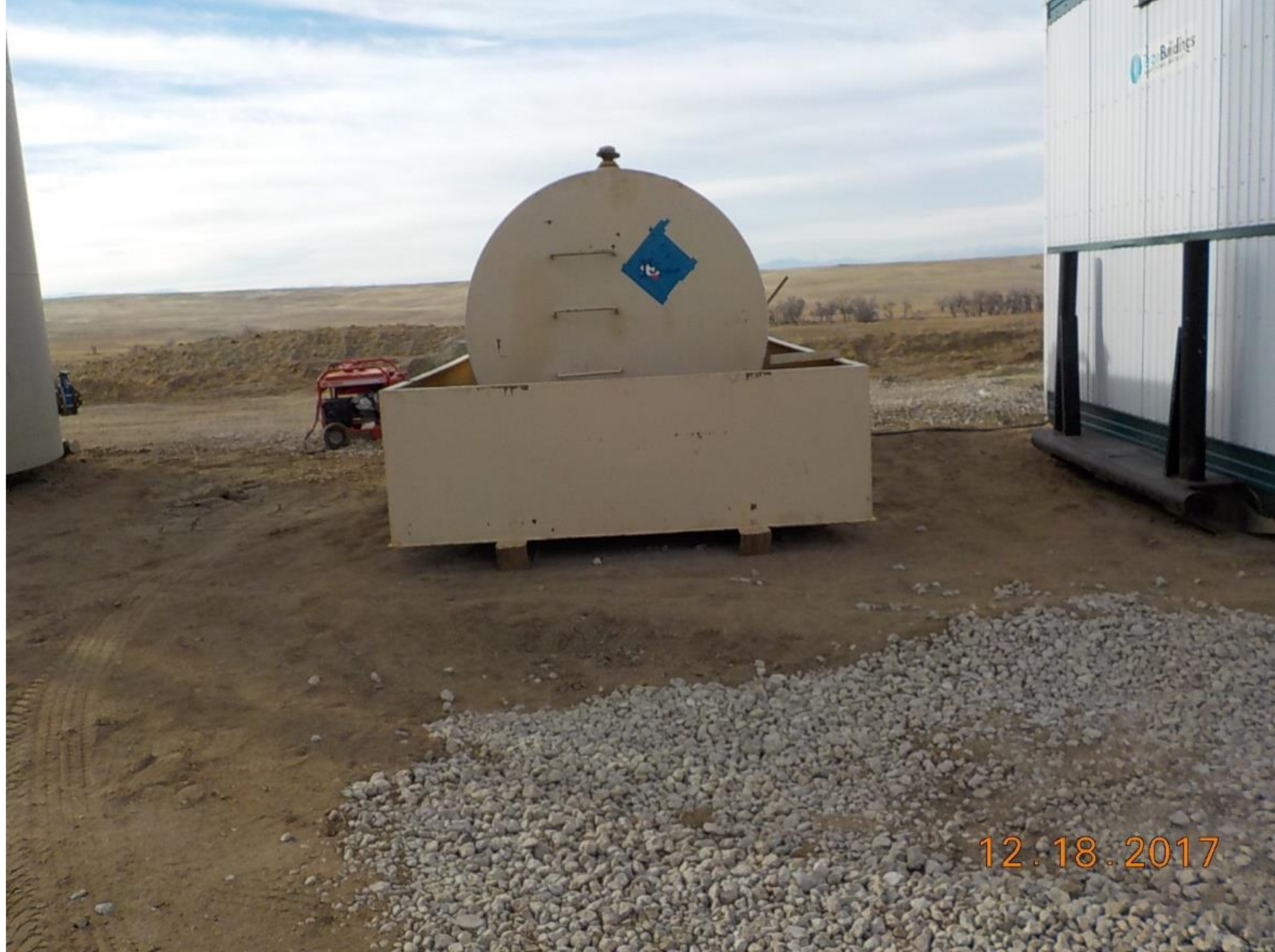
Unused tank on west side of location