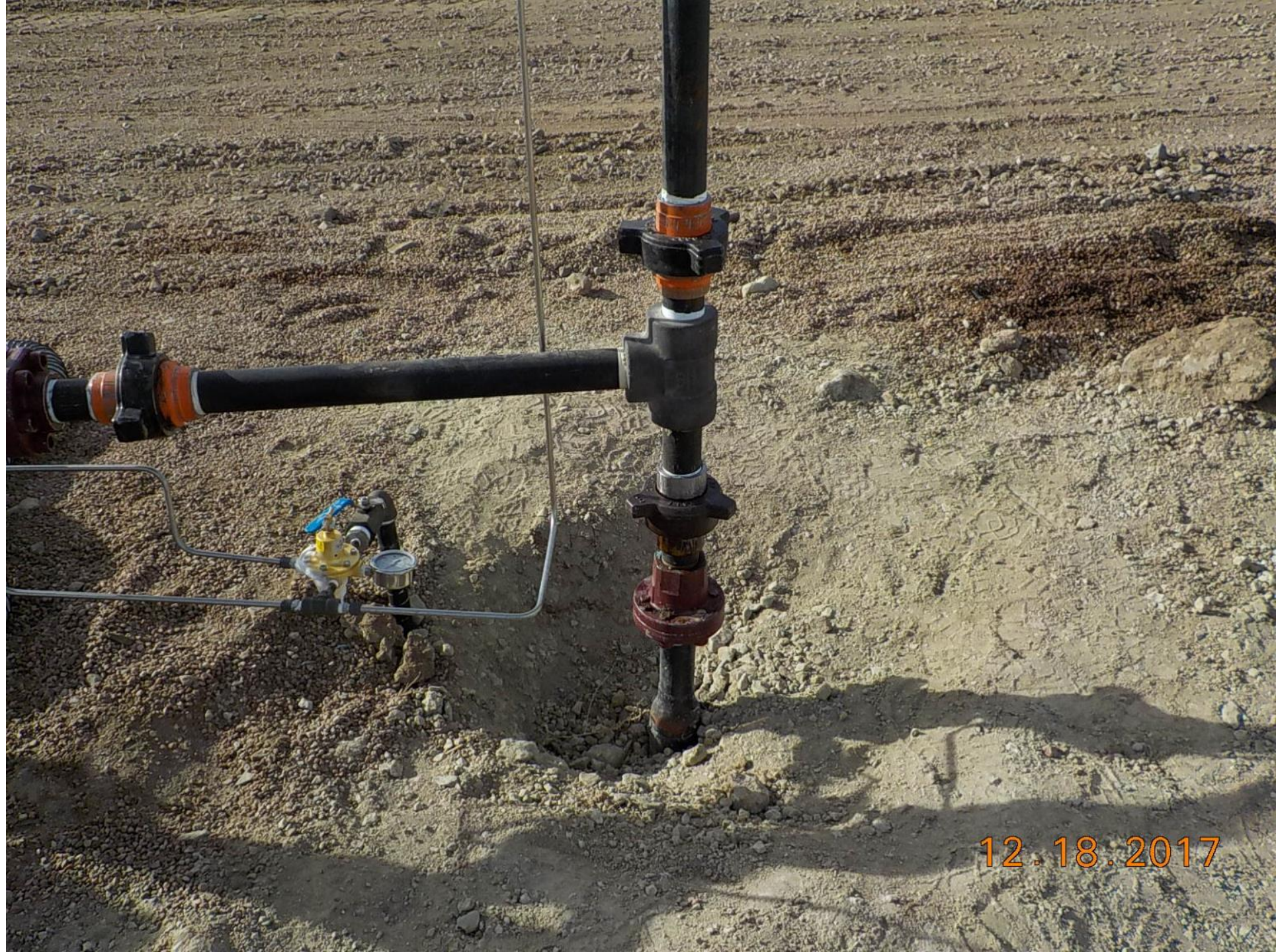
Flowline at Wildhorse wellhead