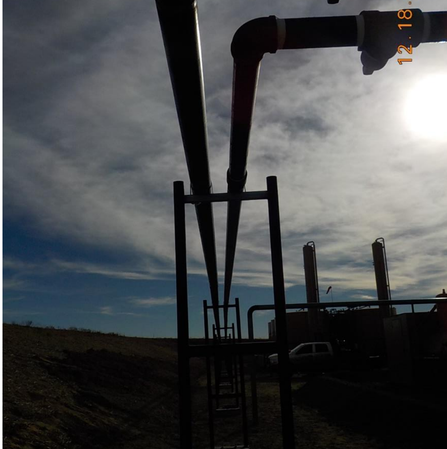
Above ground flowlines at tank battery, from ECD to tanks