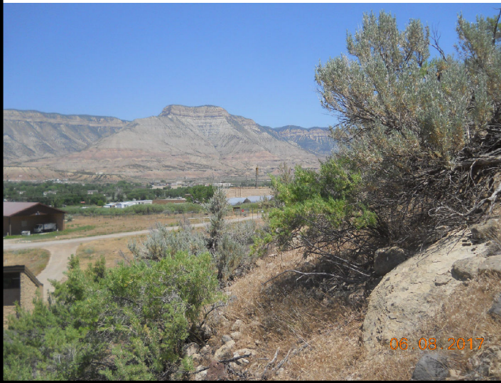
BMC A Looking North