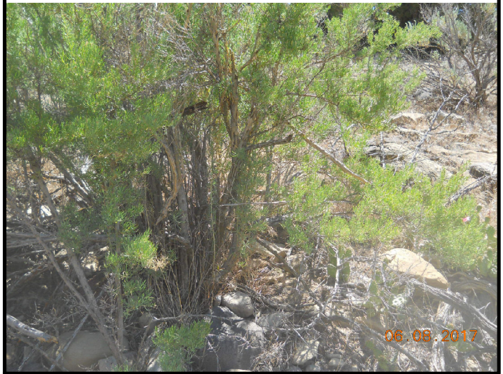
BMC A Looking East