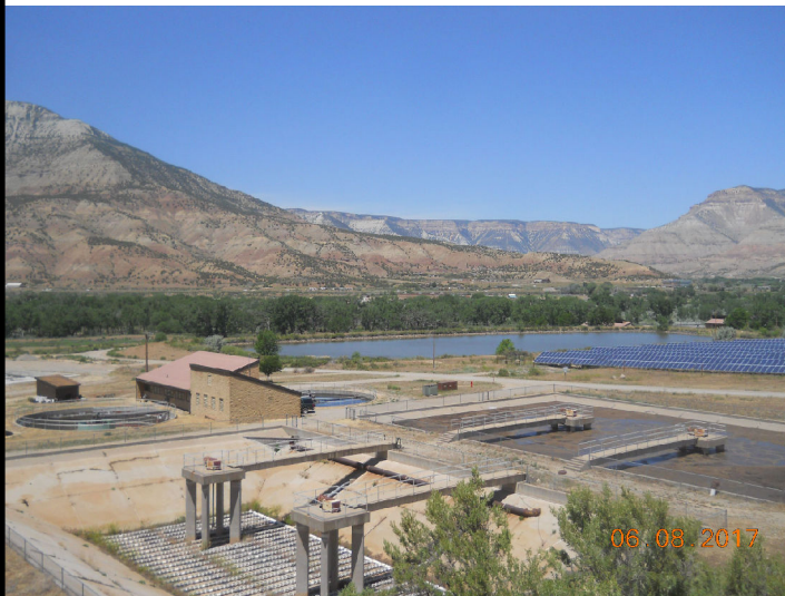
BMC A Looking West