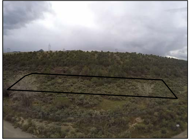
BMC A Pad Looking South April 4, 2017