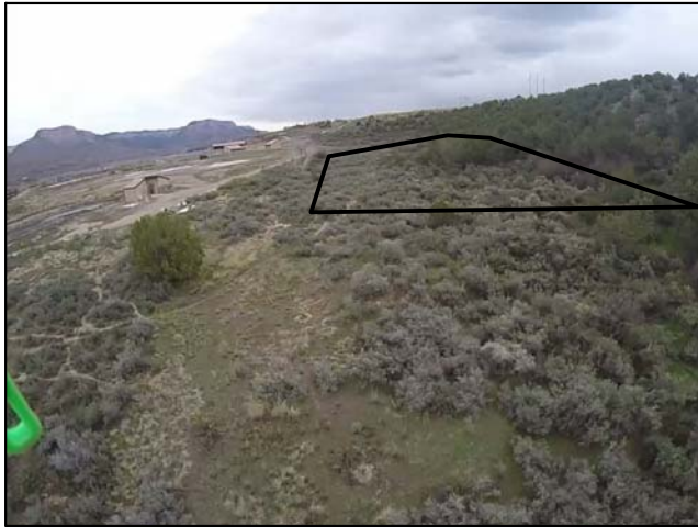
BMC A Pad Looking East April 4, 2017