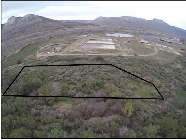
BMC A Pad Looking North April 4, 2017