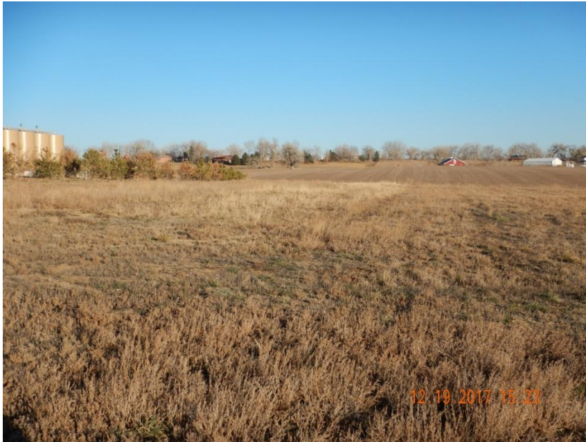
Photo 7. Photo taken from the southwestern location, facing East. See comments under Photo 1.