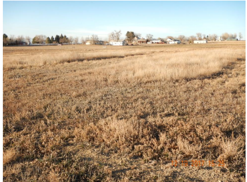
Photo 8. Photo taken from the southwestern location, facing Northwest. See comments under Photo 1.