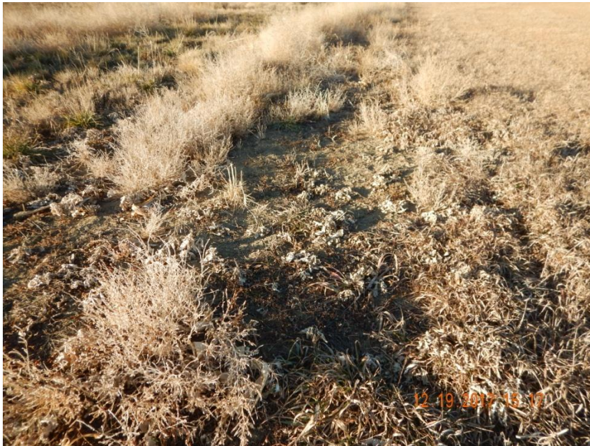
Photo 5. Photo taken from the southeastern location, facing North. Photo illustrates Canada thistle ( Cirsium arvense ) growth which is a List B Colorado noxious weed.