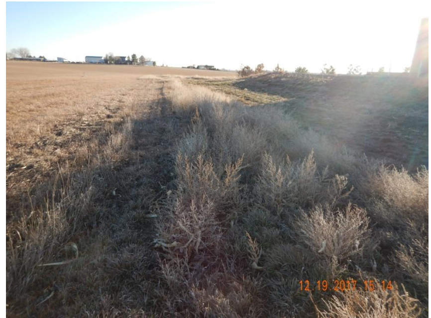
Photo 2. Photo taken from the eastern location, facing South. See comments under Photo 1.