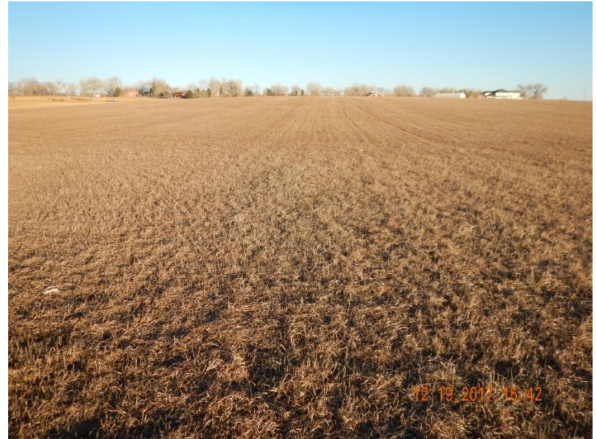
Photo 12. Reference photo taken east of the location, facing East. Reference areas mainly consist on Brome species which is not reflective of interim reclamation areas.