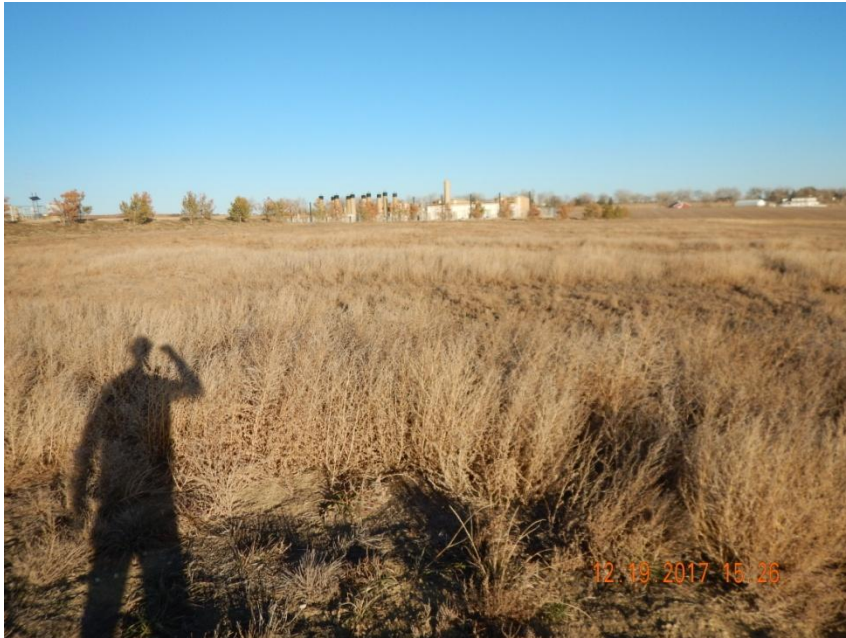
Photo 9. Photo taken from the western location, facing East. See comments under Photo 1.