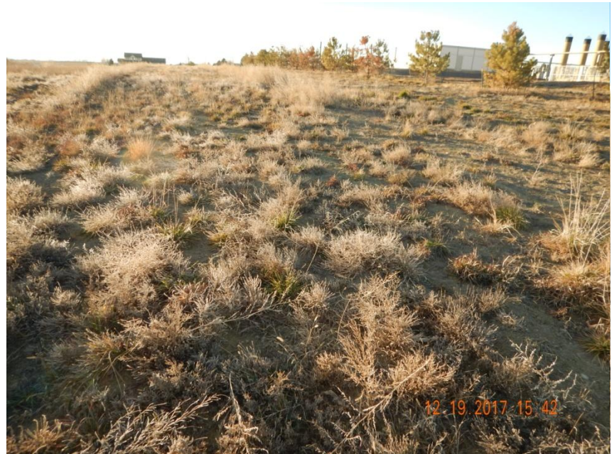
Photo 6. Photo taken from the southern location, facing West. See comments under Photo 1.