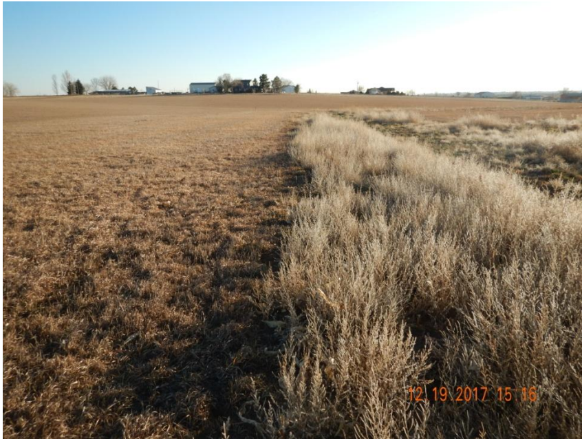
Photo 3. Photo taken from the southeastern location, facing South. See comments under Photo 1.