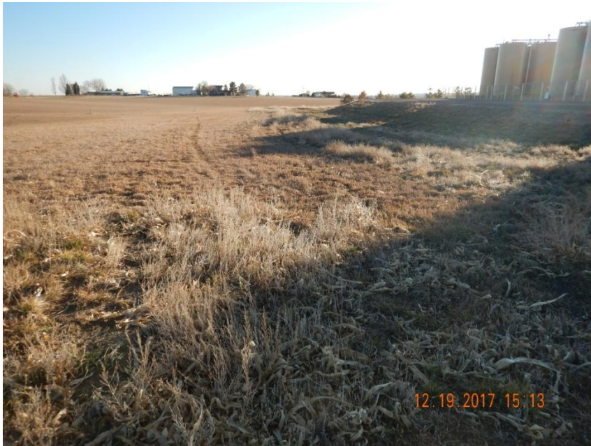
Photo 1. Photo taken from the eastern location, facing South. Interim reclamation areas are not reflective of reference area vegetative levels. Kochia ( Kochia scoparia ) is the dominate vegetative growth throughout the southern interim reclamation area. Some portions appear to be mowed while other portions have not been controlled.