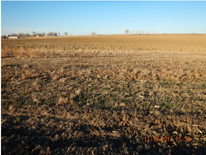
Photo 11. Photo taken from the western access road, facing North. The northern interim reclamation area is currently tilled so an assessment could not be performed.