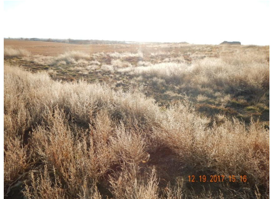
Photo 4. Photo taken from the southeastern location, facing Southwest. See comments under Photo 1.