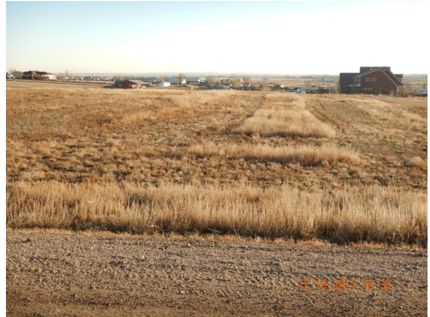
Photo 10. Photo taken from the western access road, facing South. See comments under Photo 1.