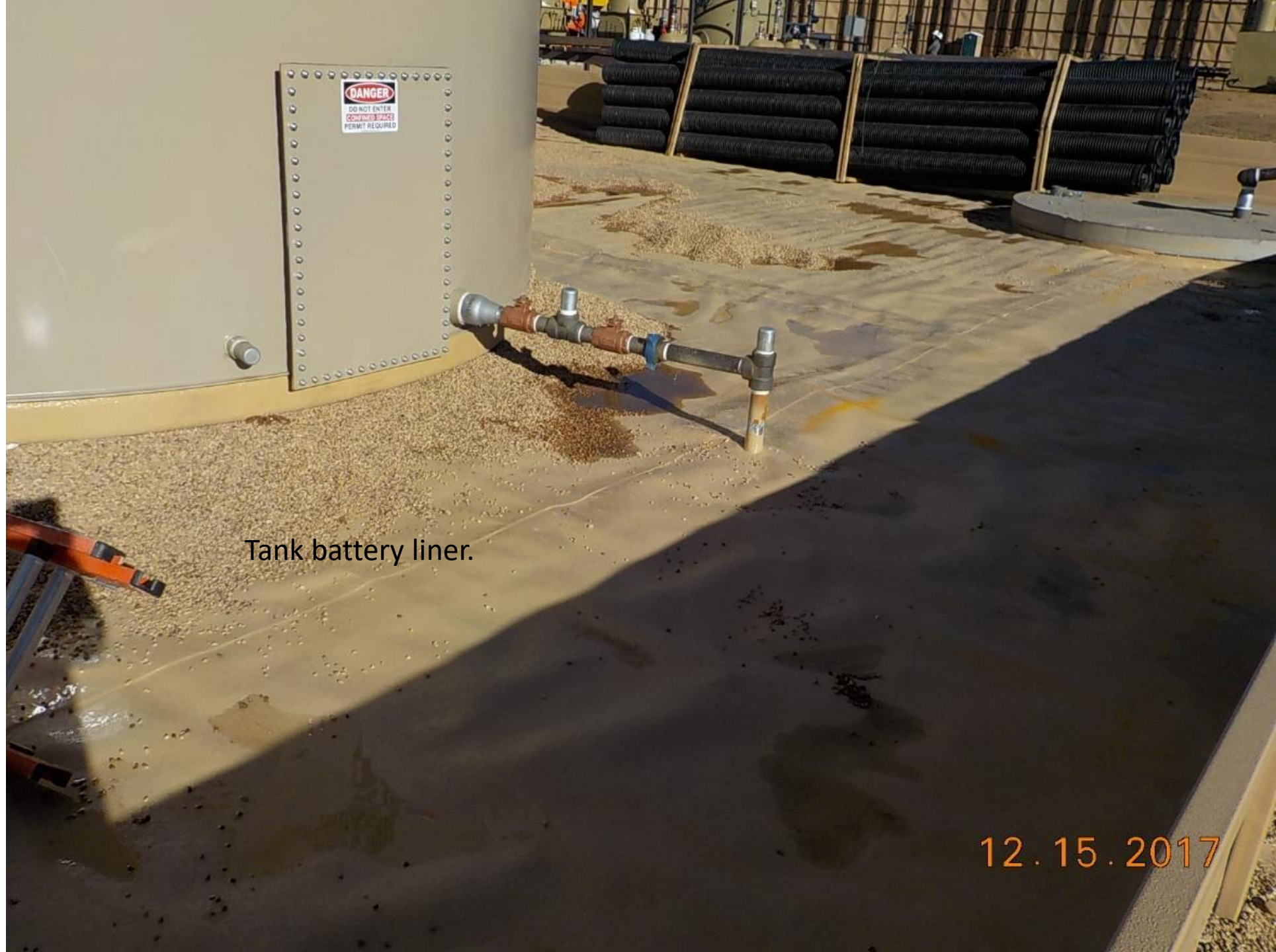
Tank battery liner.