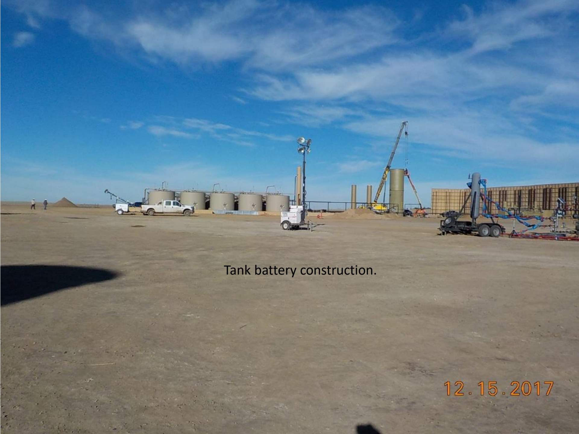
Tank battery construction.