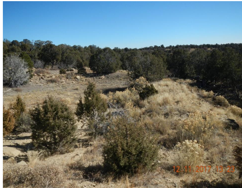
Bermed area SE of location.