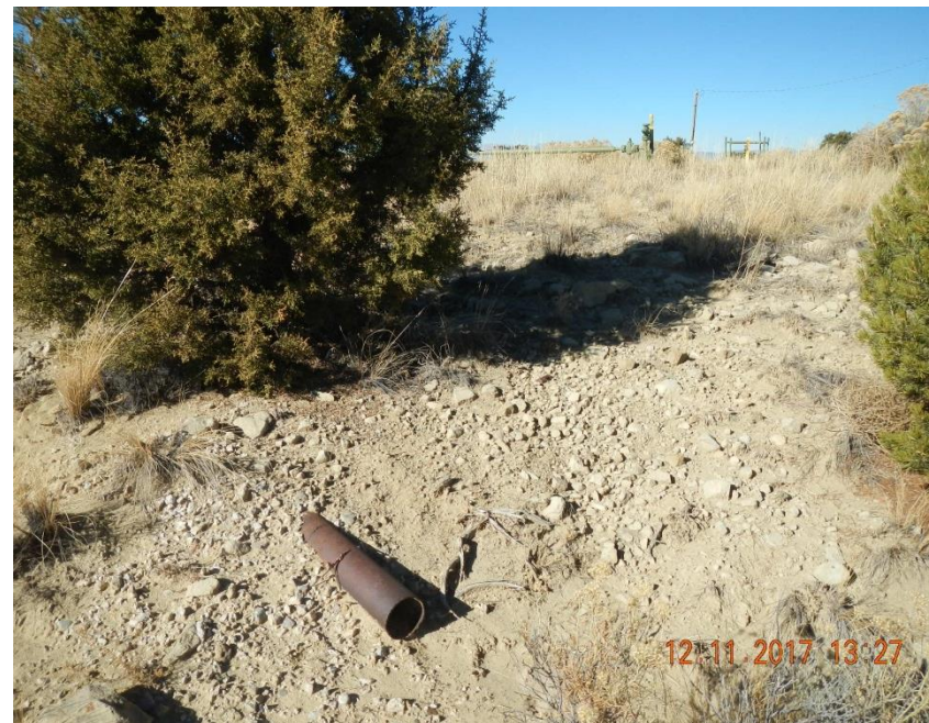
4" steel pipe outlet to pit area. Inlet was not observed during this field inspection.