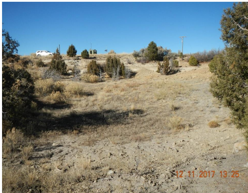
View from pit area towards location.