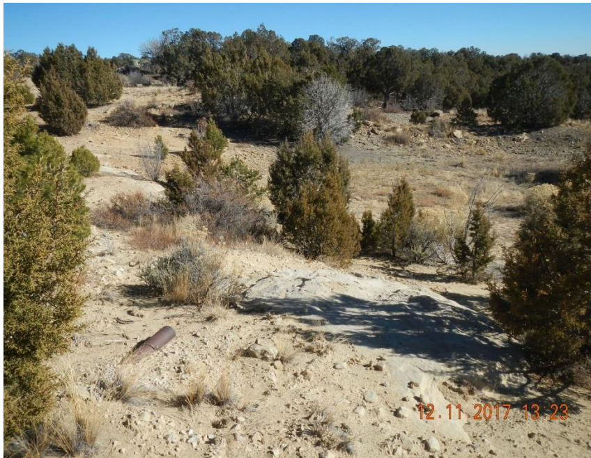
Pit area SE of location with 4" steel pipe outlet.