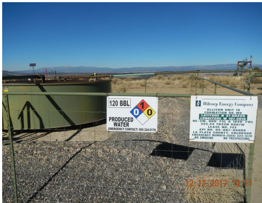
Open topped produced water vessel.