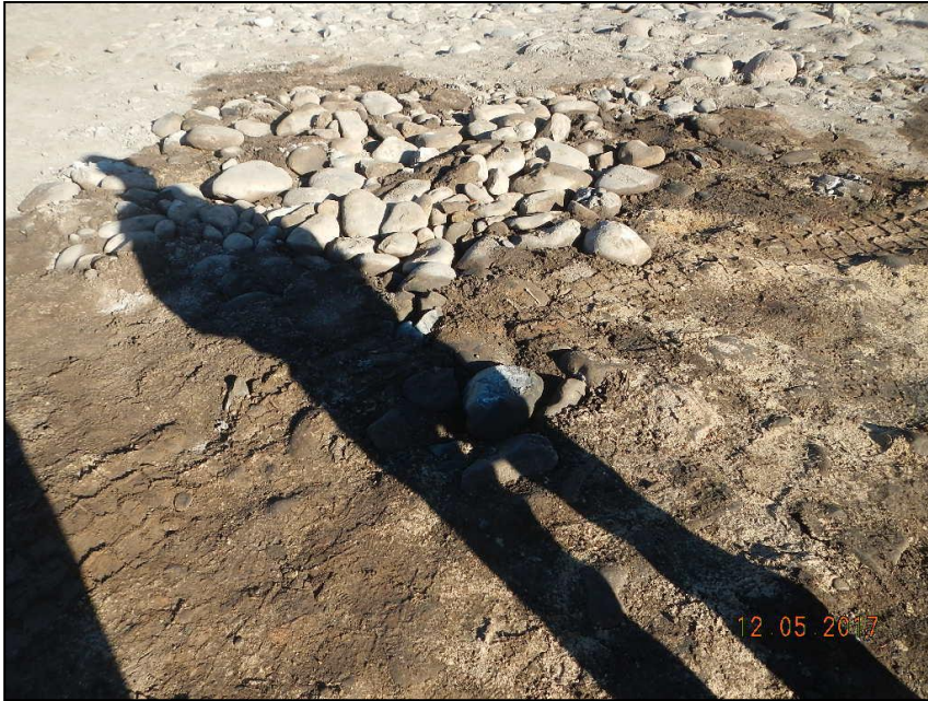
Release south of well, minimal sawdust used as response