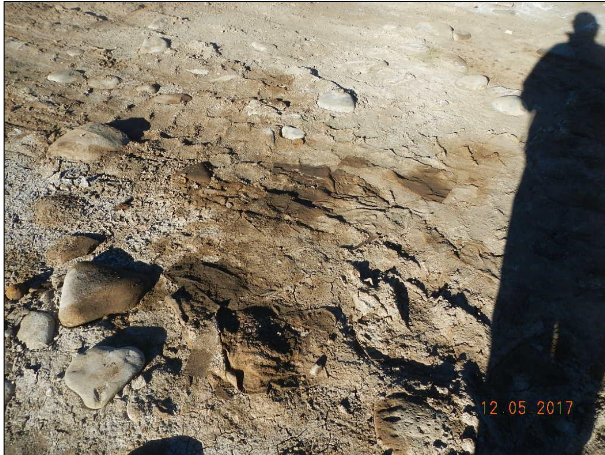
Oily rags and stained soils

Inspection Photos Location Name: Falcon Seaboard 11-90-2 API: 05-051-06139 Inspection Number: 685200414