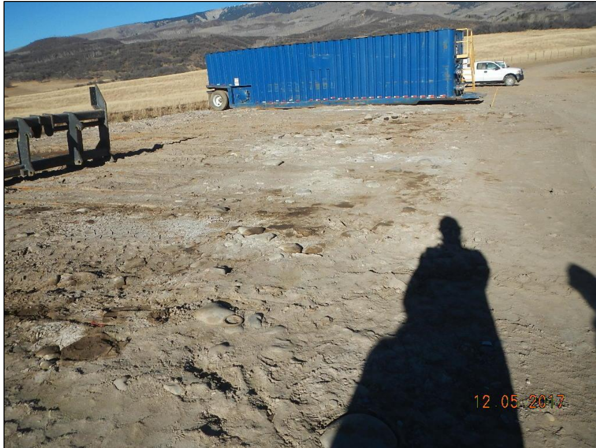
Oily and stained material where frac tanks were placed

Inspection Photos Location Name: Falcon Seaboard 11-90-2 API: 05-051-06139 Inspection Number: 685200414