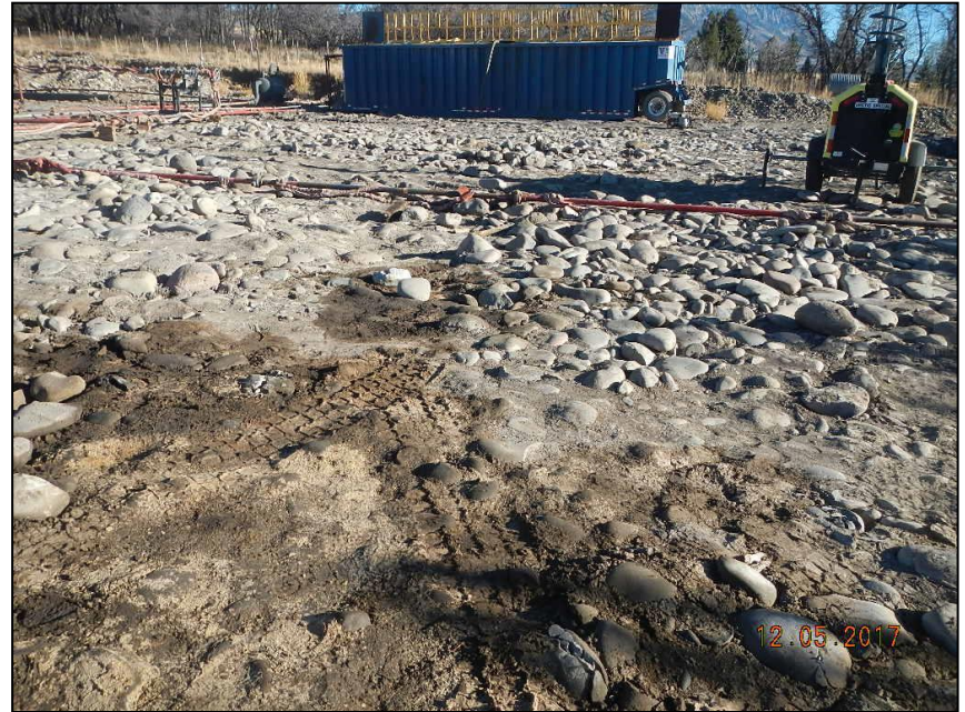
Impacted area in relation to equipment and frac lines