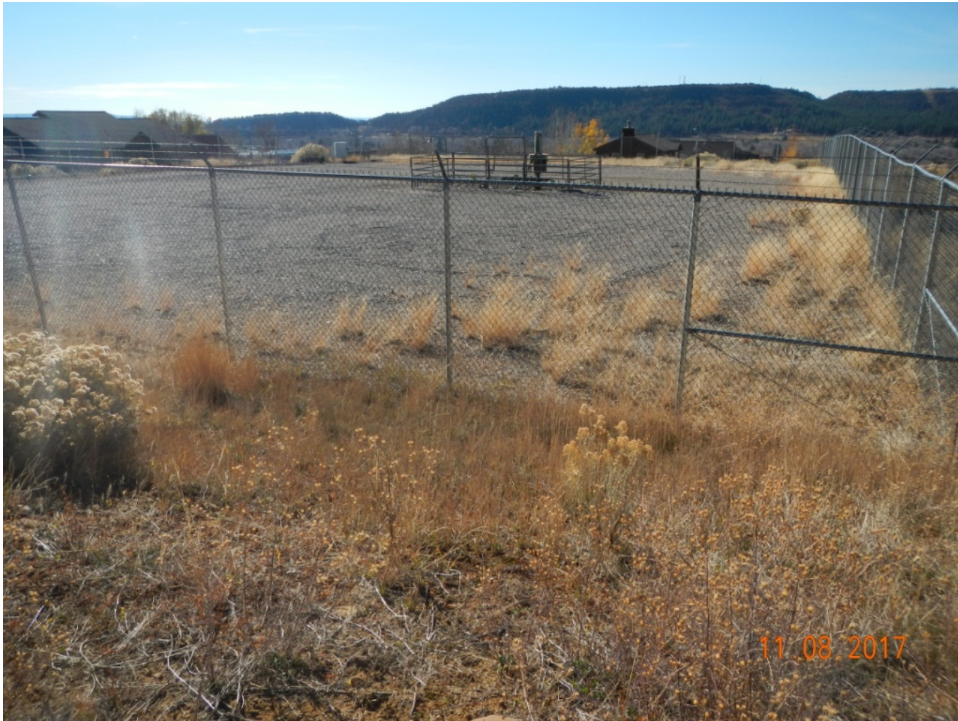
Photo 1. View from the northeastern corner of the project area facing center.