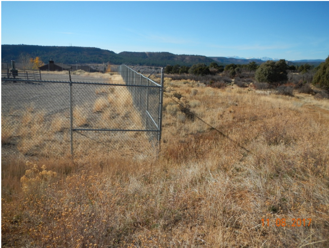
Photo 2. View of northern portion of the project area from the northeastern corner facing westward.