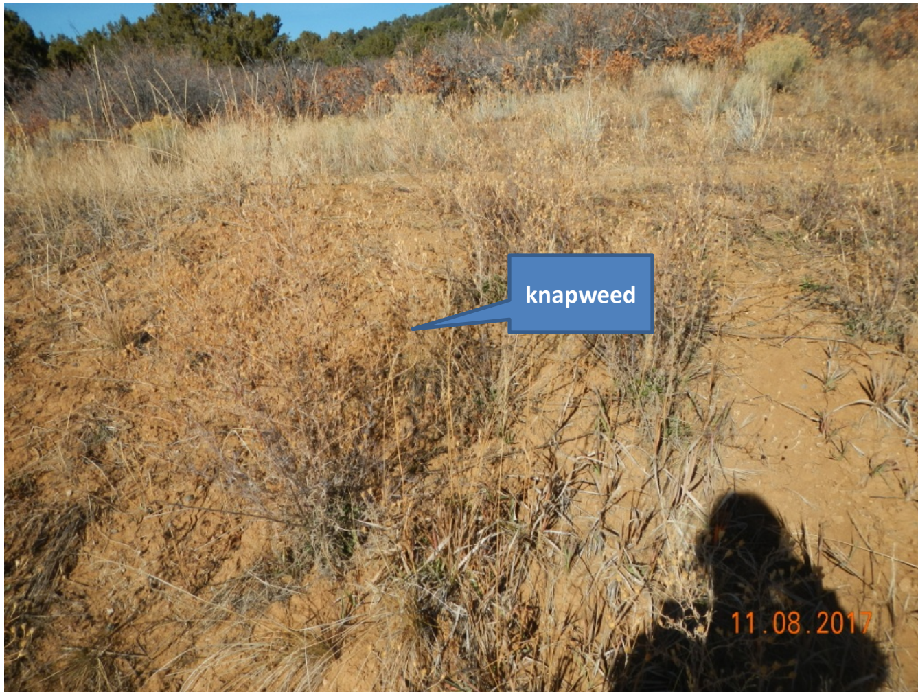
Photo 4. View of dormant knapweeds in the northeastern portion of the project area.