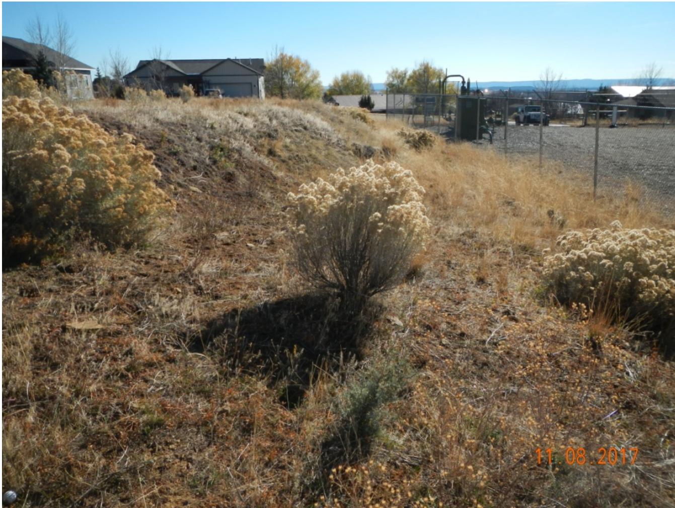
Photo 3. View of the eastern portion of the project area from the northeastern corner facing southward.