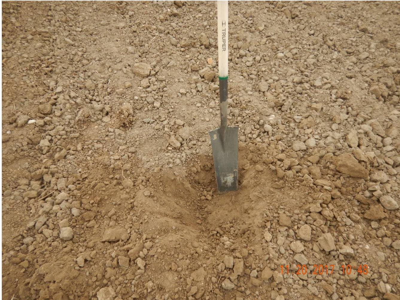
Photo 1: Photo taken from the battery location. Photo shows inspector conducted a compaction test pit. Photo shows inspector was able to penetrate the soil ~6 inches subsurface before finding a zone of compaction in the soil.