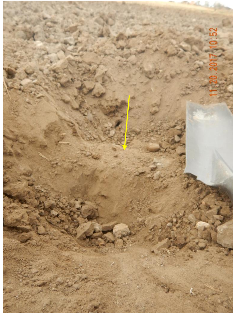
Photo 3: Close up photo of the compaction test pit dug by the inspector seen in photo 2. Photo shows the compaction zone found in the soil approximately 6 inches sub-surface.