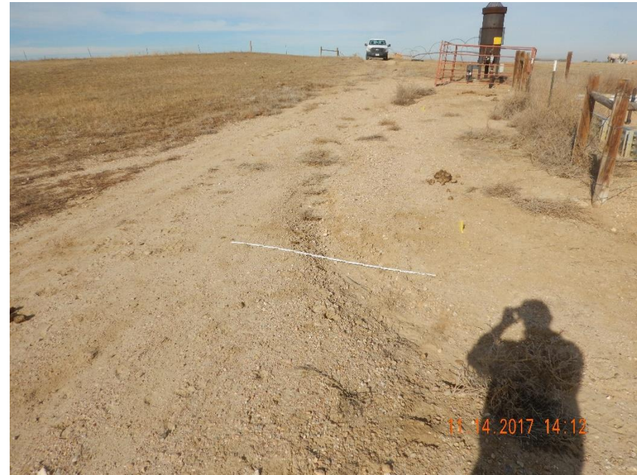
Photo 6: Photo taken from the battery location, facing north. See comments under photo 5.