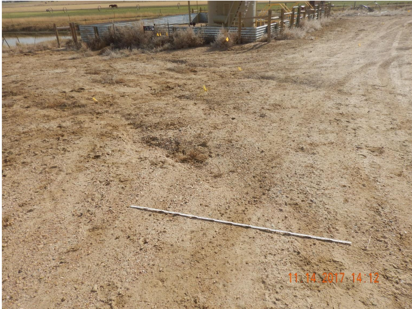
Photo 7: Photo taken from the battery location, facing south. See comments under photo 5.