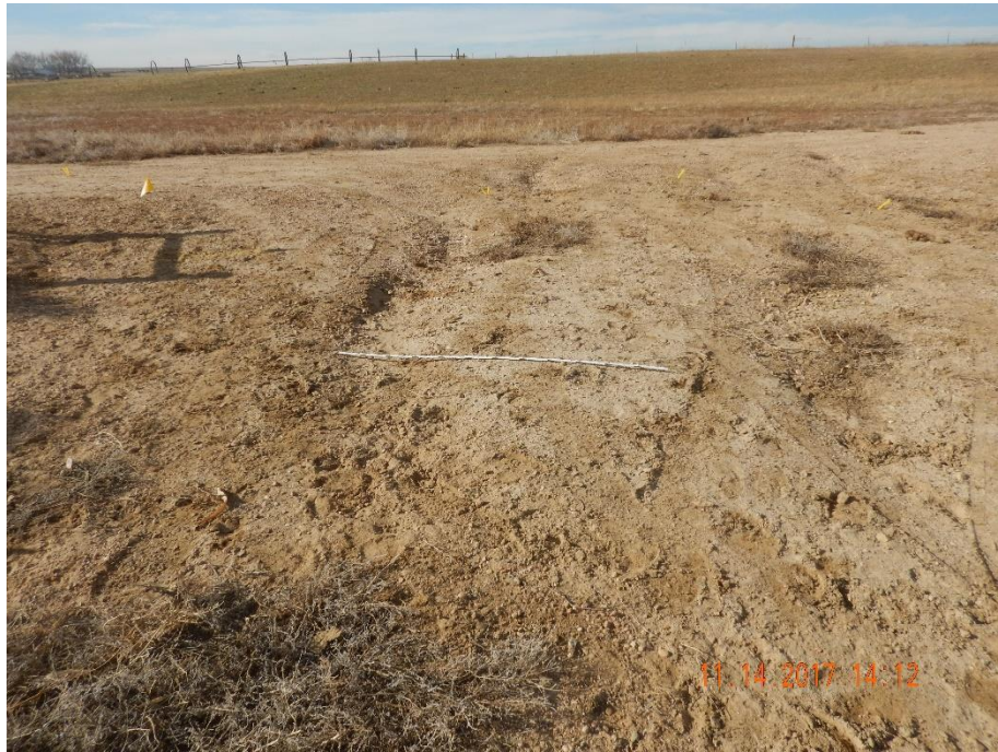
Photo 5: Photo taken from the battery location, facing west. Photo shows erosion degradation has not been repaired or stabilized per corrective actions. 6 foot measuring stick for reference.