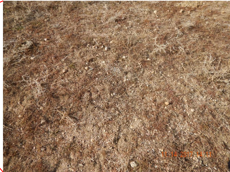
Photo 4: Photo taken from the well location. Photo shows well site has not been returned to its designated final land use (reference area alfalfa). Vegetation seen here predominantly undesirable weedy plant species such as kochia. Photo also shows gravel remains at well site.