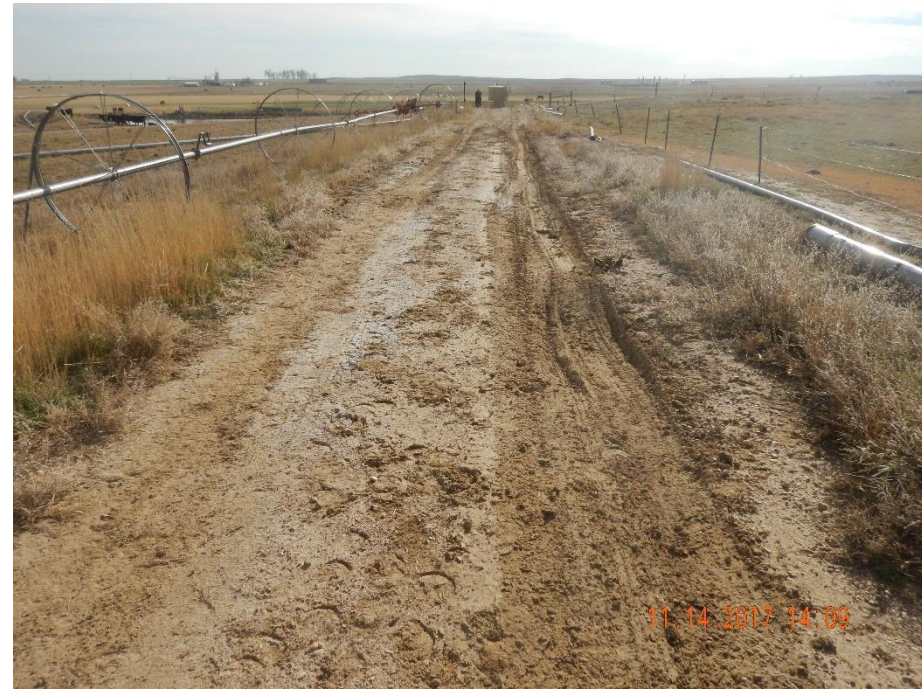
Photo 2: Photo taken from the access road, north of the location. Photo shows maintenance has not occurred on access road per CA's. Ha