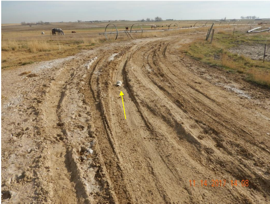
Photo 1: Photo taken from the access road, north of the location. Photo shows maintenance has not occurred on access road per CA's. Hat in photo for reference