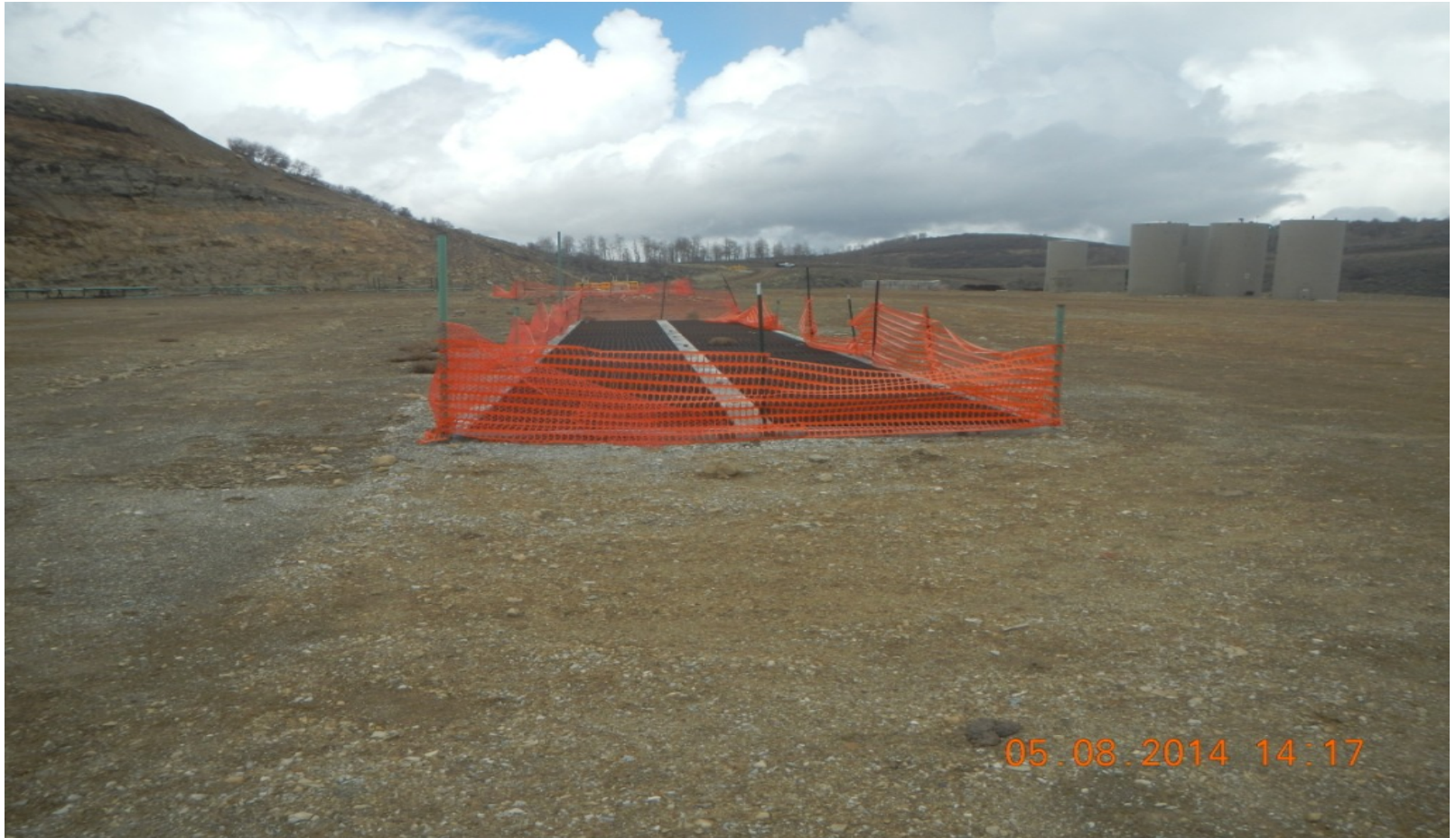
Photo from 5/8/14 Inspection of Concrete Cellar with 15 Conductors Set.