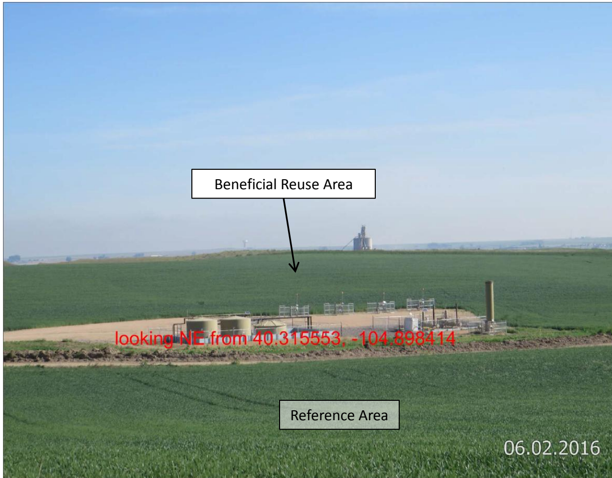
Photo 4. Photo taken on June 2, 2016 by COGCC staff from the previously mentioned coordinates, facing Northeast. The photo illustrates the eastern half of the Sundance Beneficial Reuse Area (BRA) which is the northernmost wheat field. Based off this photo, it appears the BRA was reflective of reference crop area levels, indicating the BRA has met Rule 1004 standards.