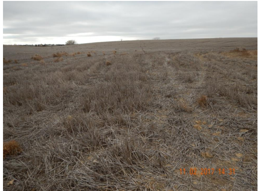
Photo 2. Reference photo taken on November 2, 2017 from the wheat field southwest of the BRA, facing West. Wheat stubble in reference crop areas appear to be reflective of the BRA, indicating the BRA has met Rule 1004 standards.