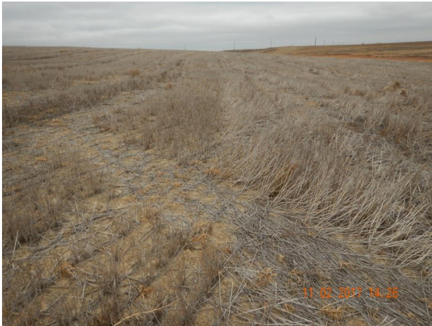
Photo 1. Photo taken on November 2, 2017 from the south central BRA, facing East. Wheat stubble from the 2016 harvest appeared to have uniform establishment and density reflective of reference crop area levels, indicating the BRA has met Rule 1004 standards. See photo 2 illustrating a reference area.