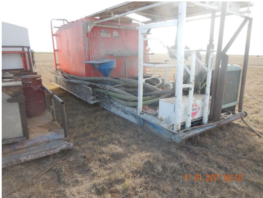
Photo 6: Photo taken from the east end of the location. Photo shows equipment has been brought onto the location. Photo shows that, with exception to a pit on the south end, no topsoil salvage on the location has occurred. All equipment and materials have been placed directly on the surface of the soil.