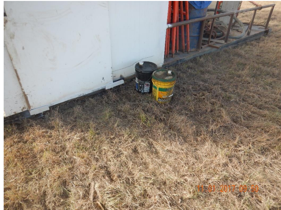
Photo 5: Photo taken from the northeast area of the location. Photo shows buckets placed directly upon topsoil. This is poor good-housekeeping and materials management.