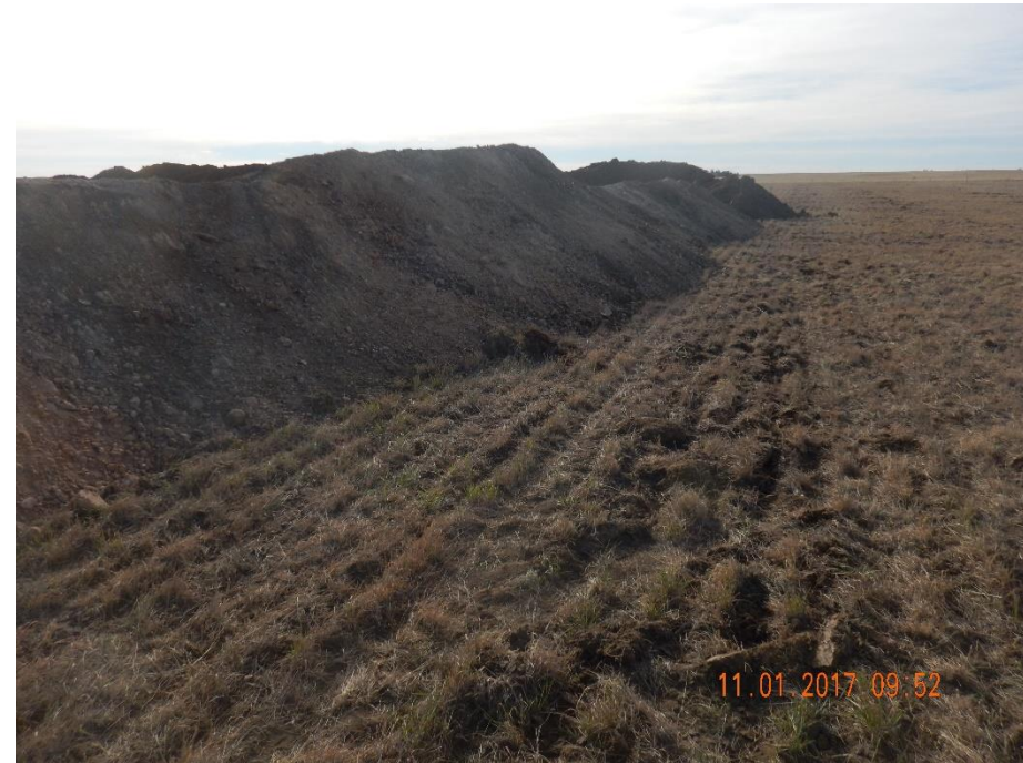
Photo 12: Photo taken from the west end of the pit, facing south. See comments under photo 11.