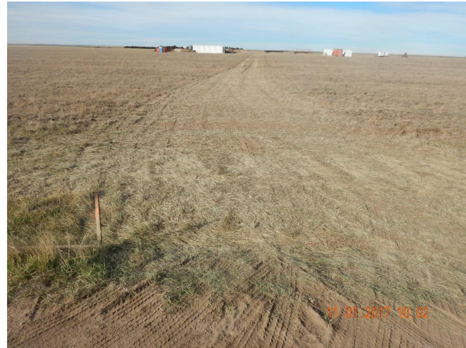
Photo 30: Photo taken from the country road, east of the location, facing west. Photo shows access road leading to the location. Photo shows no topsoil has been salvaged from the access road. Operator appears to have traveled over the surface to access location.