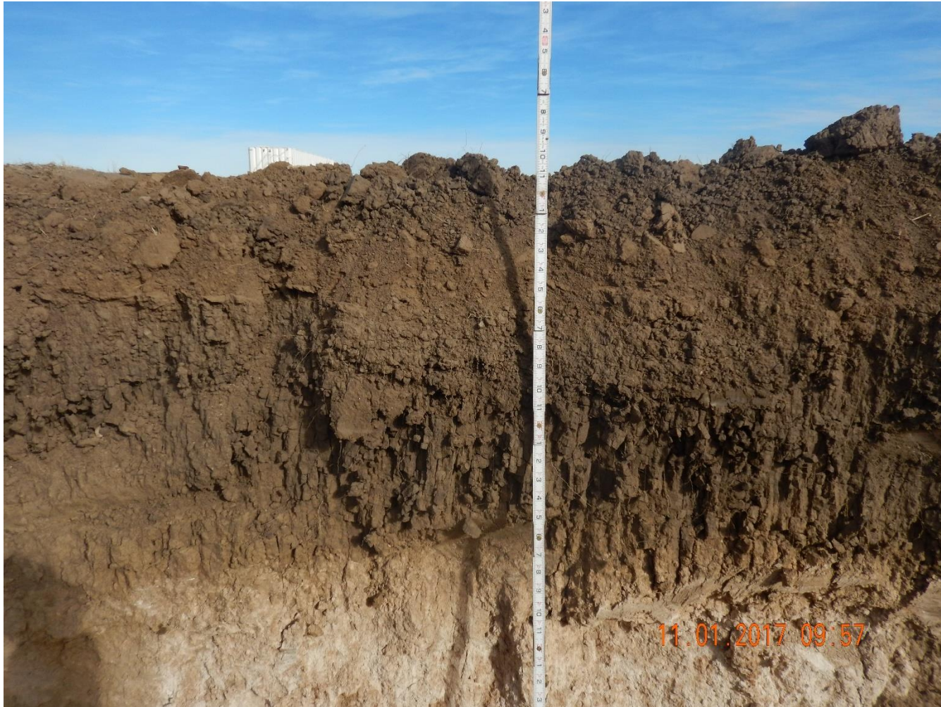
Photo 23: Photo taken from within pit seen in photo 21. Photo shows topsoil layer. Topsoil appears to be ~ 2 feet in depth.