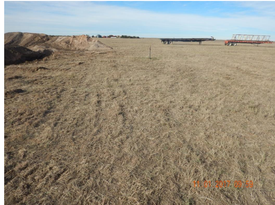
Photo 28: Photo taken from the location, facing west. Photo shows well marker. Photo also shows that no topsoil salvage has occurred at the well marker.