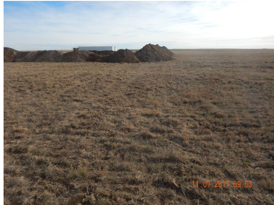
Photo 14: Photo taken from the southwest area of the location, facing east. See comments under photo 13.