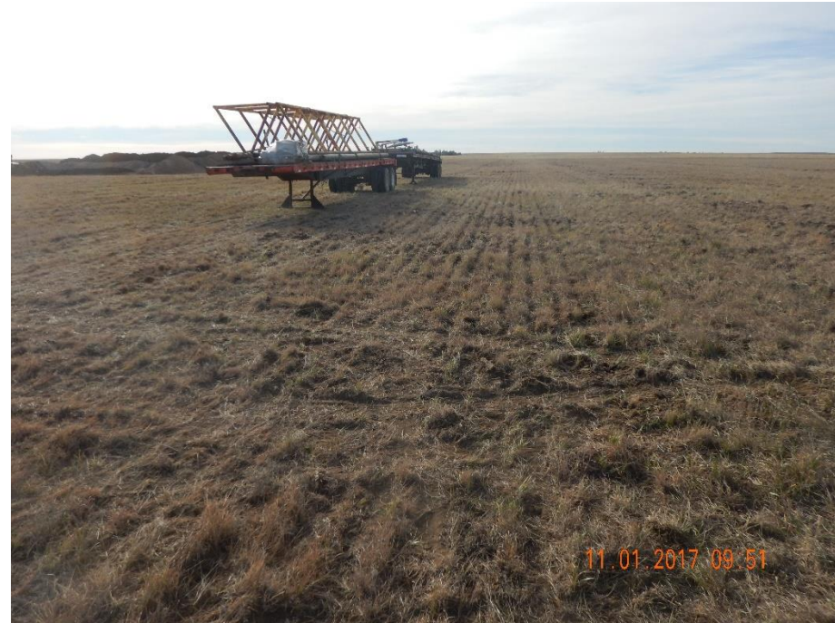
Photo 9: Photo taken from the northwest end of the location, facing south. See comments under photo 6.