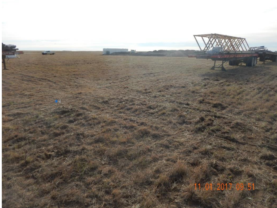
Photo 8: Photo taken from the northwest end of the location, facing southeast. See comments under photo 6.