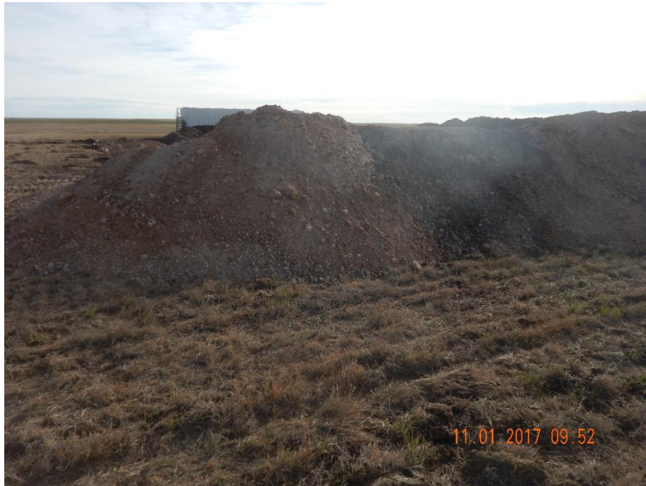
Photo 11: Photo taken from the west end of the pit, facing east. Photo shows topsoil pile has not been stabilized with good engineering practices. This is not protective of soils in accordance to 1002.c. Photo also shows that surface roughening appears to have been implemented throughout the site. Surface roughening is a temporary BMP that should be used in conjunction with other BMPs. Additional BMPs will be required.