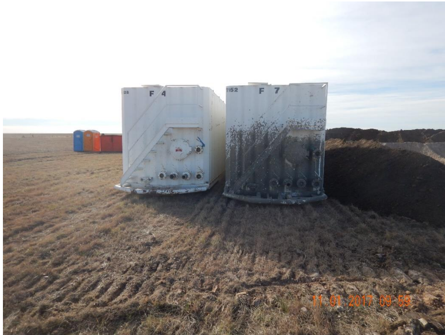
Photo 27: Photo taken from the east end of the location, facing south. Photo shows equipment has been brought onto the location. Photo shows that, with exception to a pit on the south end, no topsoil salvage on the location has occurred. All equipment and materials have been placed directly on the surface of the soil.