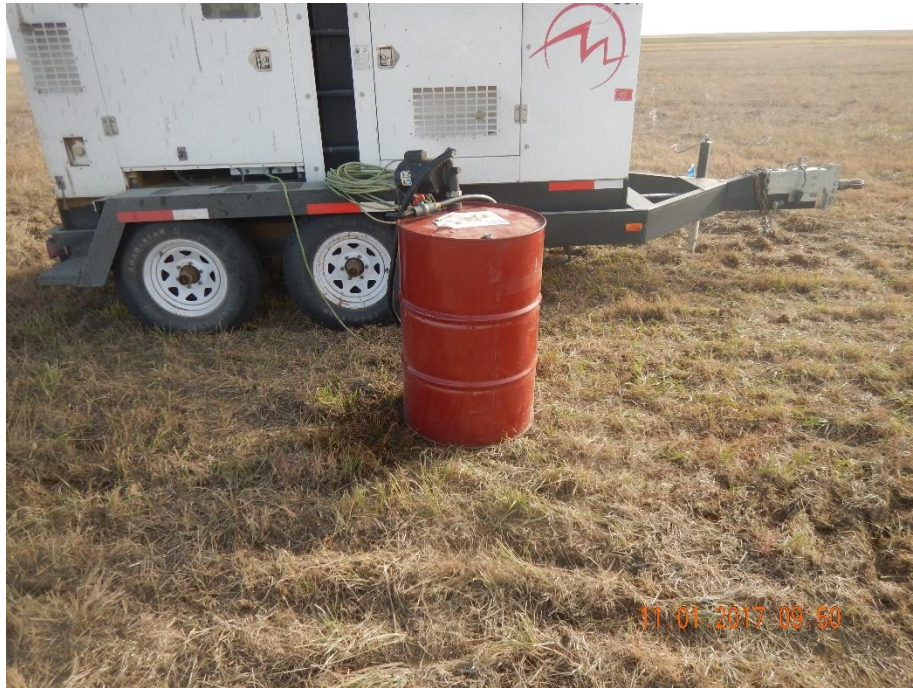
Photo 4: Photo taken from the northeast area of the location. Photo shows barrel placed directly upon topsoil. This is poor good-housekeeping and materials management.