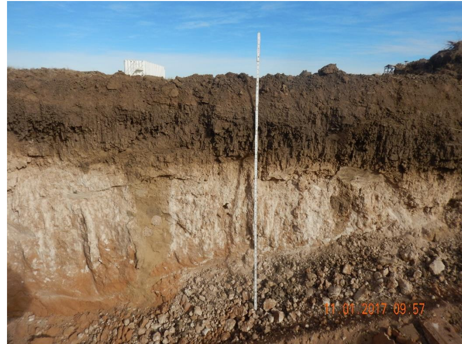
Photo 22: Photo taken from within pit seen in photo 21. Photo shows topsoil and soil horizons at the location. 6 foot measuring stick for reference.