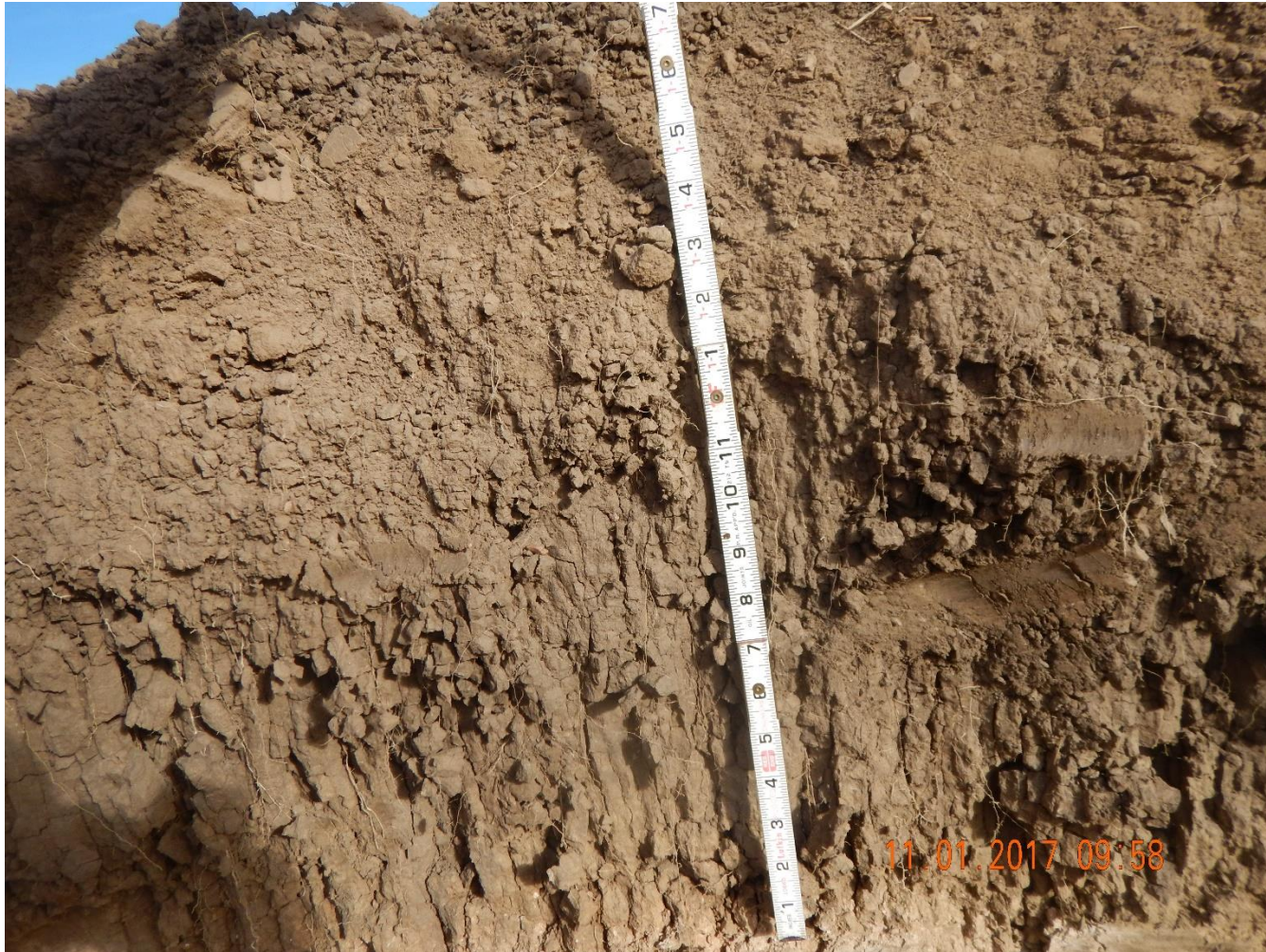
Photo 24: Photo taken from within pit seen in photo 21. Photo shows topsoil layer. Topsoil appears to be ~ 2 feet in depth.