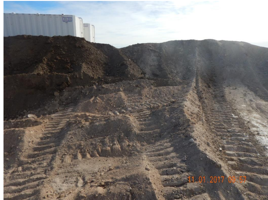
Photo 26: Photo taken from the within the pit, facing east. Photo shows soil horizons to not appear to be stored separately from one another per 1002.b.