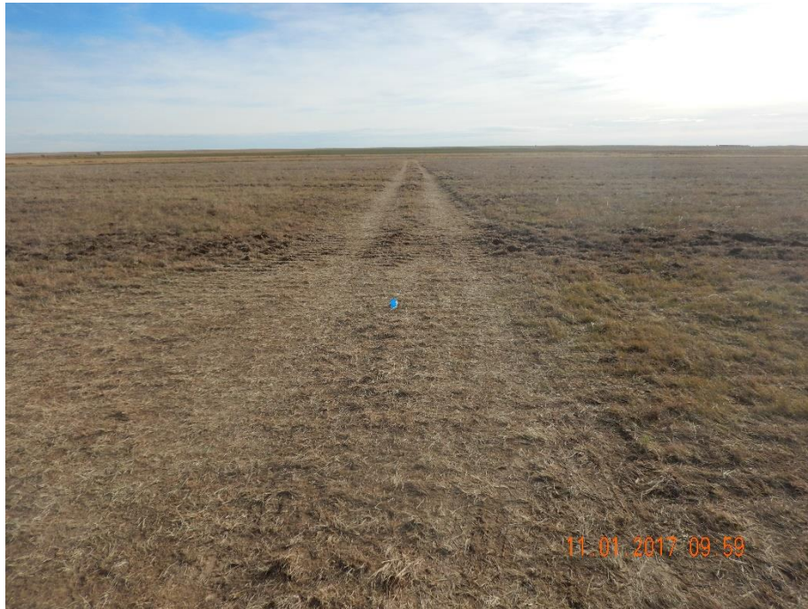
Photo 29: Photo taken from the east end of the location, facing east. Photo shows access road leading to the location. Photo shows no topsoil has been salvaged from the access road. Operator appears to have traveled over the surface to access location.