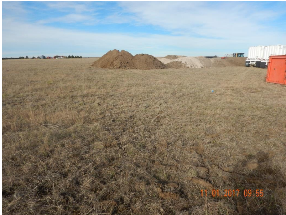
Photo 17: Photo taken from the southeast area of the location, facing west. Photo shows equipment has been brought onto the location. Photo shows that, with exception to a pit on the south end, no topsoil salvage on the location has occurred. All equipment and materials have been placed directly on the surface of the soil.