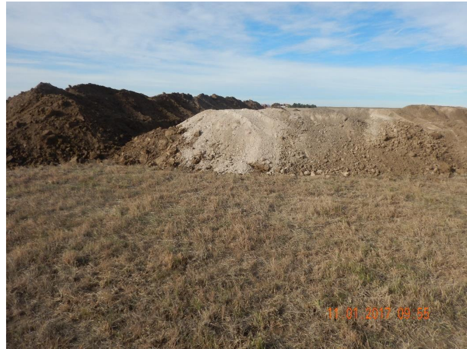
Photo 20: Photo taken from the east end of the pit. Photo shows soil horizons to not appear to be stored separately from one another per 1002.b.