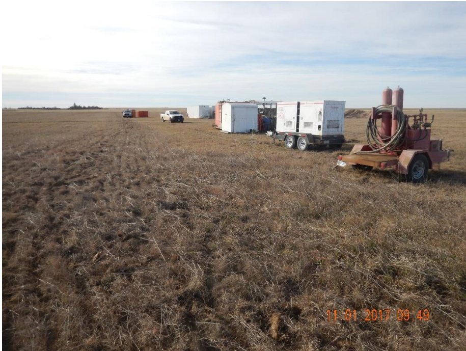
Photo 2: Photo taken from the northeast area of the location, facing south. Photo shows equipment has been brought onto the location. Photo shows that, with exception to a pit on the south end, no topsoil salvage on the location has occurred. All equipment and materials have been placed directly on the surface of the soil.