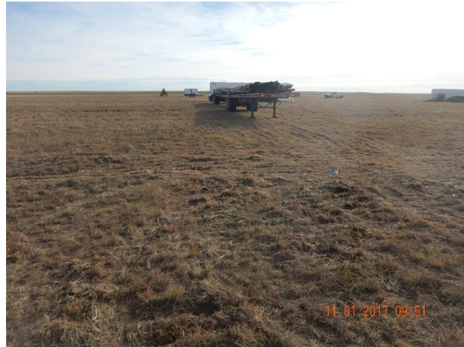
Photo 7: Photo taken from the northwest end of the location, facing east. See comments under photo 6.