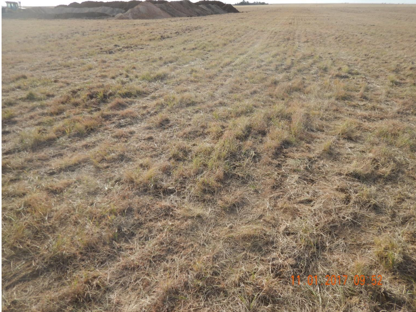
Photo 10: Photo taken from the center of the current location. Photo shows vegetation is a rangeland composed of Blue and Sideoats Grama, Western Wheat, Sand Dropseed, etc... Photo also shows that, with exception to a pit on the south end, no topsoil salvage on the location has occurred.