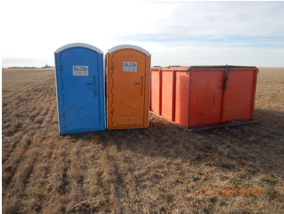
Photo 19: Photo taken from the southeast end of the location, facing south. Photo shows equipment and porta-johns on site. Portable toilets do not appear to have been anchored down per good engineering practices.