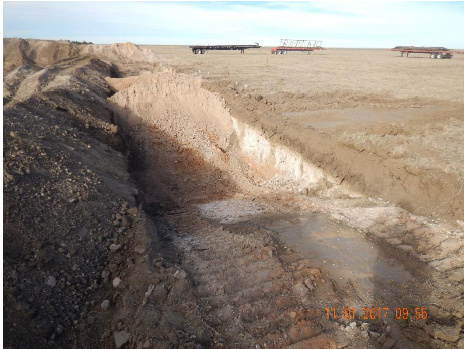
Photo 21: Photo taken from the north end of the location, facing west. Photo shows pit that has been constructed.