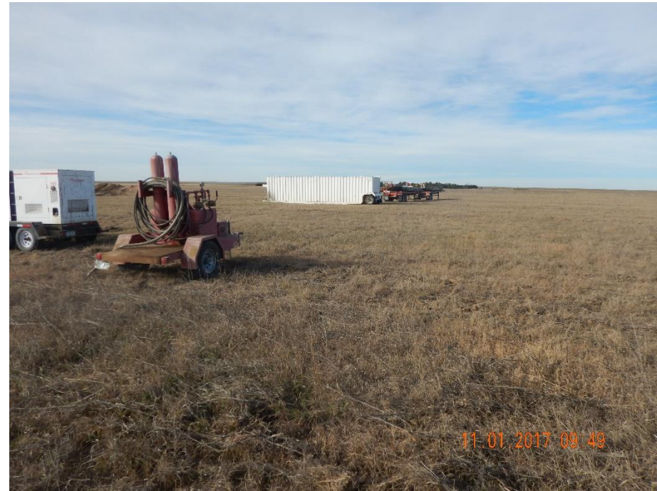
Photo 3: Photo taken from the northeast area of the location, facing west. See comments under photo 2.