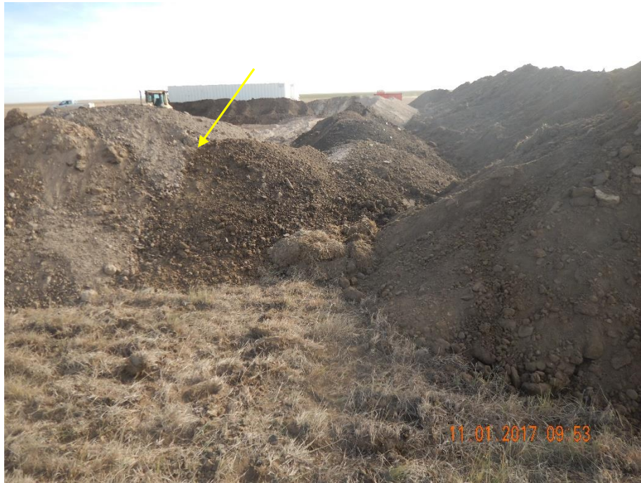
Photo 15: Photo taken from the west end of the pit. Photo shows soil horizons do not appear to be stored separately from one another per 1002.b.