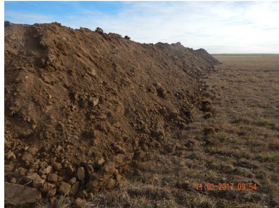
Photo 16: Photo taken from the south end of the pit, facing east. Photo shows topsoil pile has not been stabilized with good engineering practices. Photo also shows that surface roughening appears to have been implemented throughout the site. Surface roughening is a temporary BMP that should be used in conjunction with other BMPs. Additional BMPs will be required.