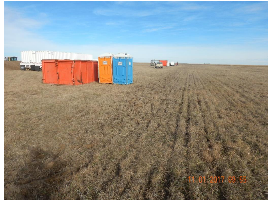
Photo 18: Photo taken from the southeast area of the location, facing north. See comments under photo 17.