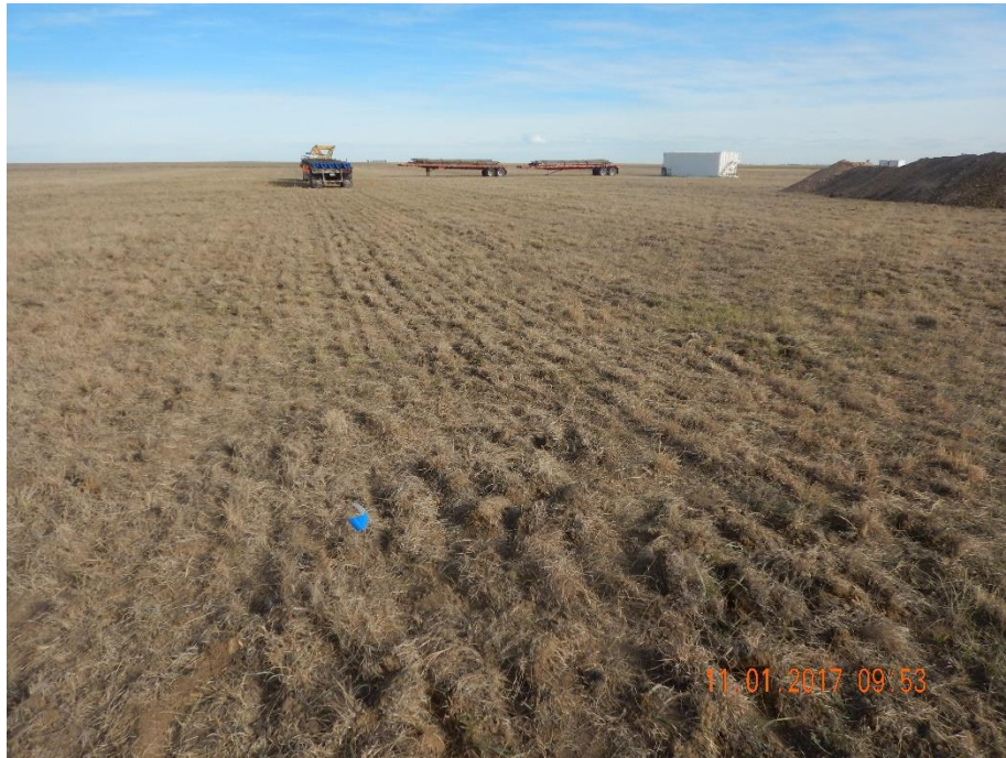
Photo 13: Photo taken from the southwest area of the location, facing north. Photo shows equipment has been brought onto the location. Photo shows that, with exception to a pit on the south end, no topsoil salvage on the location has occurred. All equipment and materials have been placed directly on the surface of the soil.