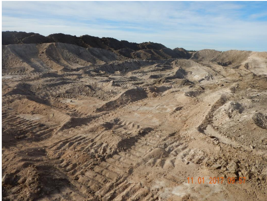
Photo 25: Photo taken from the within the pit, facing west. Photo shows soil horizons to not appear to be stored separately from one another per 1002.b.