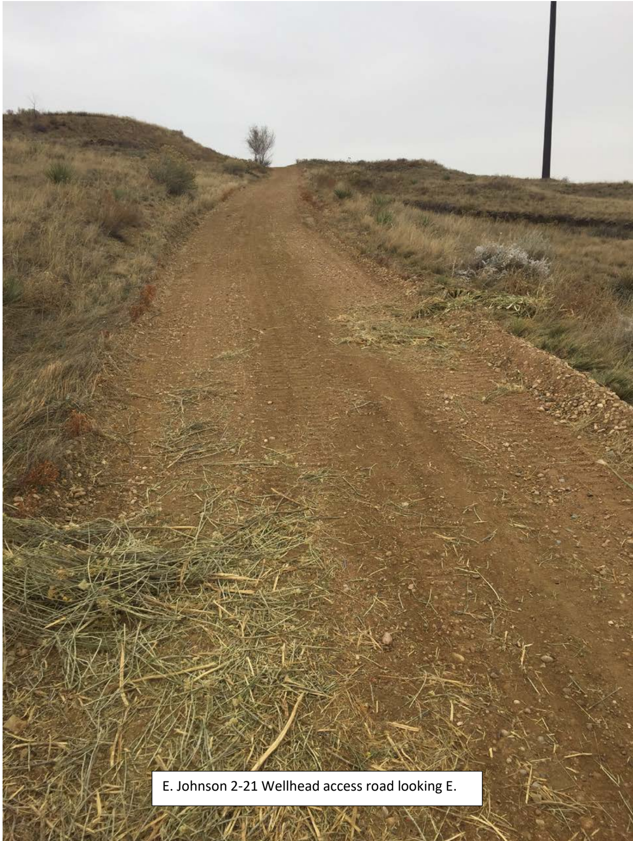
E. Johnson 2-21 Wellhead access road looking E.