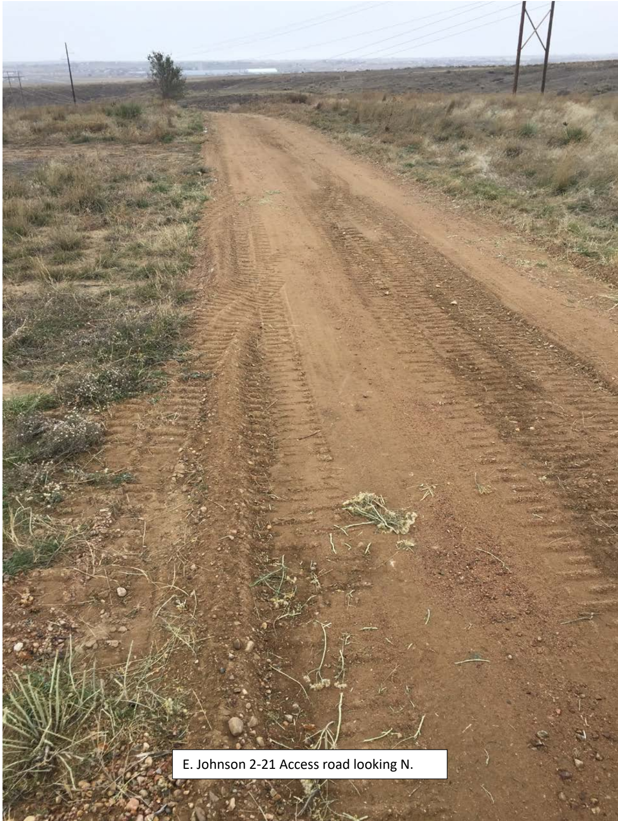
E. Johnson 2-21 Access road looking N.