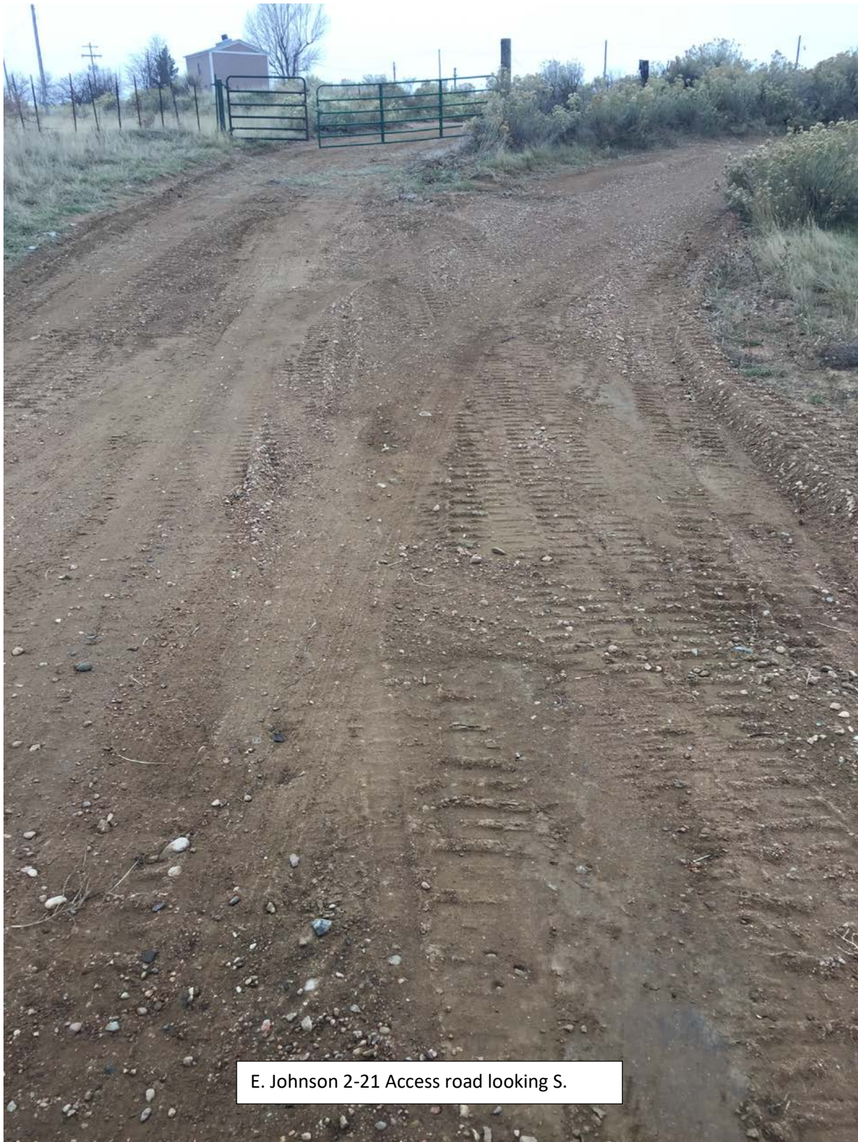
E. Johnson 2-21 Access road looking S.