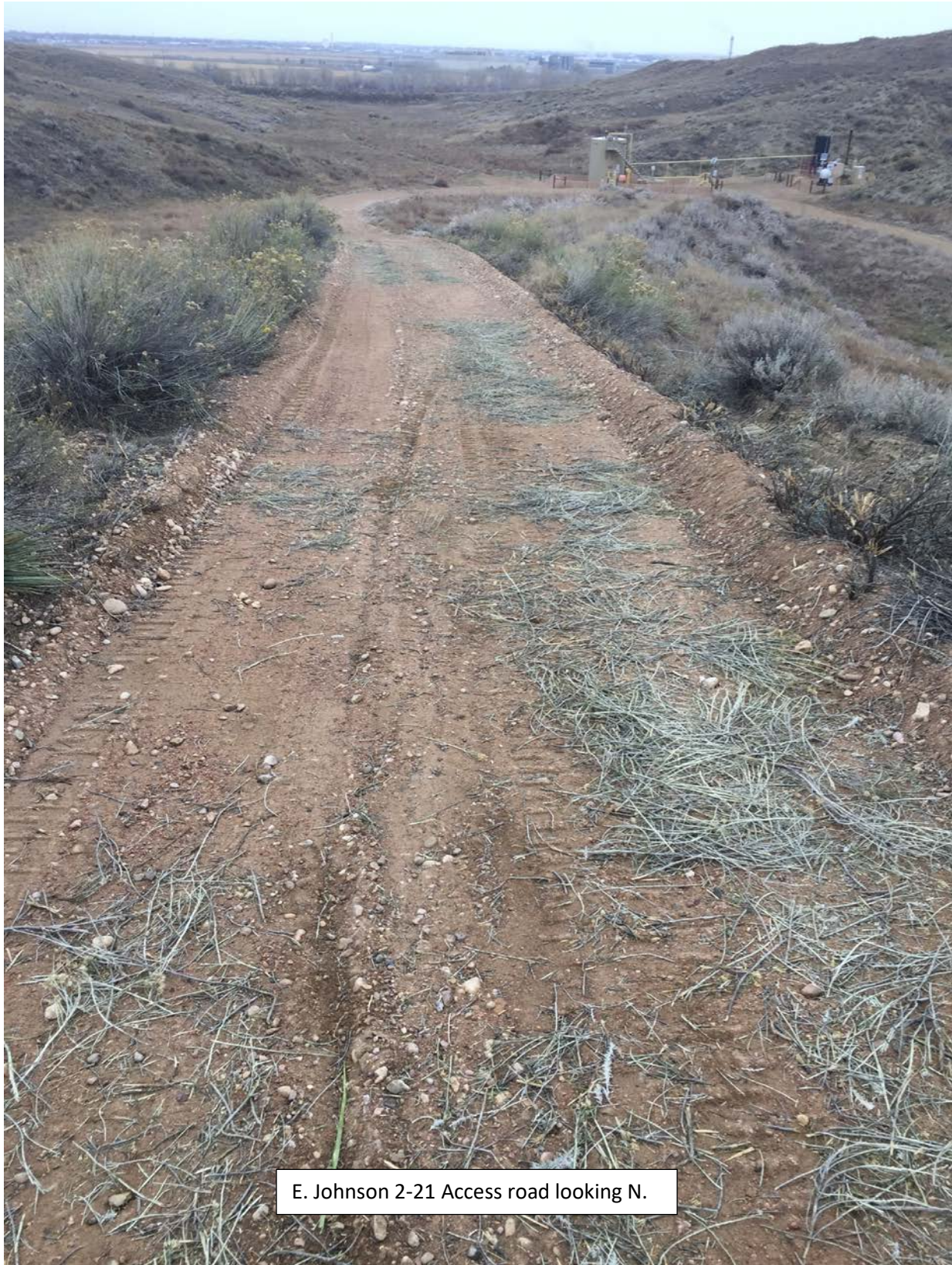
E. Johnson 2-21 Access road looking N.