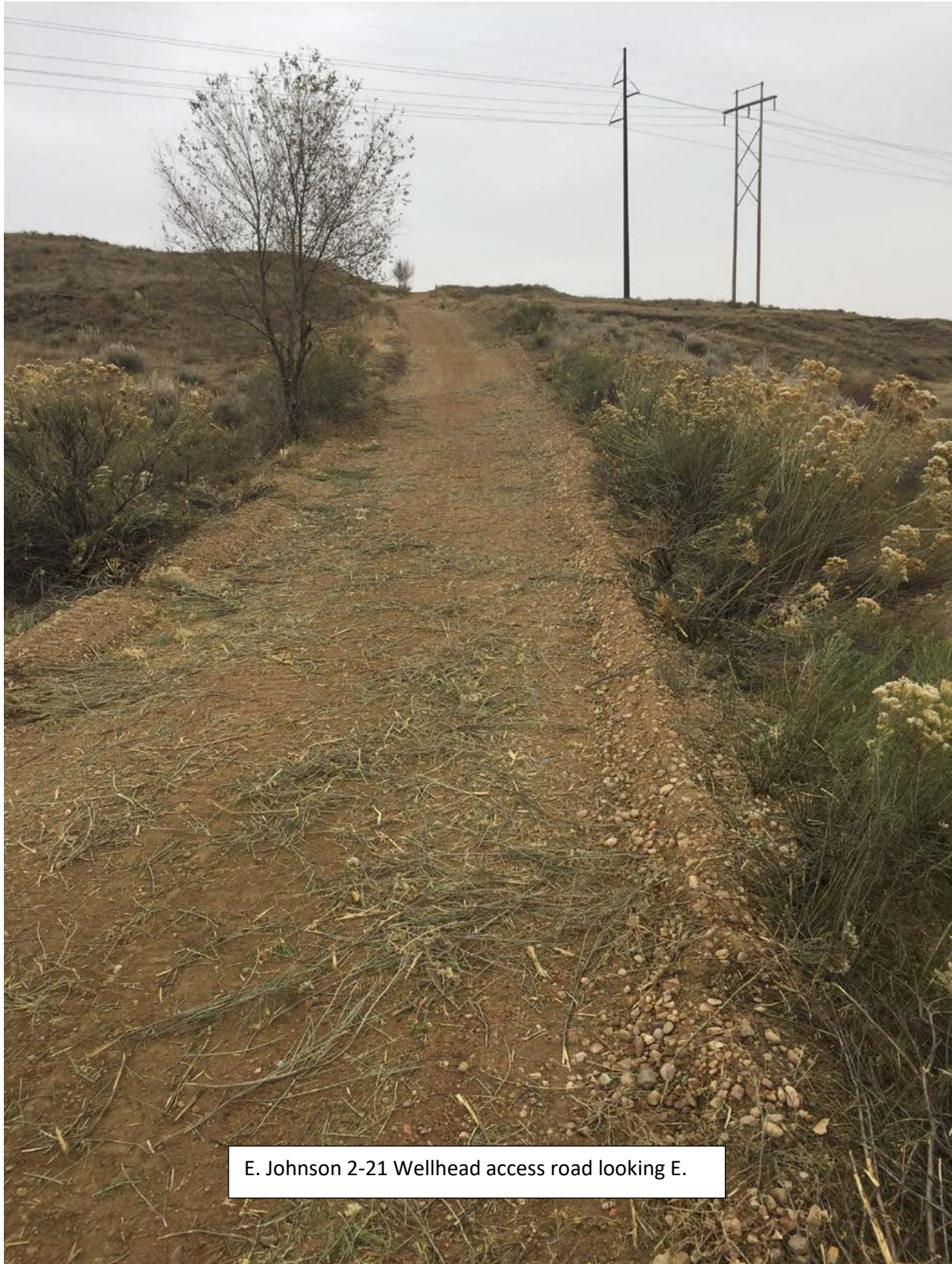
E. Johnson 2-21 Wellhead access road looking E.