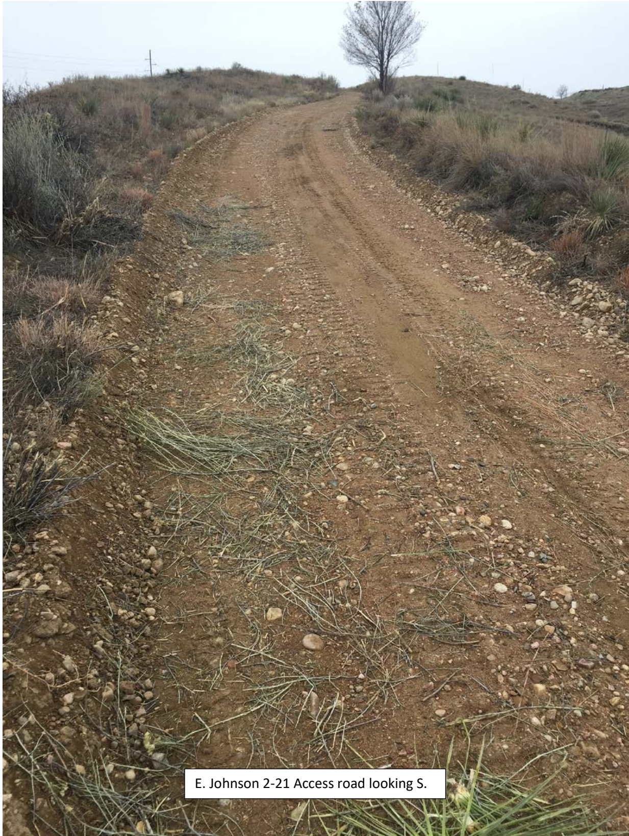
E. Johnson 2-21 Access road looking S.