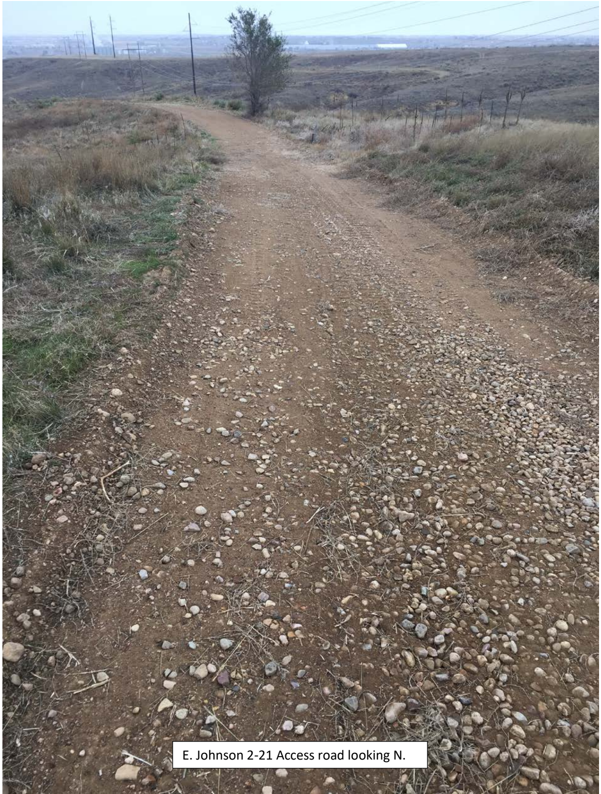
E. Johnson 2-21 Access road looking N.