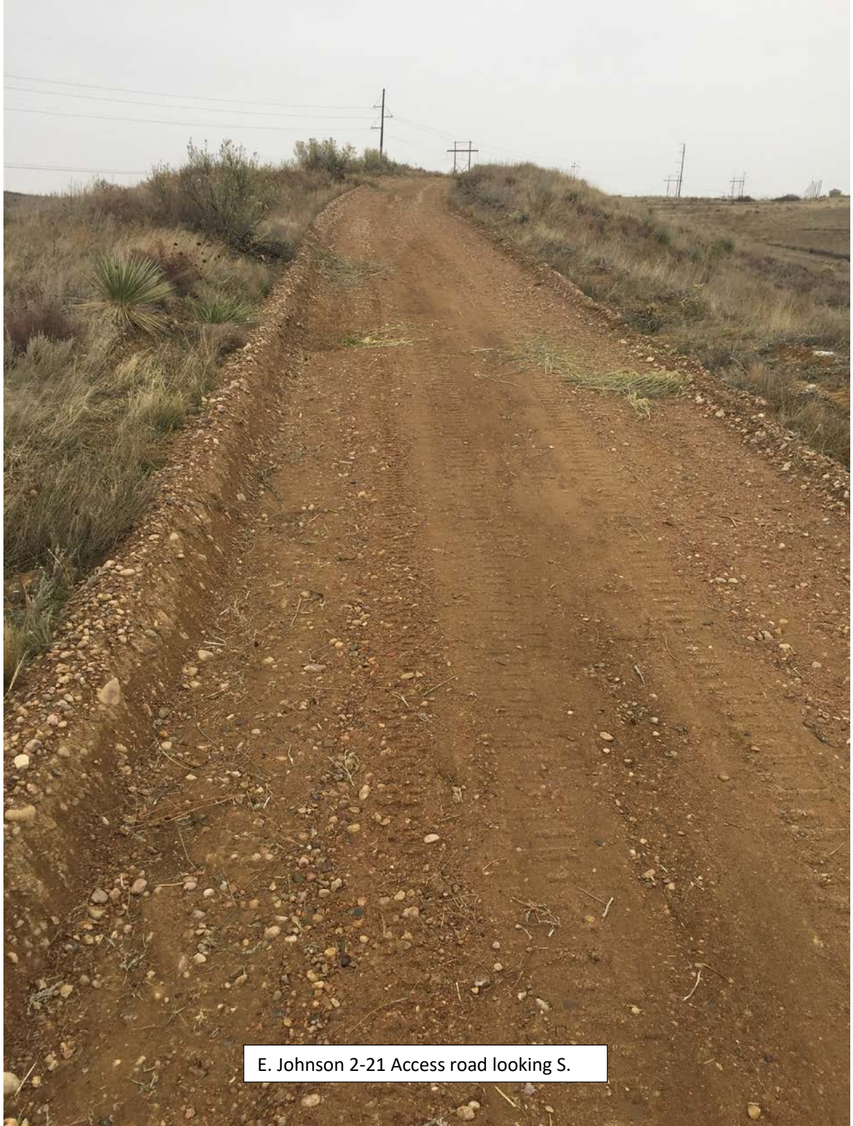
E. Johnson 2-21 Access road looking S.