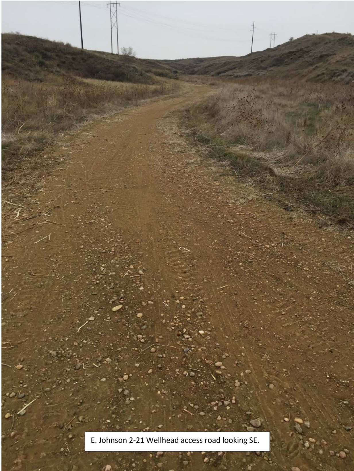
E. Johnson 2-21 Wellhead access road looking SE.