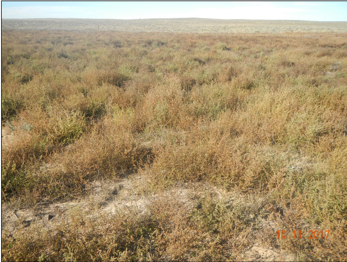
Photo 5. Center of the location facing west. There are undesirable weeds throughout the location (Russian thistle).