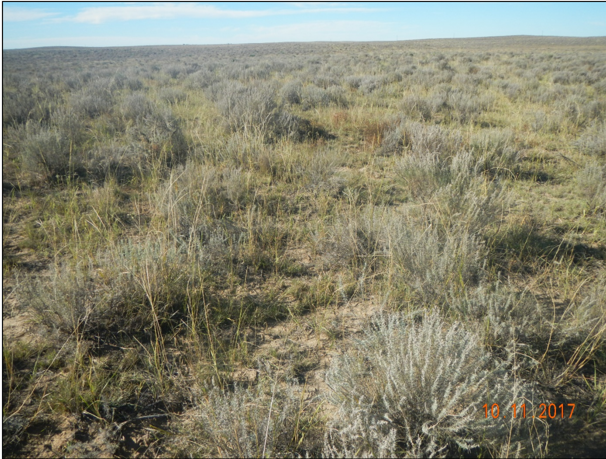
Photo 7. Facing north off the location toward the undisturbed vegetation.