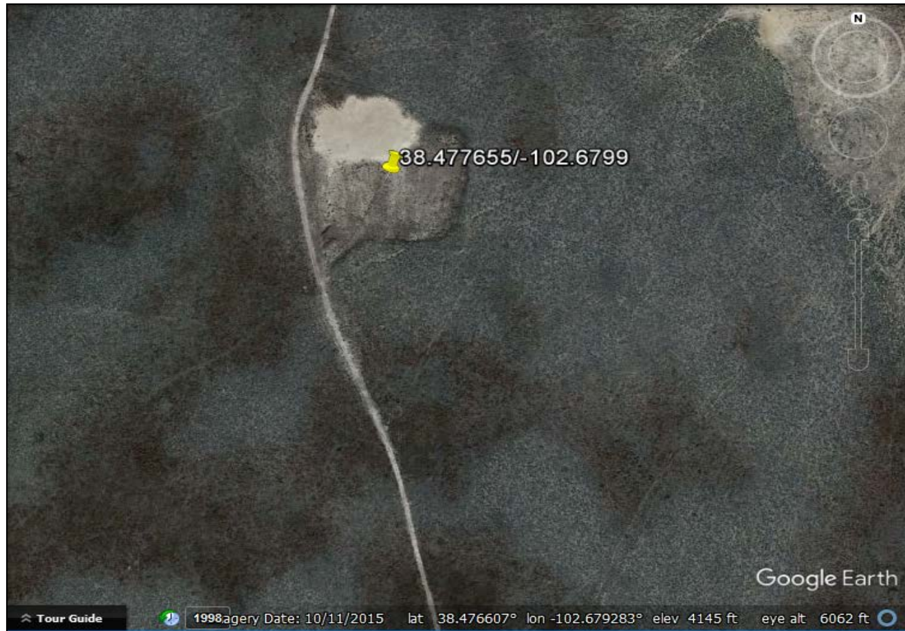
Photo 1. 2015 aerial image shows access road and location disturbance.