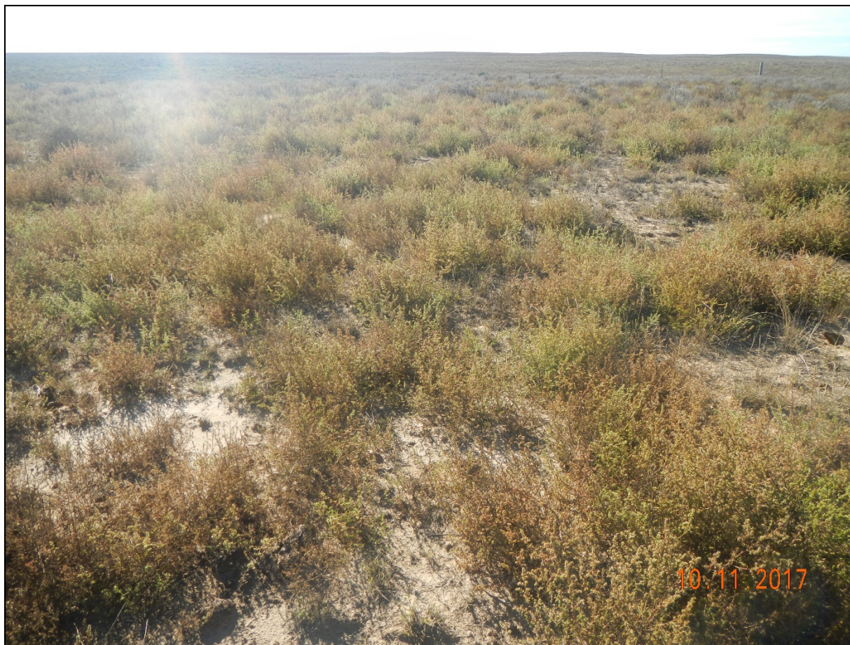
Photo 6. Center of the location facing south.