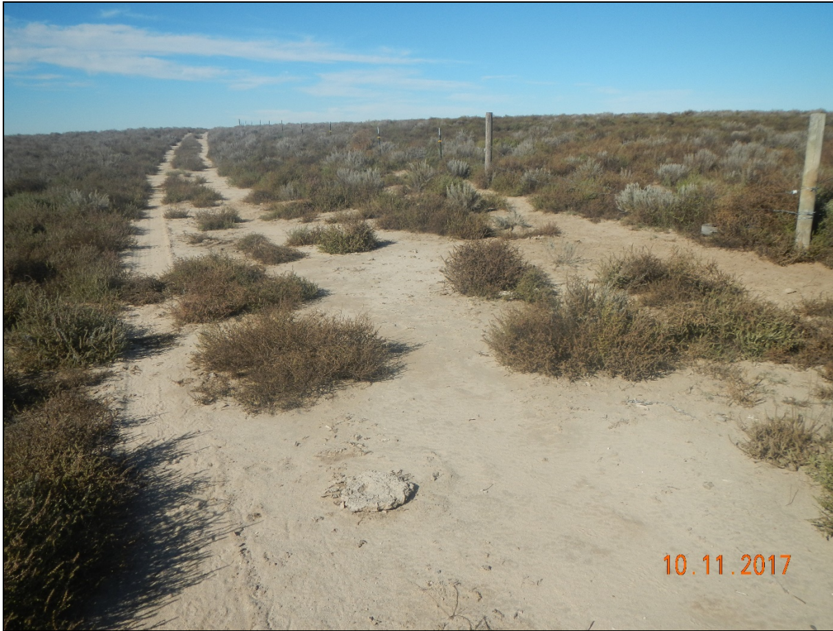
Photo 3. Facing northeast toward the location. The location has a perimeter fence that is not maintained.