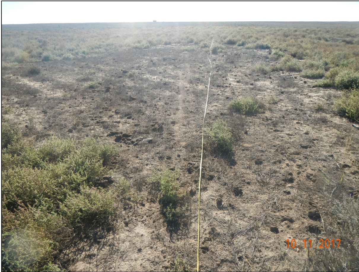
Photo 9. East side of the location facing west. A 100 ft. tape measure shows the extent of this portion of the location without any desirable vegetation establishment.