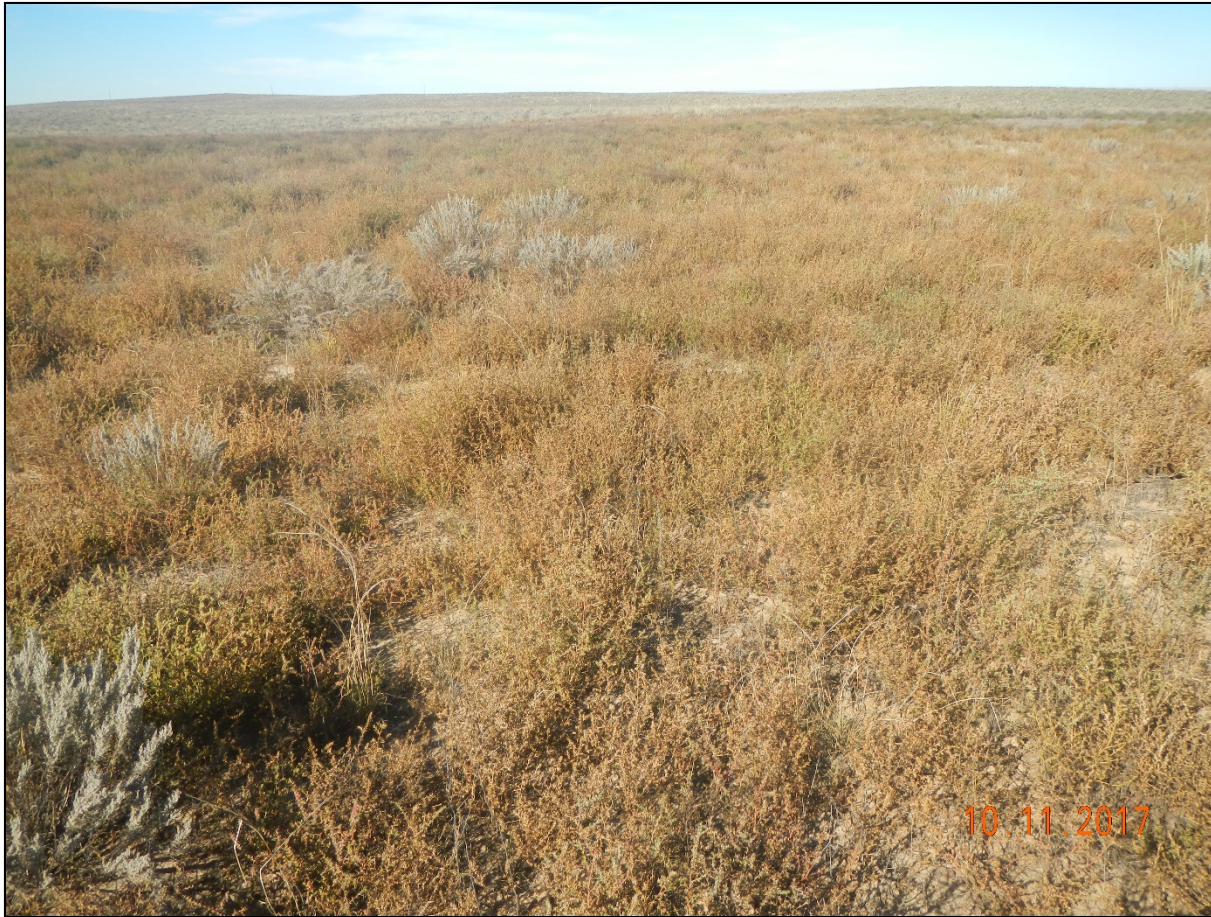
Photo 4. Center of the location facing north. There are undesirable weeds throughout the location (Russian thistle).