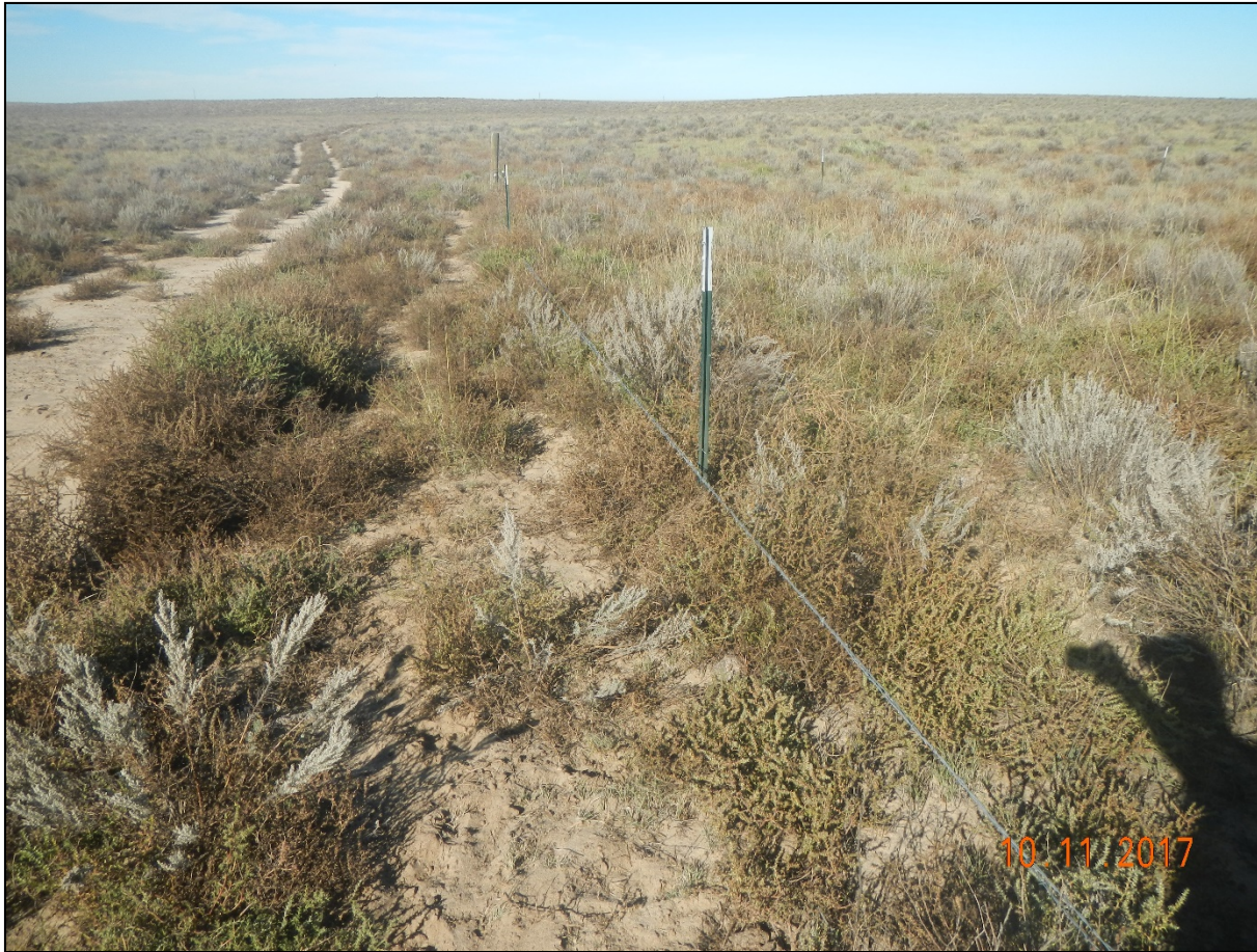
Photo 10. The fence around the location is not maintained. The barbed wire is only about 1 ft. off the ground and livestock can access the site.