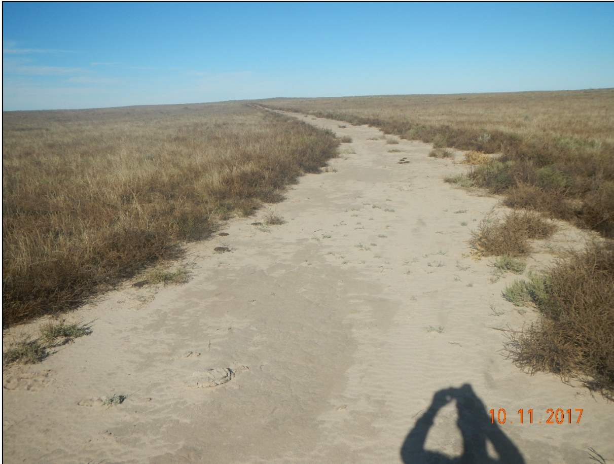
Photo 2. Facing northeast toward the access road which has not been reclaimed.