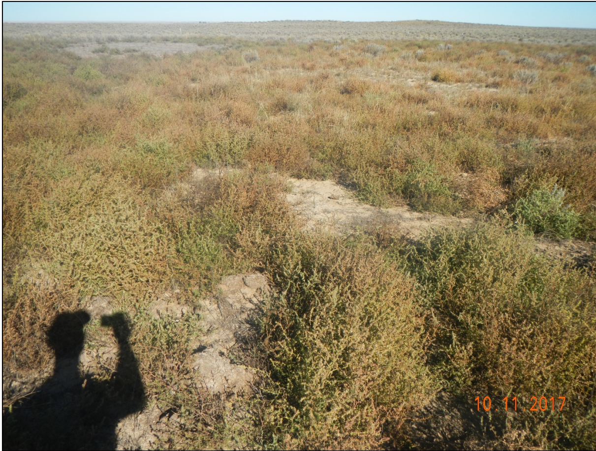
Photo 7. Center of the location facing east.