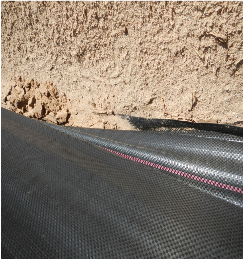
Portions of Fence showing poor installation