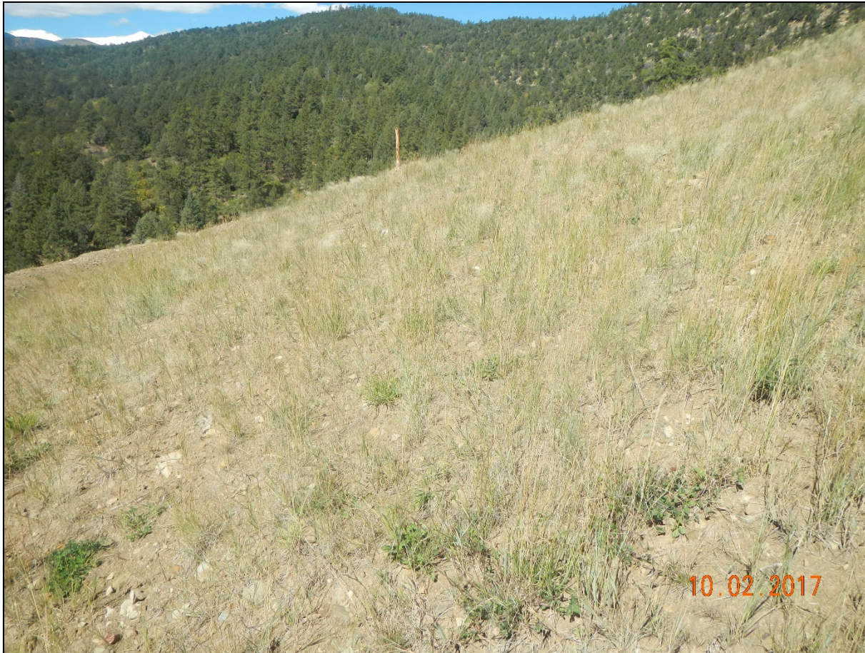
Photo 13. Facing west toward the location. A permanent well marker is installed at the center of the location.