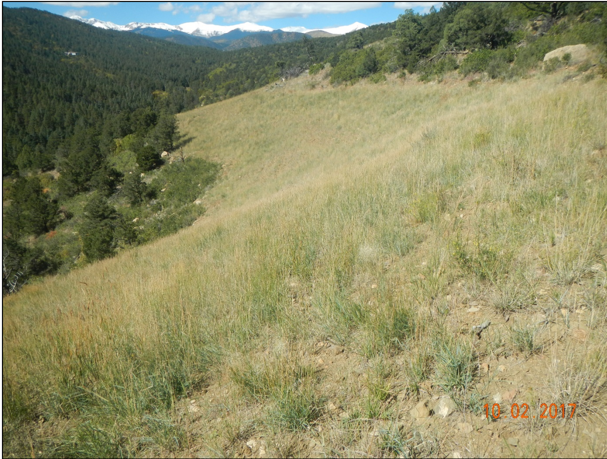
Photo 12. Facing west along the reclaimed access road near the location.