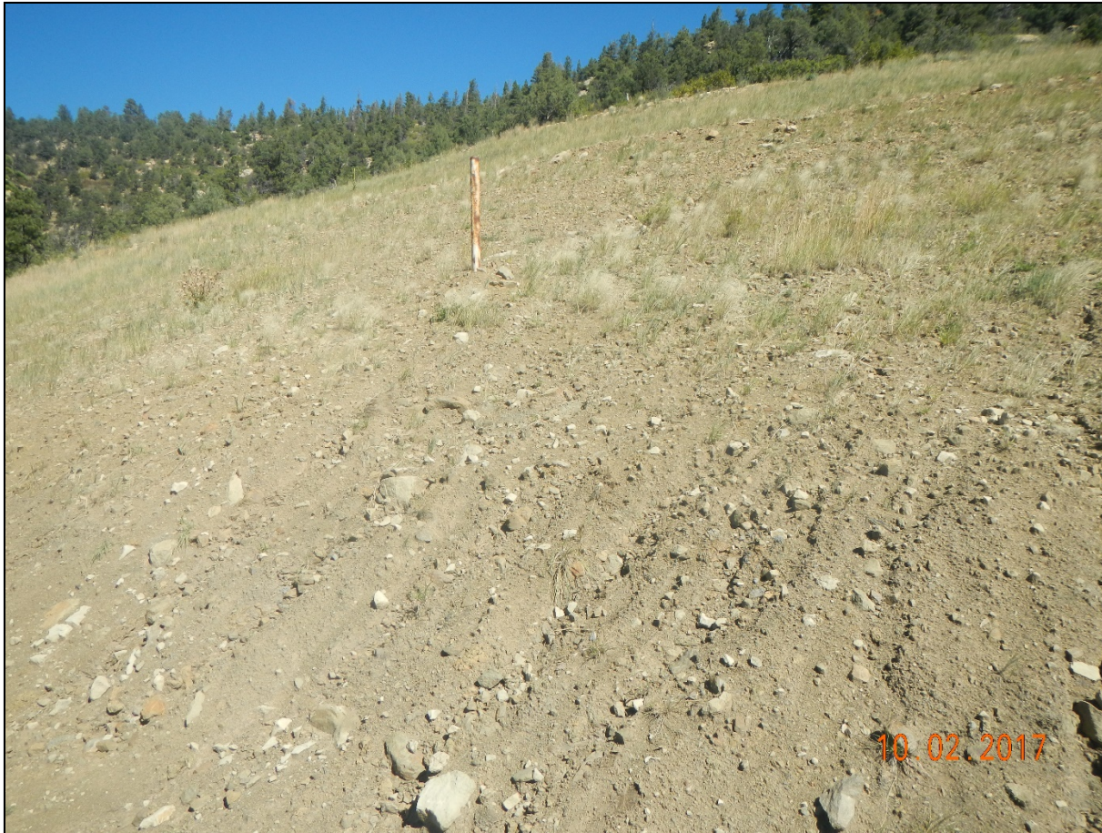
Photo 18. Facing north at the location. Well marker can be seen in the photo.