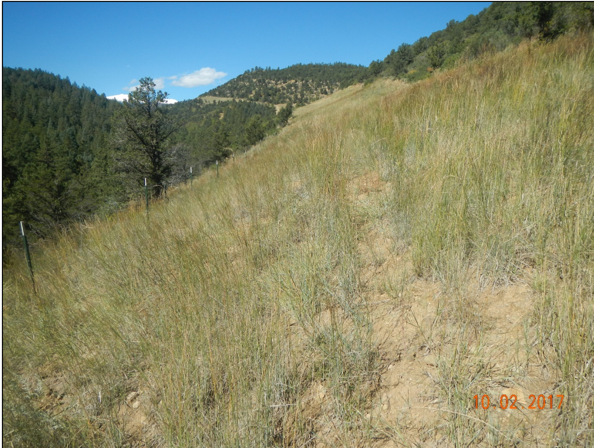
Photo 4. Facing northwest along the reclaimed access road.