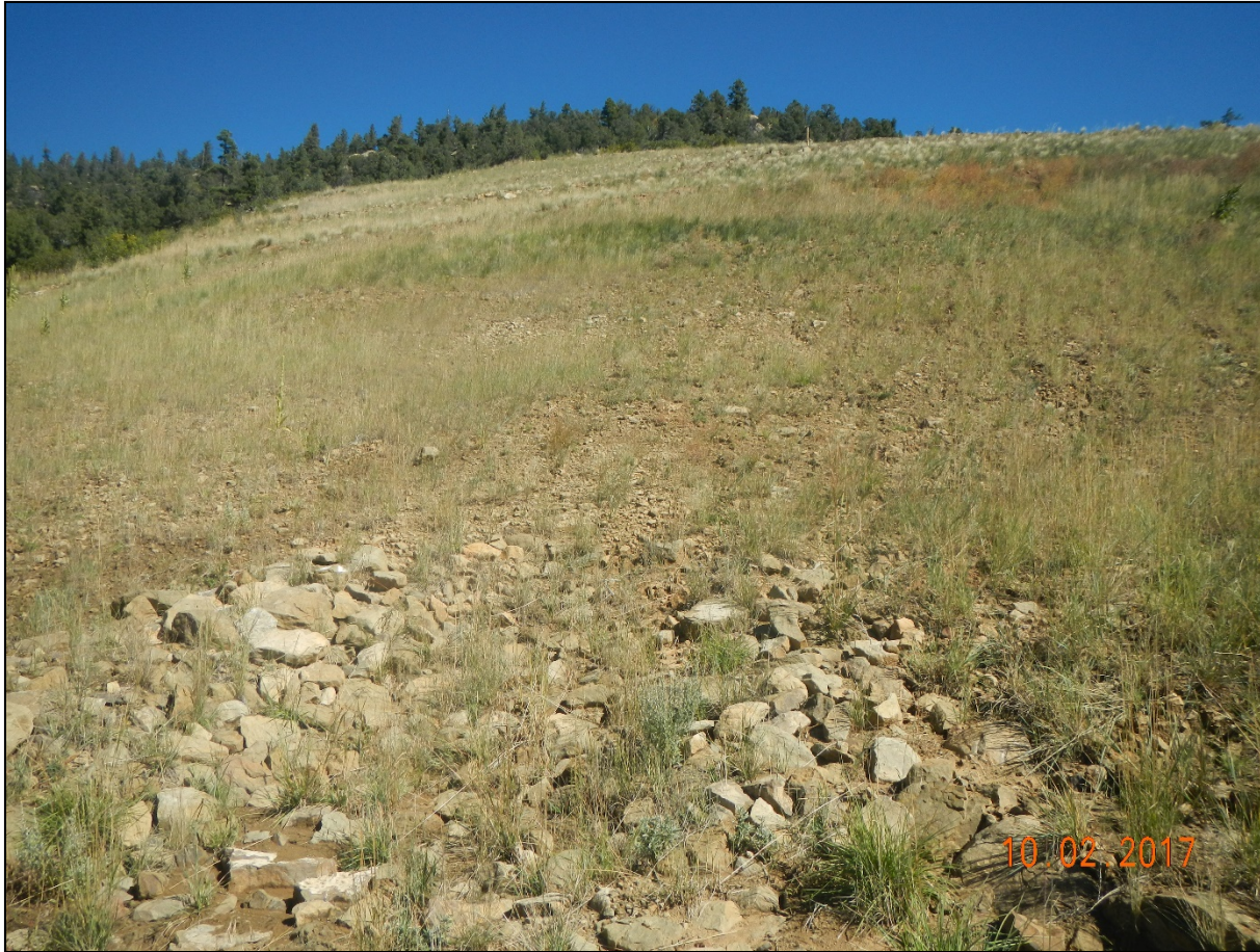
Photo 22. Bottom south side of the location facing north. Overall revegetation is establishing well throughout the location.