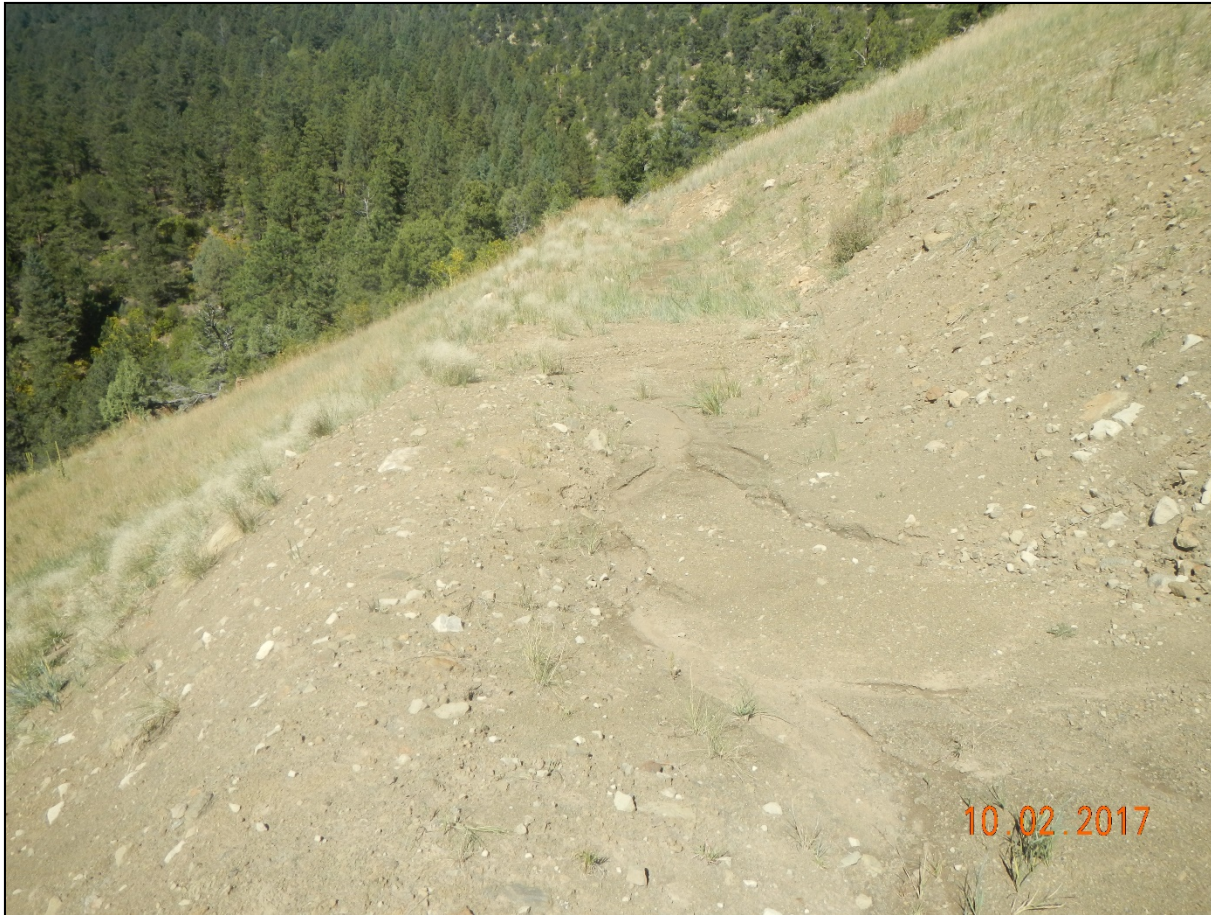
Photo 19. Sediment has filled into the diversion ditch causing stormwater to be directed down the center of the location.