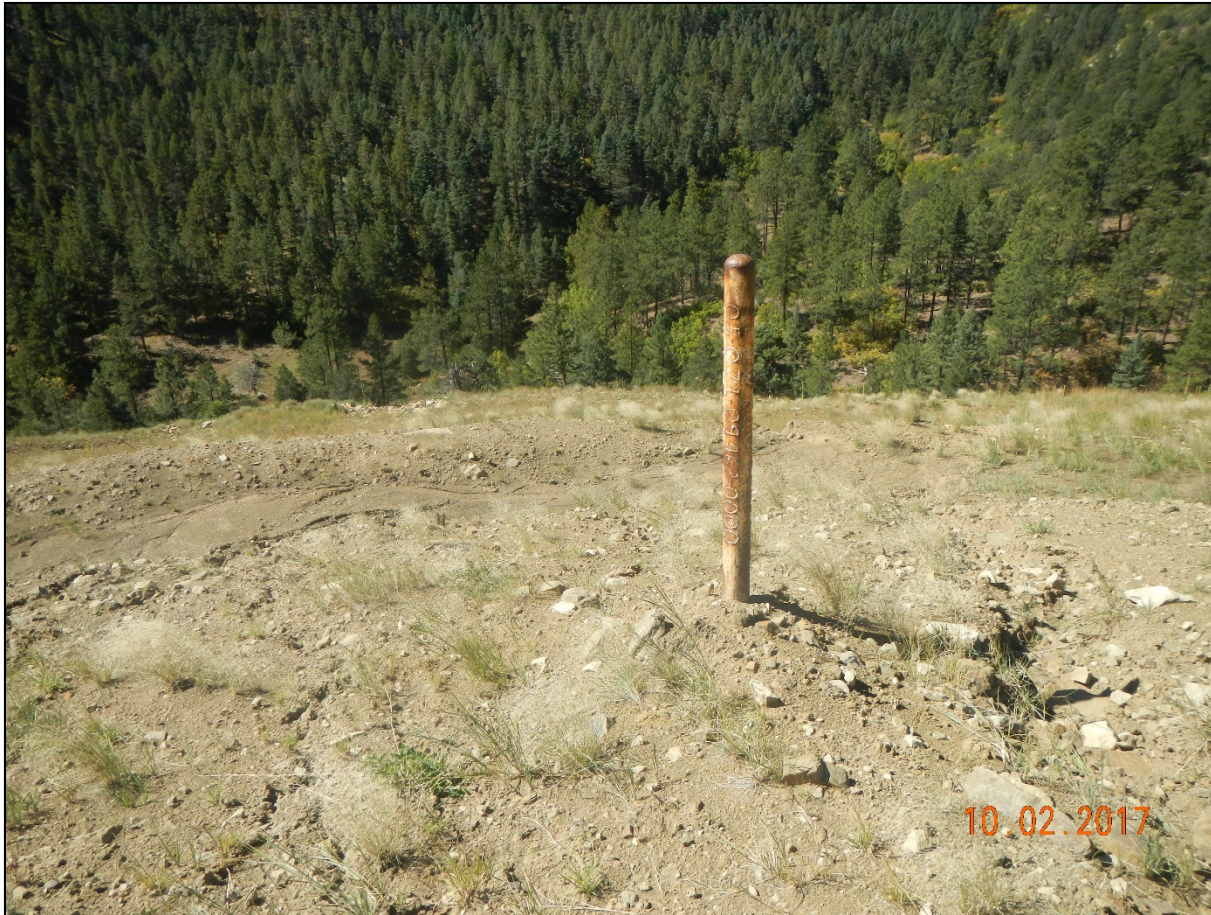
Photo 17. There is erosion occurring near the well marker.