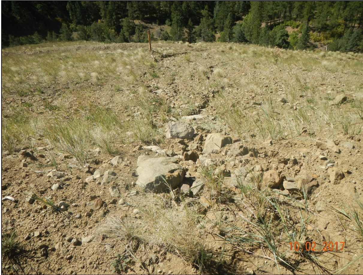
Photo 16. Sediment has filled in the diversion ditch causing stormwater to be directed down the center of the location causing erosion.