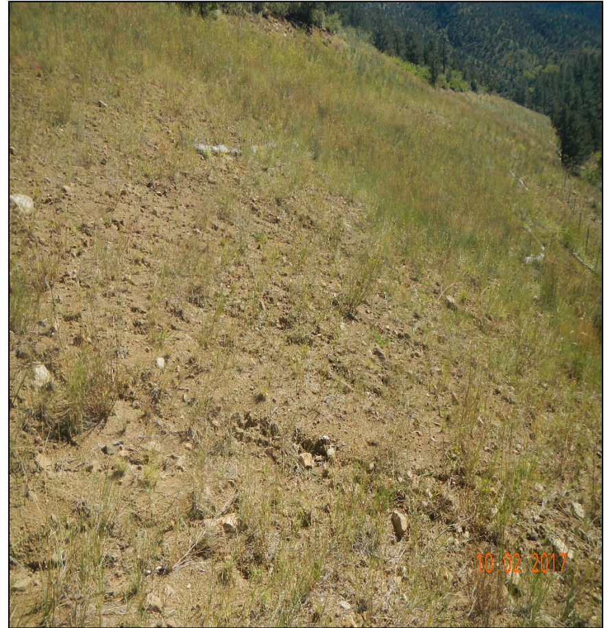
Photo 5. This area along the access road has less vegetation and erosion issues beginning to occur. The straw wattles have filled in with sediment.