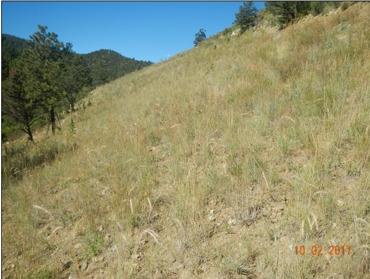
Photo 3. Facing west along the reclaimed access road.