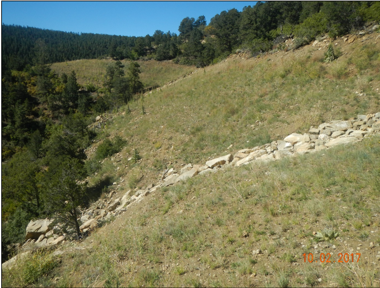
Photo 7. Facing southwest where reclamation area cross two natural drainages. Rock rip/rap was installed in these areas.