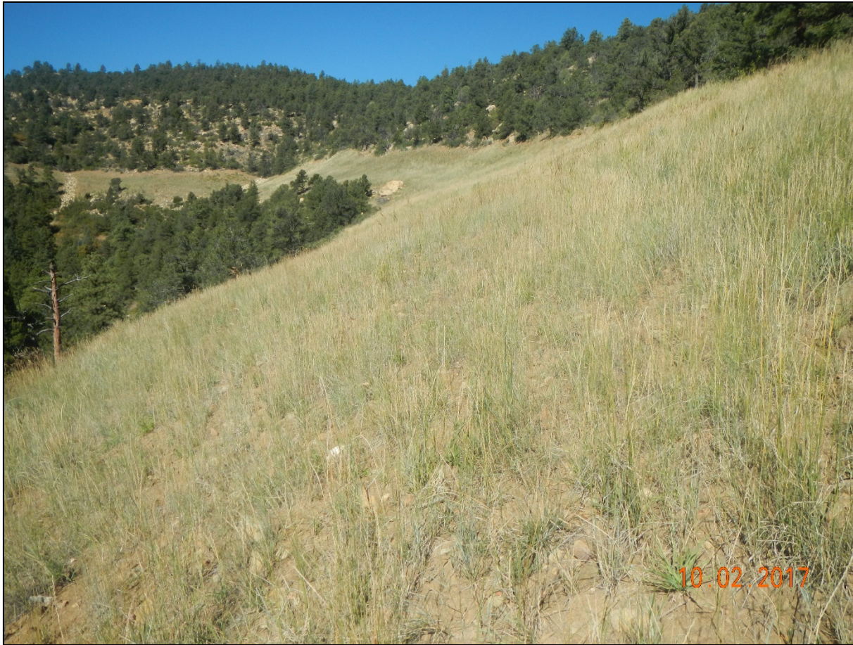
Photo 6. Facing northwest along the reclaimed access road. Vegetation is establishing throughout the reclamation area.