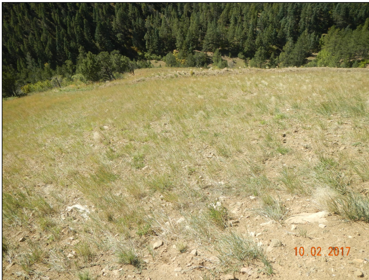
Photo 14. Facing down the slope at the location.