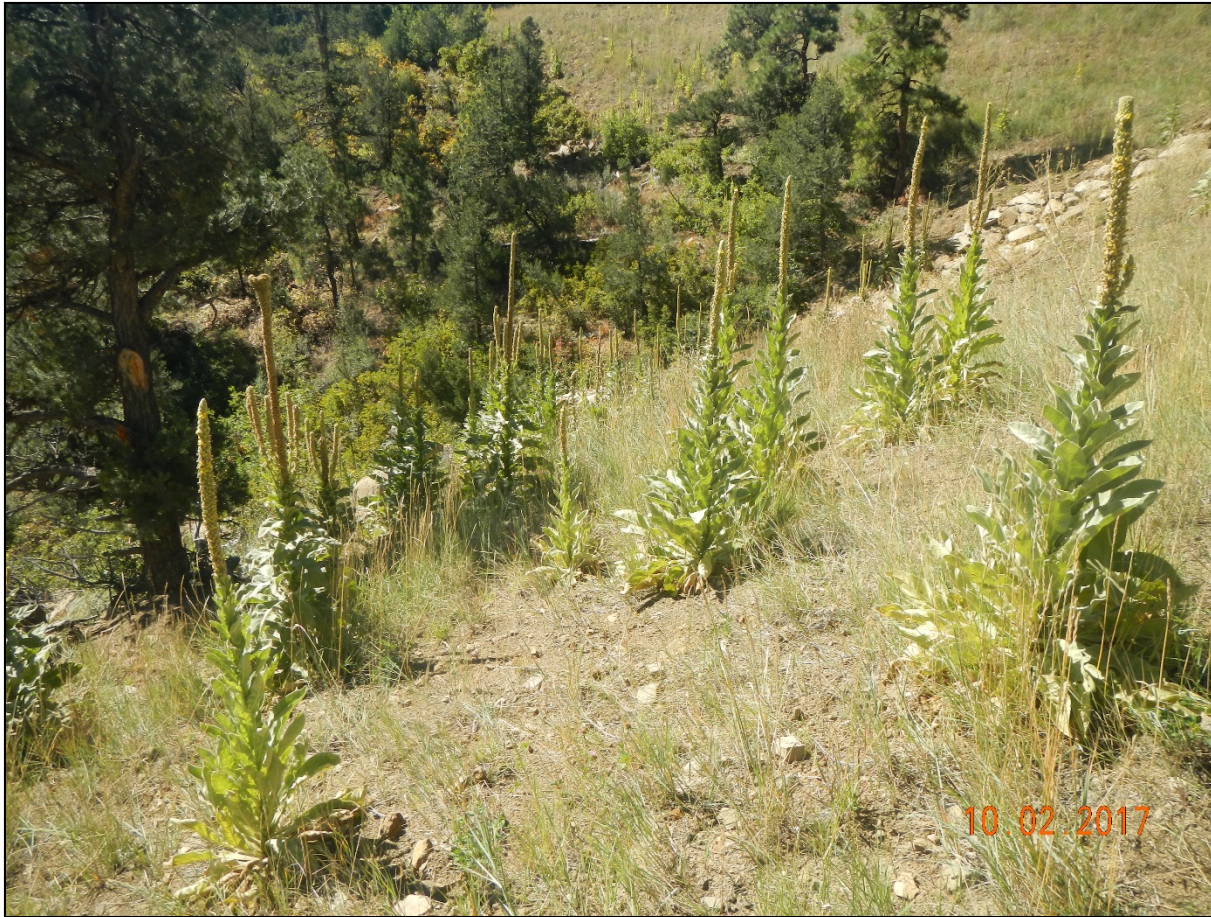
Photo 8. There are a few areas along the reclaimed access road where List C noxious weeds, Common mullien has established.