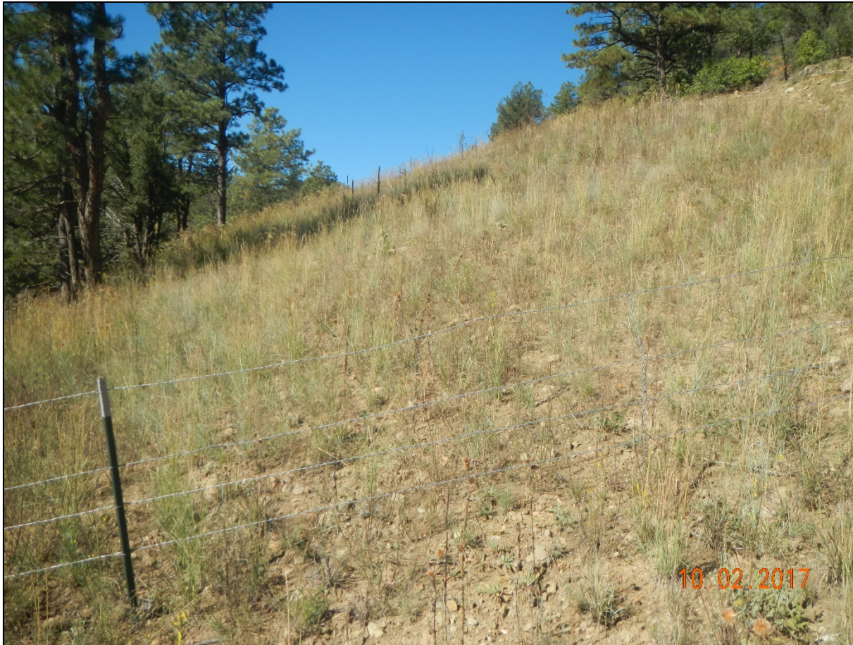
Photo 2. Beginning of the reclaimed access road standing from the county road.