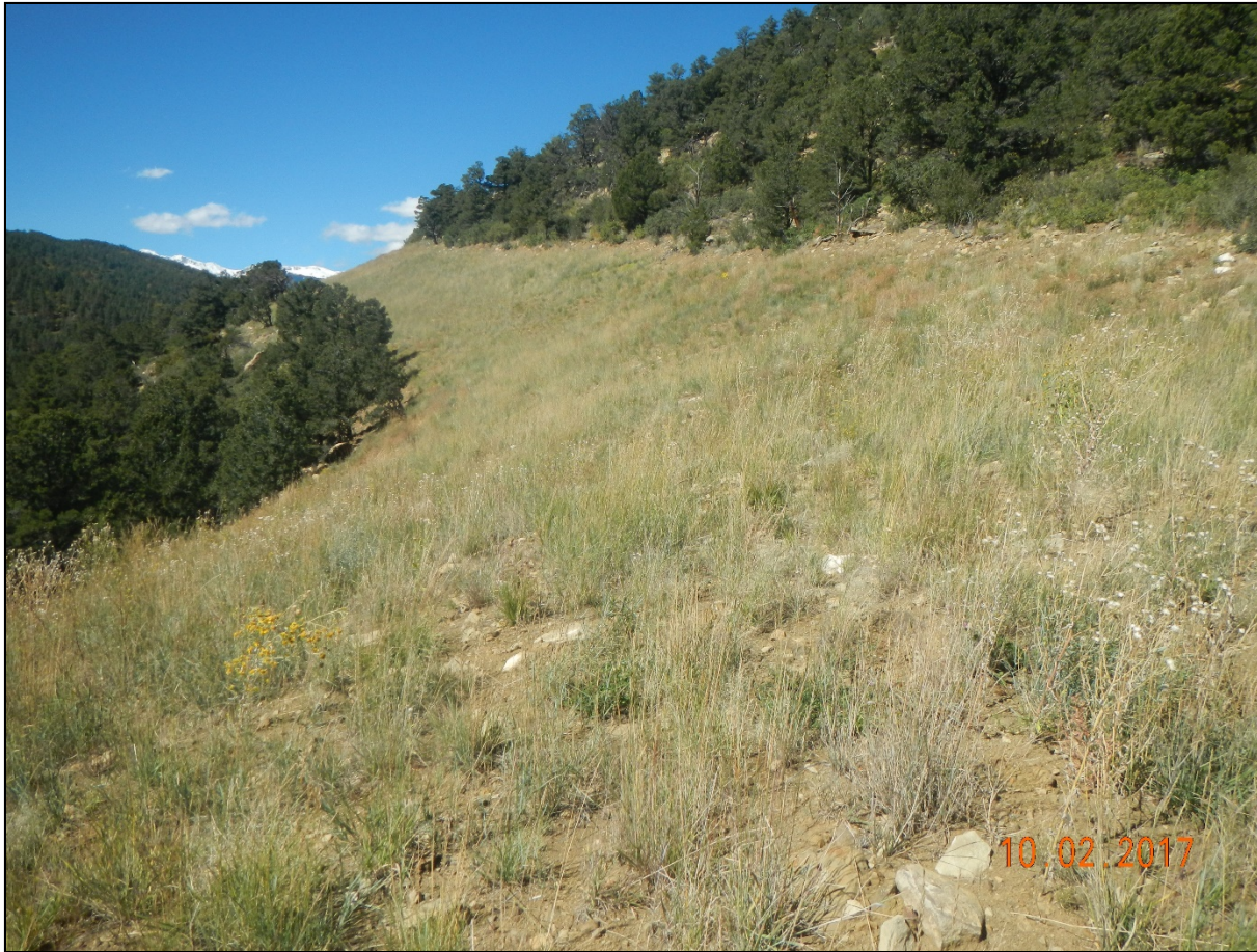
Photo 10. Facing west along the reclaimed access road.