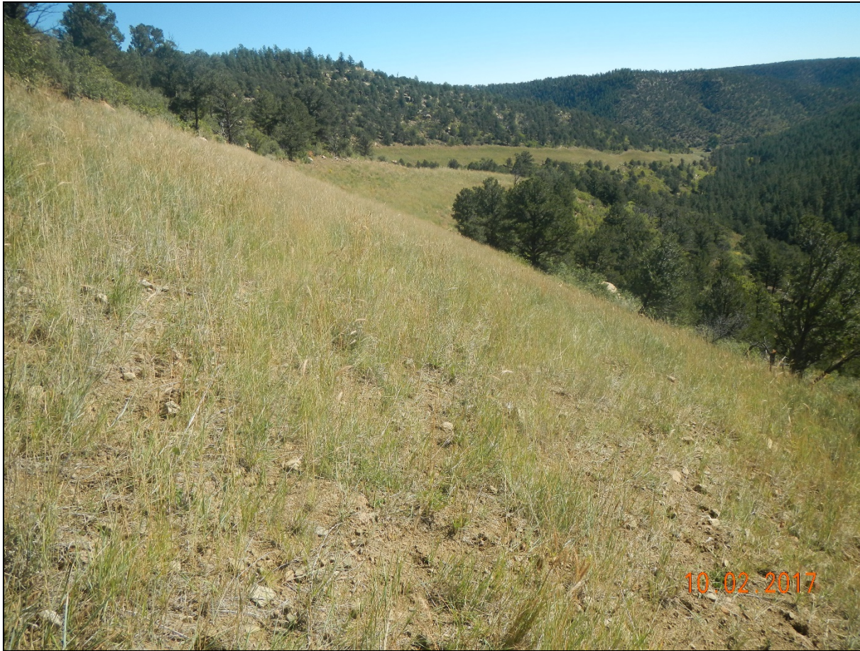
Photo 11. Facing back toward the east along the reclaimed access road.