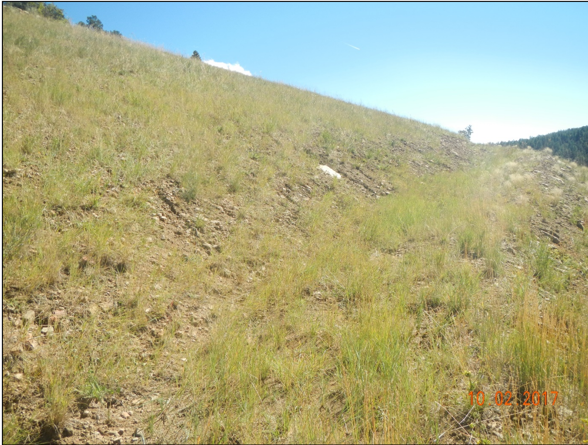
Photo 15. Facing east at the location. There are diversion ditches installed along the contour of the location.