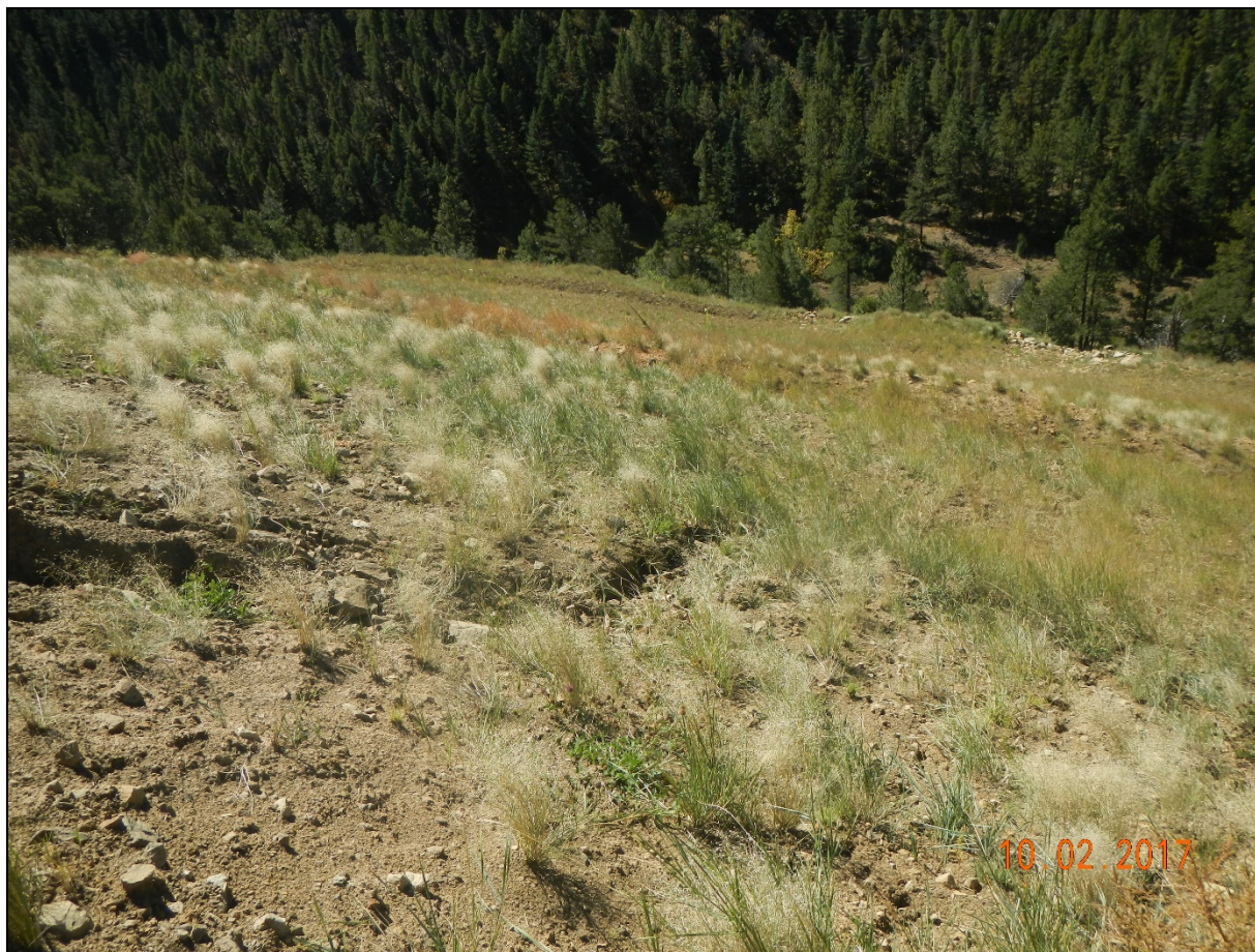
Photo 20. Facing down southwest at the location.