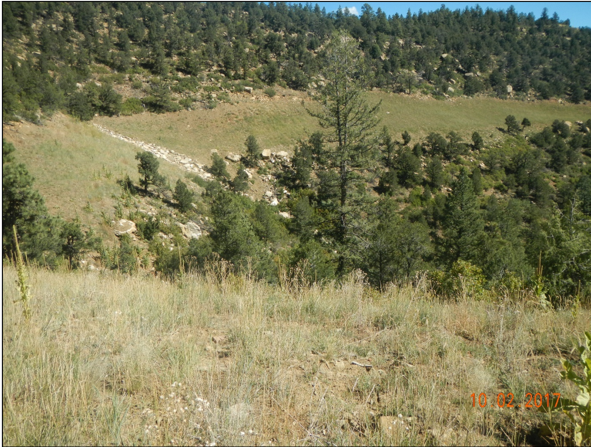
Photo 9. Facing back toward the northeast along the reclaimed access road.