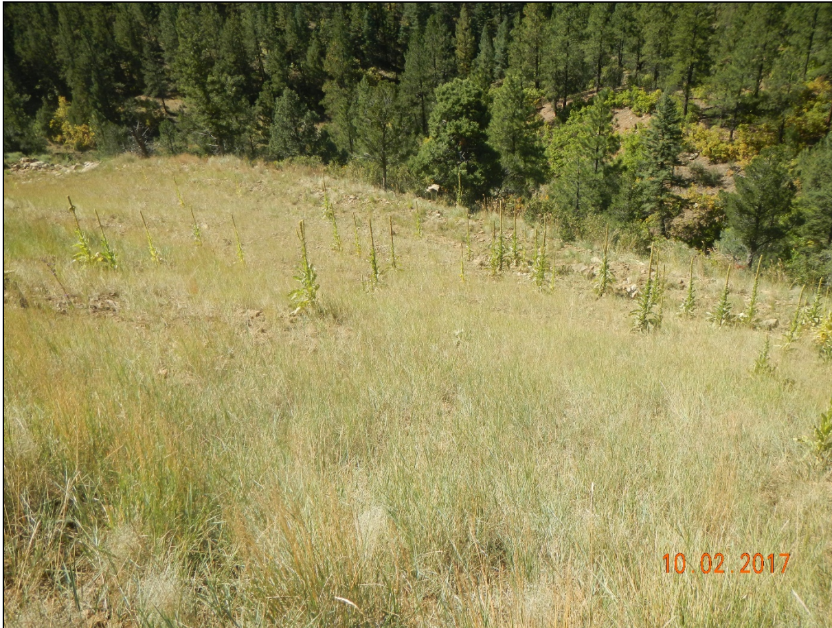
Photo 21. Facing toward the bottom of the location. There is some List C noxious weeds; Common mullien growing in this area.